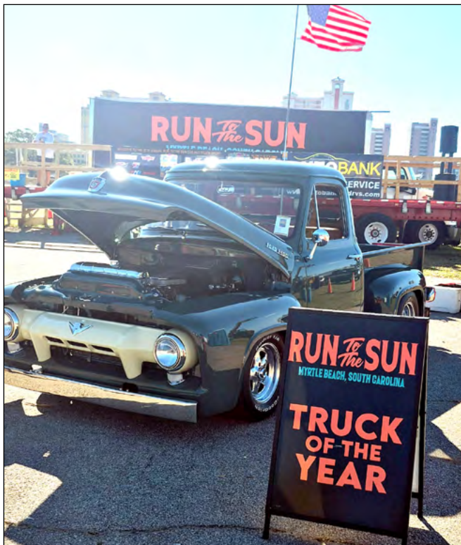
A favorite modified 1954 Ford pick up