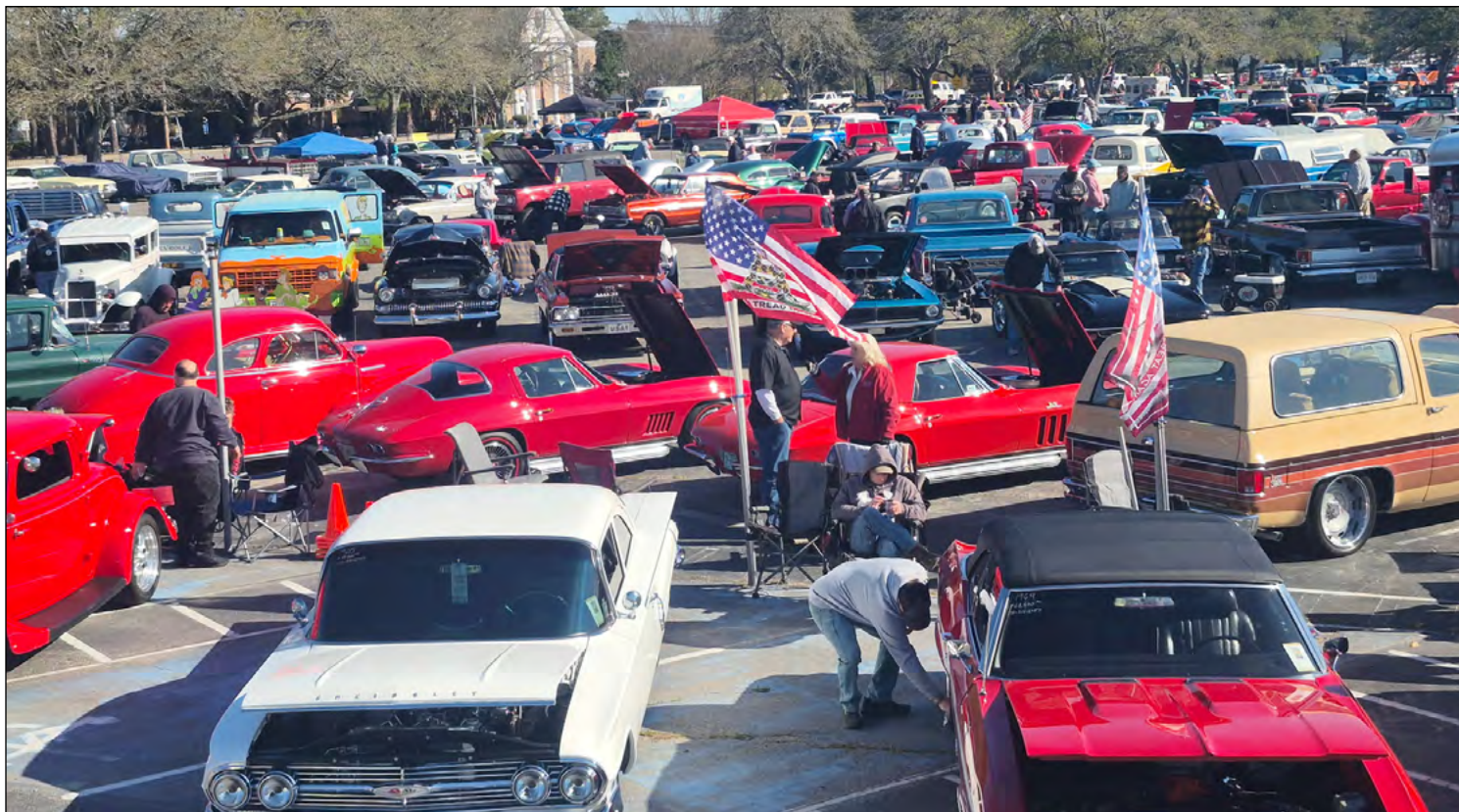
The 37th "Run To The Sun" car show in Myrtle Beach, South Carolina reached its cap of 3,200 participating cars for its 15th year in a row.

It's wonderful when you travel south, you transition from heavily salted roads and snow covered banks to early flowering trees already showing their pink, red, or green color and Wysteria in full bloom that has circled the branches of a still sleeping tree to get to the highest point and bathe in the vibrant warm sun.