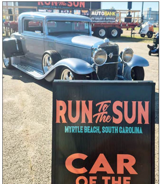
An early 1930s hot rod Cadillac coupe