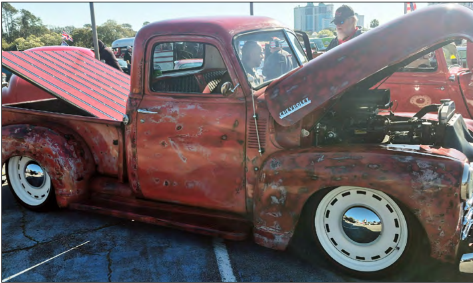
A modified 1950s Chevy pick up with clear finish preserving its patina, a muscle motor and a set of cool wheels.