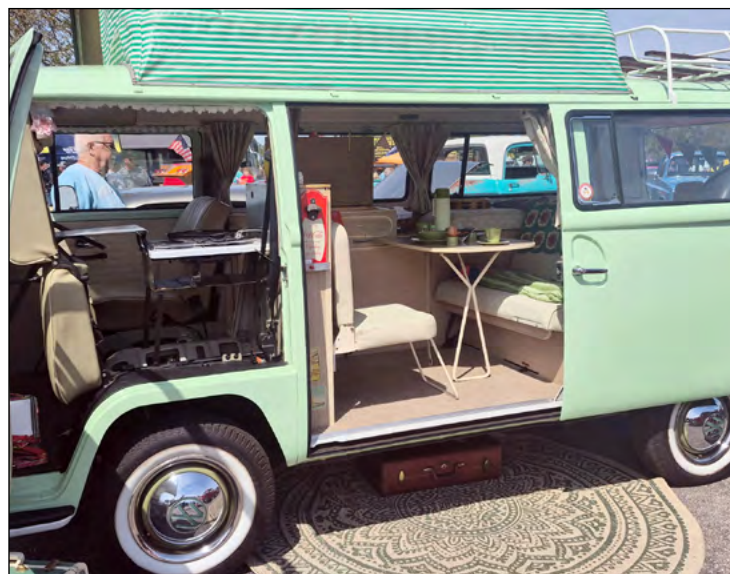
An immaculate Volkswagen bus camper was all decked out and ready to go, complete with fancy rug and leather suitcase below.

So, as you walk (crawl) up and down the marked rows, and the self-created overflow spots, you saw a lot of talking about restorations, inquiries regarding history, annual old friends, and wheeling/dealing on the price for a sale. The very first