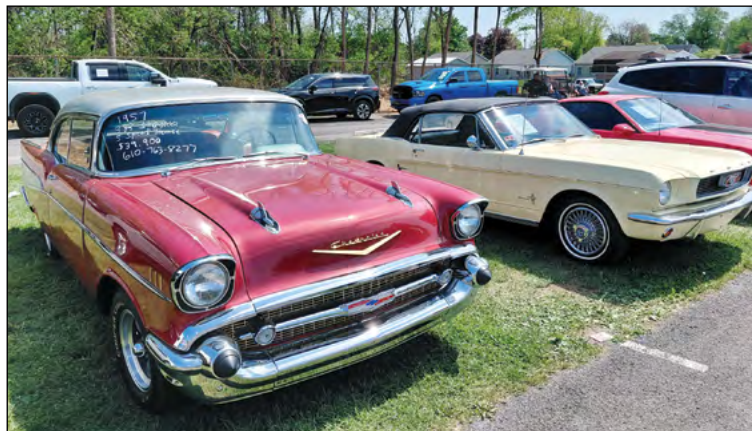
It's always great to see 1957 Chevys and 1960s Mustangs.