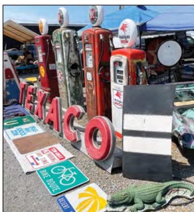
Antique gas pumps, road signs and a little green alligator - fun stuff!