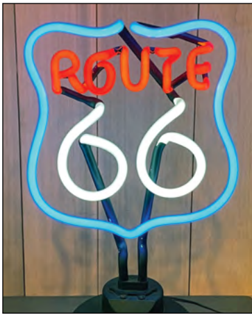
Artistic neon sign on display