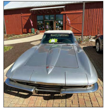
Phil Beattie's 1965 Corvette