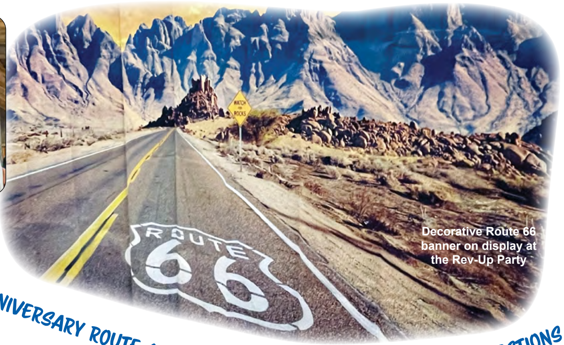
Decorative Route 66 banner on display at the Rev-Up Party