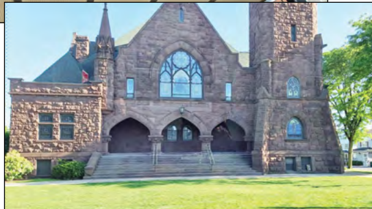
The Calvary Presbyterian Church completed in 1906 that Jimmy Stewart and his family attended.