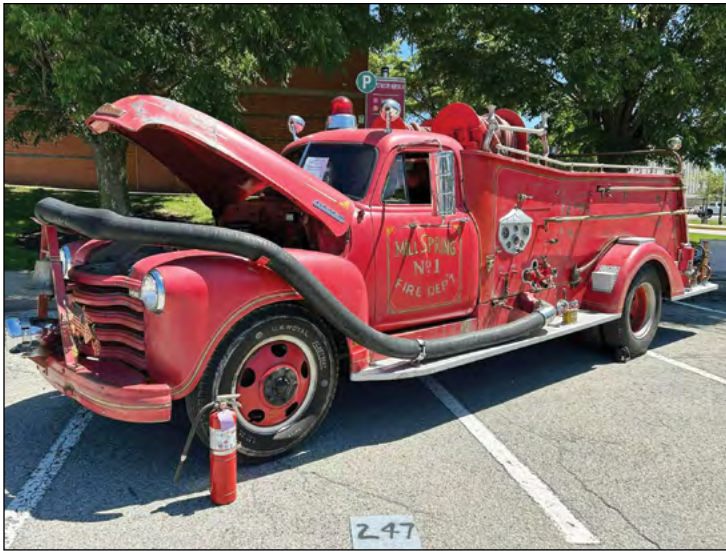
Chad Lilly's 1952 Chevrolet Fire Truck

"The Meet featured 275 beautiful cars that you don't see everyday."