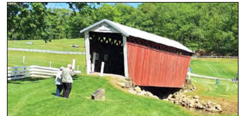
Visiting one of three covered bridges.