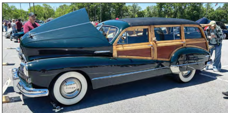
How often do you see a post WWII Buick Woodie?