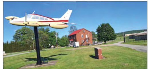
At the Indiana County-Jimmy Stewart Airport, a 1961 Cessna 310F once owned by Stewart