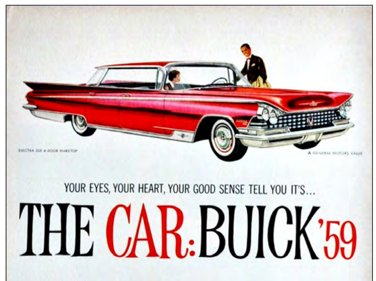
1959 Buick advertising art