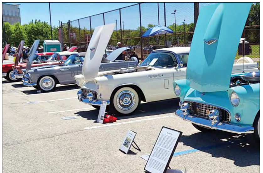
A rainbow of Ford Thunderbirds