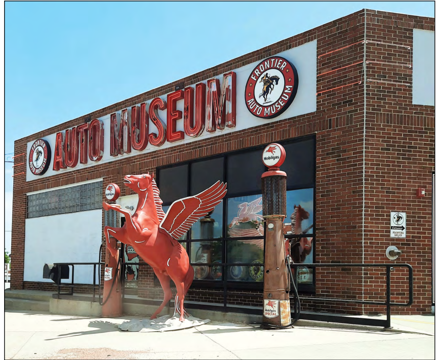
A Mobilgas flying red horse and pumps in front of the Frontier Auto Museum