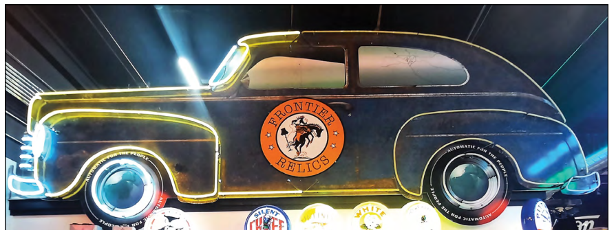
A 1940s era Chevrolet neon sign

To see more of the rooms at the Frontier Auto Museum, check out their website: www.frontierautomuseum.com