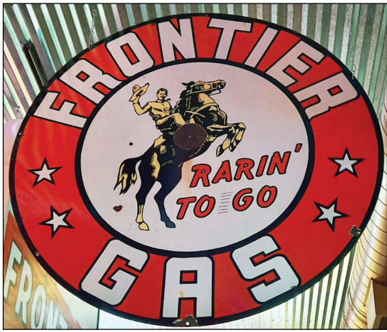
Frontier Gas sign