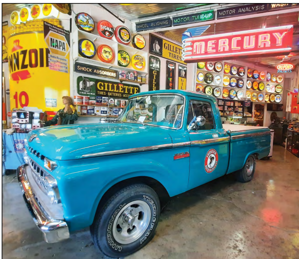
A 1966 Mercury pick up truck and gas pump globes