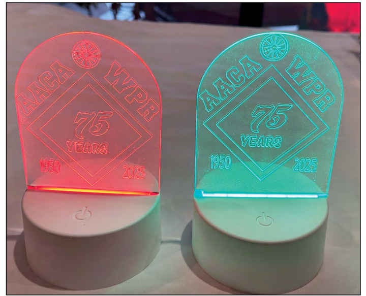
The custom designed plexiglass plates light up in different colors when a button in the base is pressed.