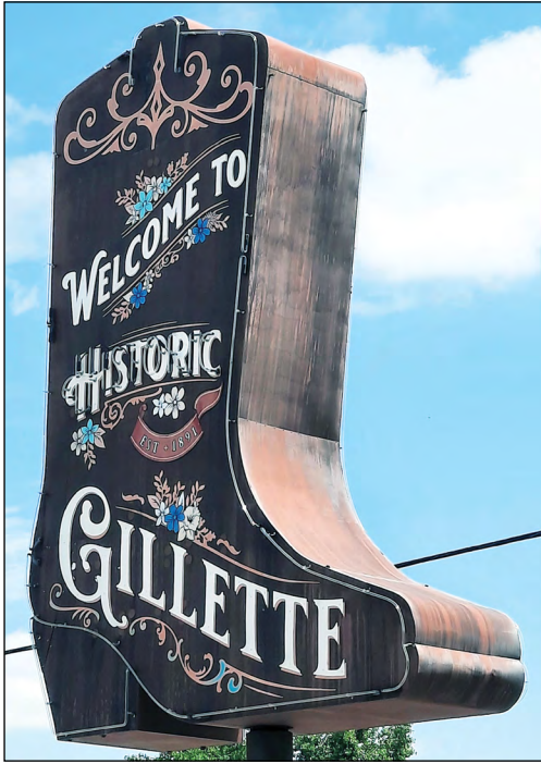
Western boot sign in Gillette, Wyoming