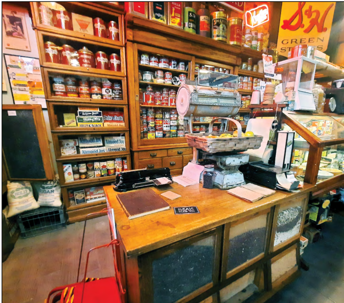
An old fashioned general store display