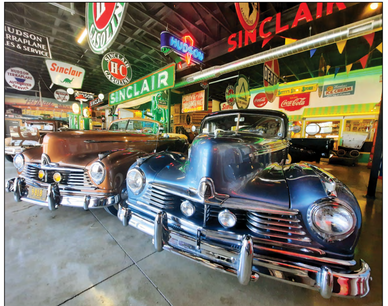
Post war 1946 Hudsons and nostalgic automobilia signs