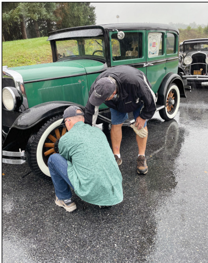
Working the "bugs" out of our 1930 Plymouth before hitting the road.

We drove 430 miles on the tour and completed all five tour days! AAA was the sponsor of the tour so they had two roll back trucks available for break downs and they were kept busy all week. We are looking forward to our next national tour.