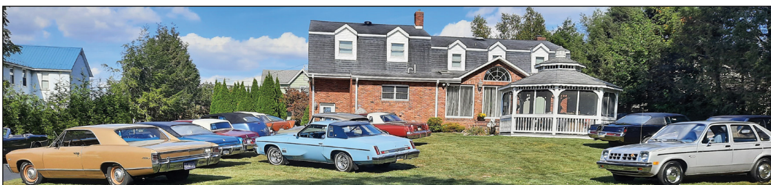
Progressive Dinner Tour cars parked by the Kuhns home while touring members enjoy dessert.