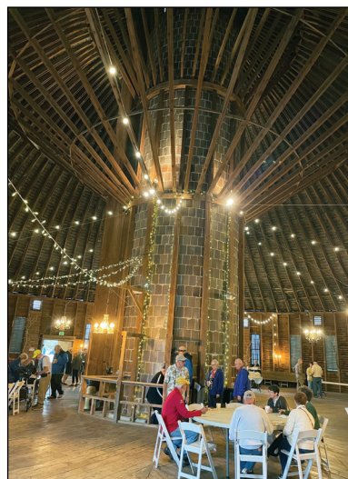
Inside the Round Barn you could see the intricate support structures.