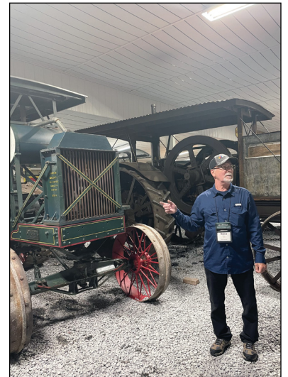
These old tractors had solid metal wheels instead of rubber ties.