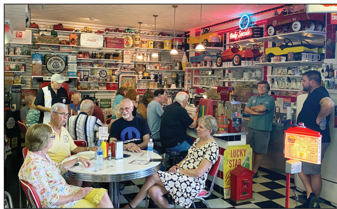
Capping off a great day with desserts in the Kuhns garage.