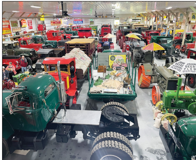
Here's an overview of Bill McGrew's amazing collection of antique trucks and tractors along with some cool old signs.