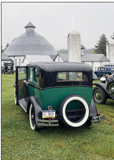
The Glidden Tour® cars by the Historic Round Barn in Biglerville.