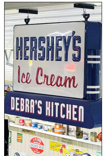
We couldn't resist taking this photo.