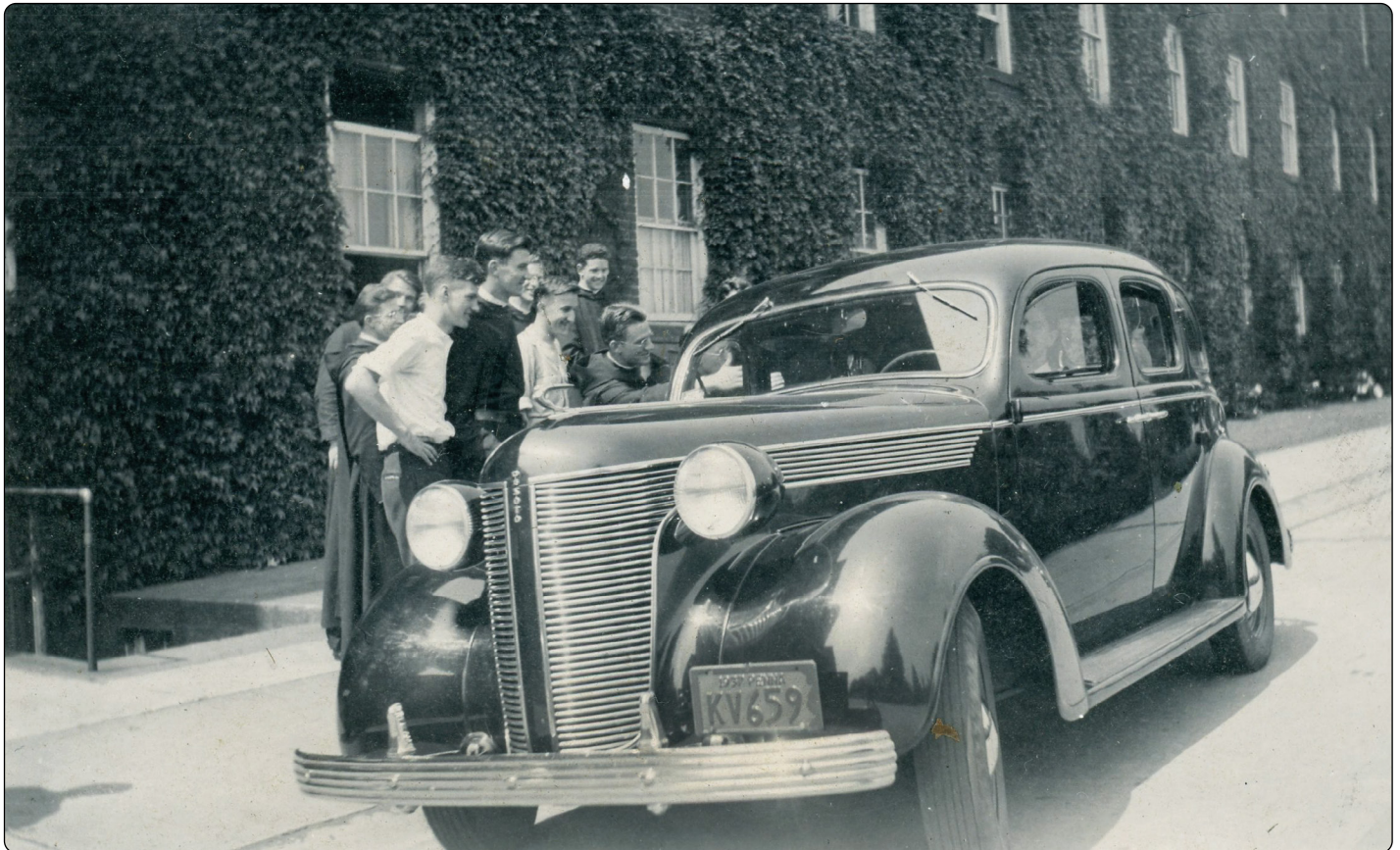
1937 DeSoto at Saint Vincent College, Latrobe, PA