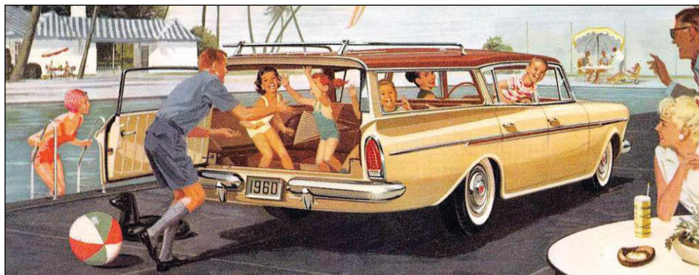
1960 Rambler advertising illustration