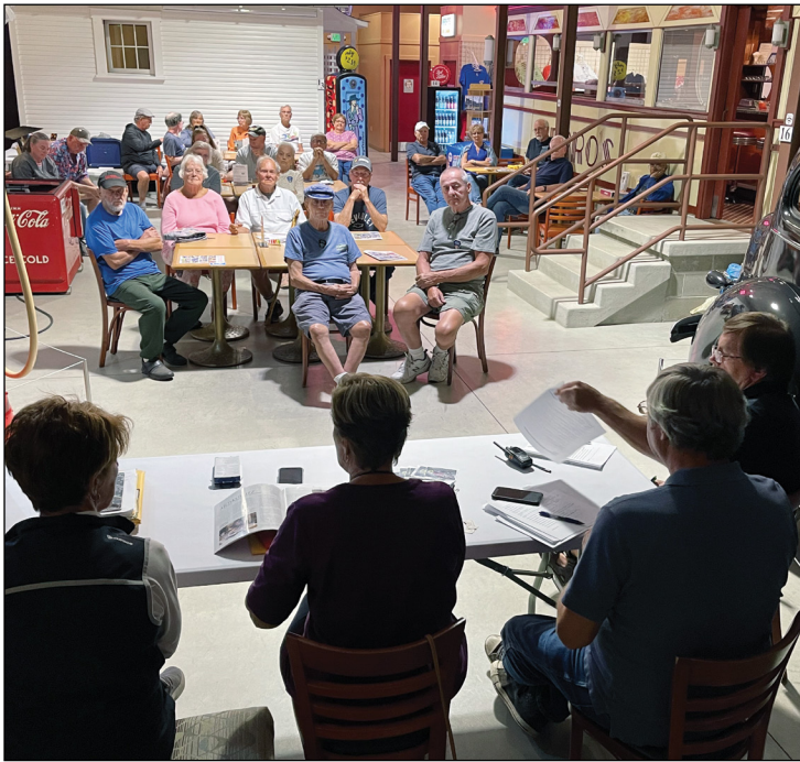
The September 17 WPR Monthly Meeting was held at the fabulous Lincoln Highway Experience museum, Route 30 East, Latrobe.