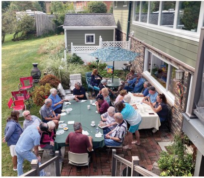
Starting with brunch at the Kings.