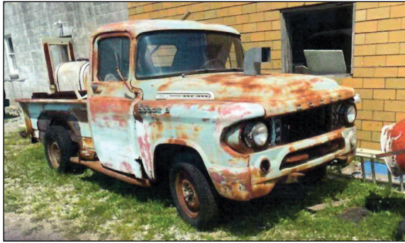
1958 Dodge Truck

These three vehicles are sitting by a body shop along Route 31 in Acme, PA.