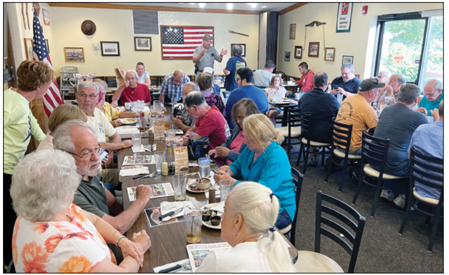
Enjoying dinner and fellowship in Hoss's meeting room.