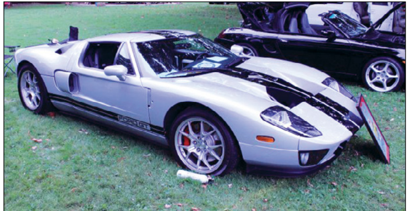
Charles Clark's stunning 2005 Ford GT-40