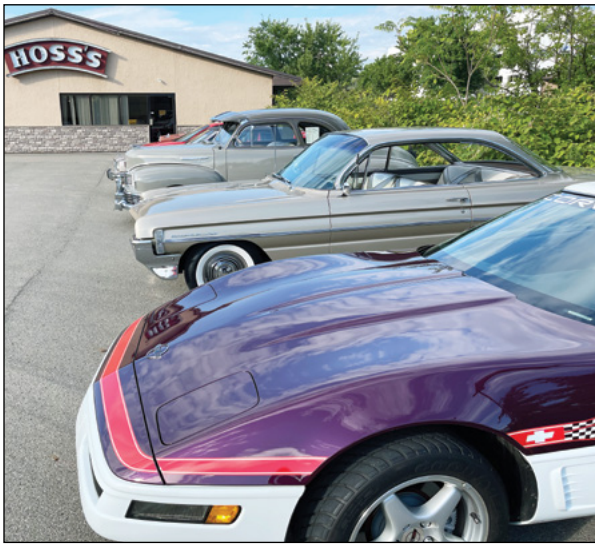
Some great cars in the Hoss's parking lot