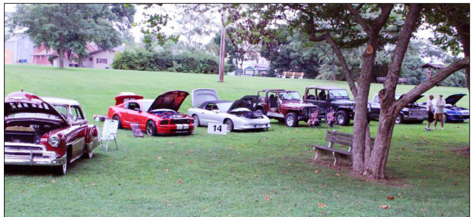
A great line up of antique and classic show vehicles at Legion Keener Park