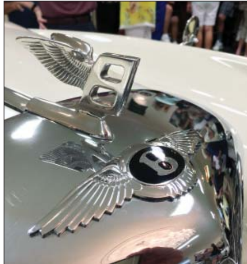
A winged Bentley hood ornament and logo