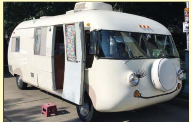
A Corvair Ultra Van Motor Coach