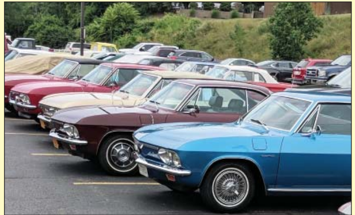
Colorful Corvairs stand ready for judging at the Concours in Pittsburgh on July 24th.