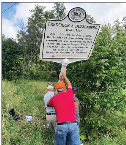
Re-erecting the Duesenberg sign.