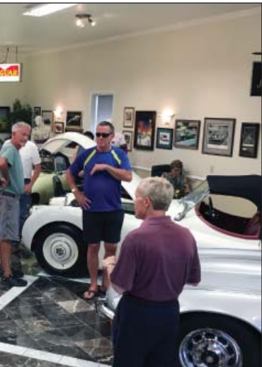
Everyone about the Jaguars.