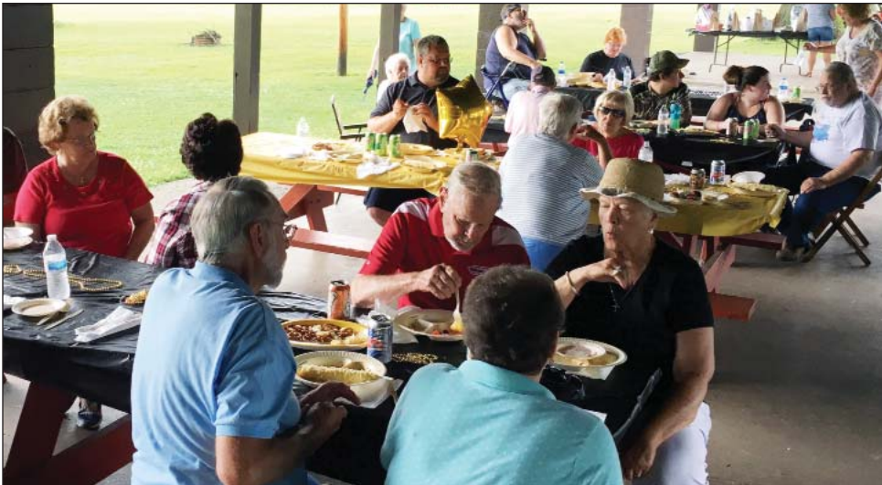
Enjoying great summer foods and friendship at the Cooperstown Club.

Of course everyone loved playing BINGO and blowing bubble gum. There were door prizes and prizes for auction baskets brought in for use at the car show in September. A corn on the cob eating contest was a new event this year. A few brave members gave it a shot in teams consisting of spinners and biters.