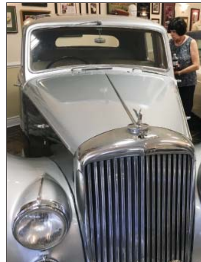
Alice Shaulis looks over a beautiful