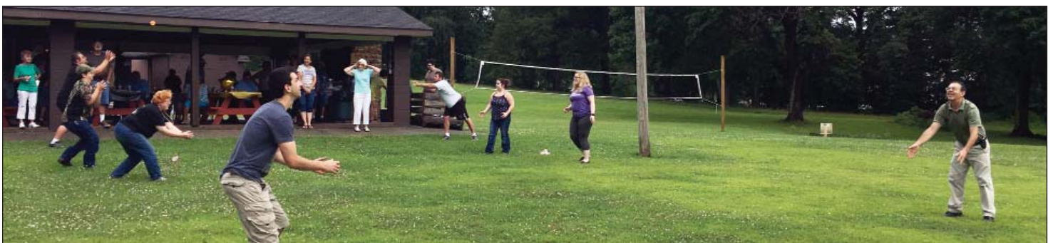
The rain stopped for the traditional waterballoon toss contest. Who cares about getting wet?