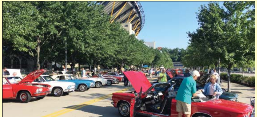
The People's Choice Corvair Show at Heinz Field