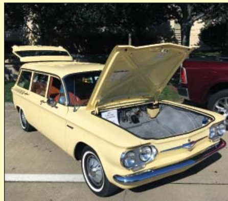
A Corvair Lakewood Station Wagon