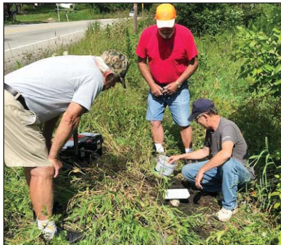
Preparing the sign post holder.

Among Duesenberg's automotive innovations were four-wheel hydraulic brakes, overhead cams and four valves per cylinder. Many of these were born and tested through racing.