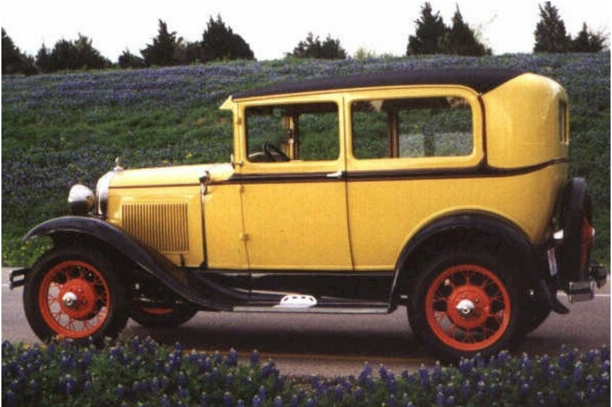
1930 Ford "A" Tudor Sedan