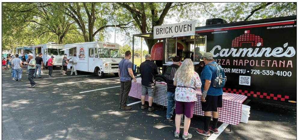
Special thanks to WPR volunteer Becky Blank for coordinating our great food vendors!