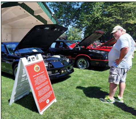
Learning about the AACA Senior Awards and the cars on display.