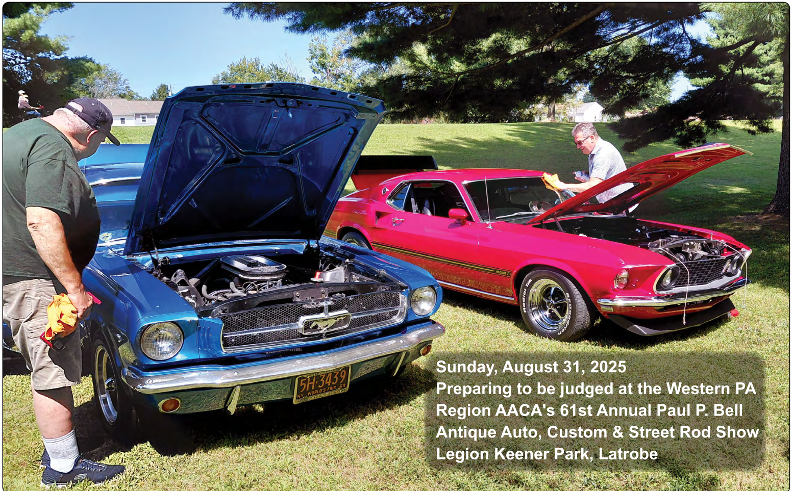
Sunday, August 31, 2025 Preparing to be judged at the Western PA Region AACA's 61st Annual Paul P. Bell Antique Auto, Custom & Street Rod Show Legion Keener Park, Latrobe