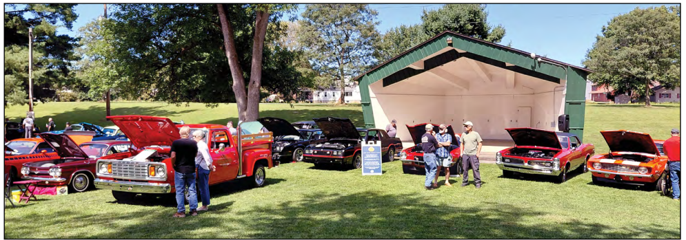
AACA Senior and Senior Grand National Award cars on display in front of the stage.