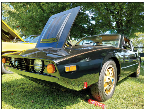
A seldom seen 1974 Saab Sonett sports car

Our sincere thanks to all of our sponsors, vendors and volunteers for helping keep this show a gem in our community!