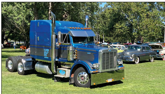
This 1992 Peterbilt has traveled well over two million miles!