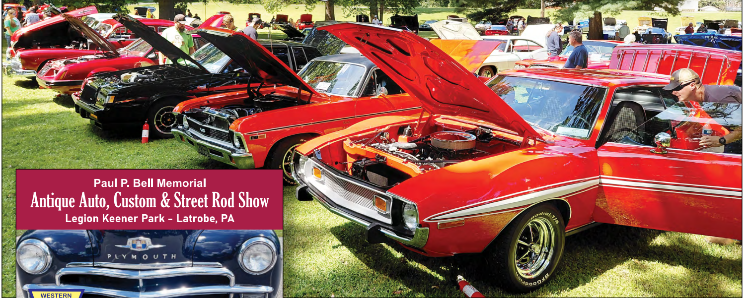
above: The Class 17 cars – hoods up, fire extinguishers out and ready for judging. left: Our 2025 dash plaque features a 1950 Plymouth to celebrate our 1950 birth year!