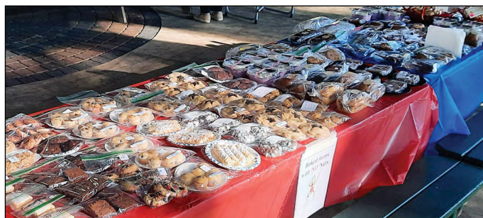
Tasty treats ready for purchase on the bake sale table.