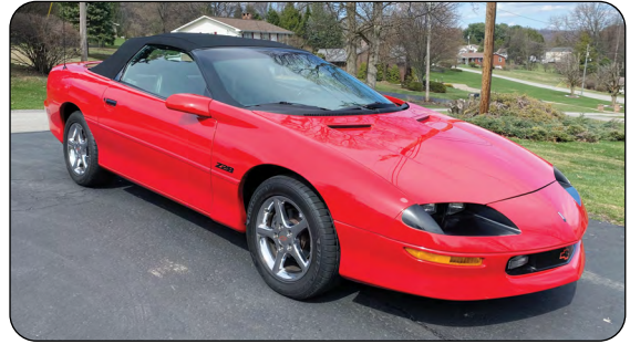
2025 Western PA Region AACA Chance Car 1996 Camaro Z28 Convertible