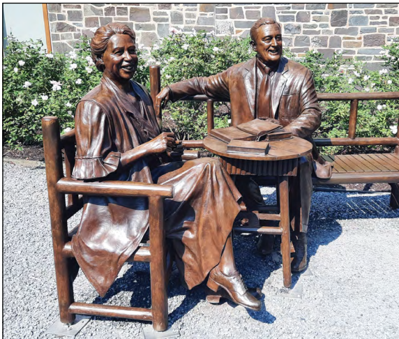
Statue of Eleanor and President Franklin Delano Roosevelt at the Presidential Library and Museum