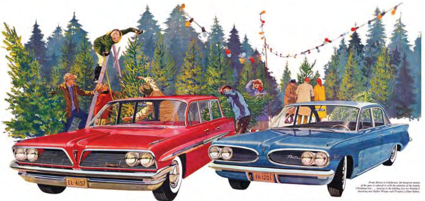
From Maine to California, the happyest season of the year is celebrated with the selection of the family Christmas tree... serving in the background are Pontiac's stunning new Bel Air, Wildcat and Tempest & Dear Sedan.