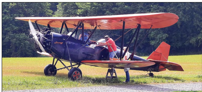
Getting into a biplane for a ride in Rhinebeck, NY.

Our next stop was to visit a gentleman and his wife to view his collection of Fords and Mercurys. After spending time looking, we continued to the town of Hudson and we visited the Firefighters Association of the State of New York (FASNY) museum to look at antique fire trucks, wagons and fire equipment. It was very interesting reading the history of the fire fighting in Colonial America and to read the development of improvements in firefighting. Some of the wagons were used for ceremonial activities such as parades were decorated with gold and glass which made them very fragile.