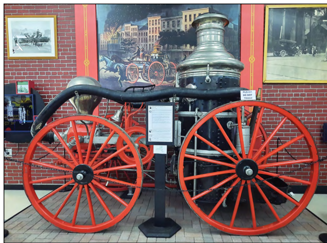
1869 Clapp & Jones Steam Fire Engine

We enjoyed our week long trip to the Hudson Valley area and we got to visit and see museums that varied from historic to educational. If you were thinking on signing up for next year's Freedom Road Rally event, the group is planning to visit the St. Louis, Missouri area and if there are a lot of registrations, they will plan two dates to choose from.