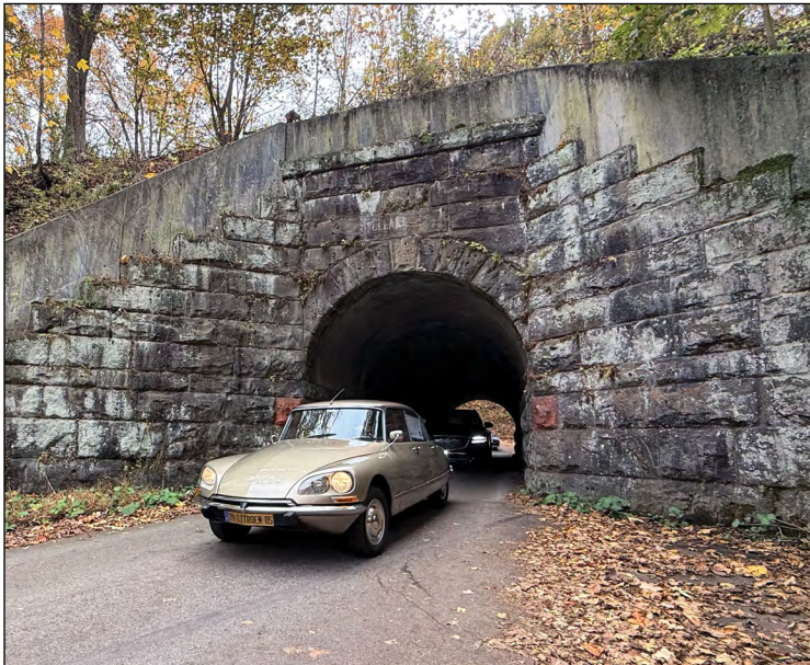
Carl and Camille Erb exit the single lane Bovard railroad tunnel in their 1970 Citroen DS 21 Pallas EFI.