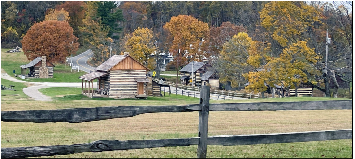
Driving by the restored log buildings and fort at Historic Hanna's Town, which served as the first Westmoreland County Seat, 1773-1782.