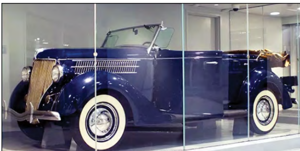
A bout with polio left Franklin D. Roosevelt paralyzed from the waist down. This 1936 Ford was specially equipped for him to drive on his own.