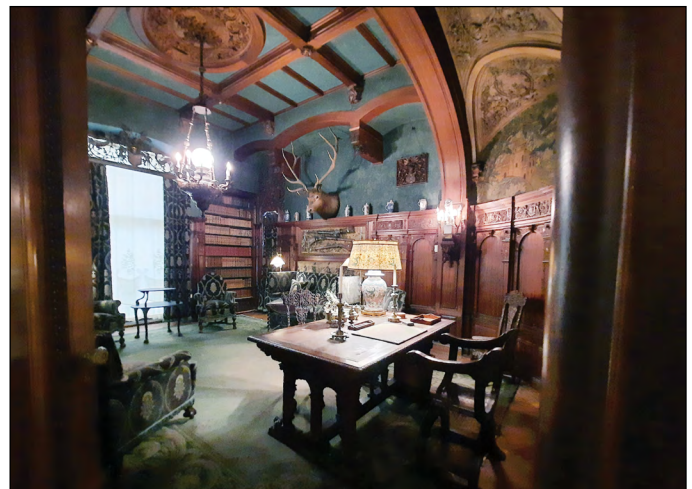
A den in the Vanderbilt Mansion.

allows walkers, joggers and bicyclists to travel over the river. It was originally a 19th-century railroad bridge that stands 212 feet above the river and it is considered the world's longest elevated pedestrian parkway.