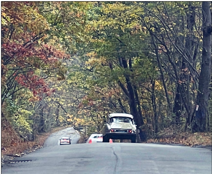
Carl and Camille enjoy a scenic fall drive in their 1970 Citroen on a colorful Westmoreland County country road.