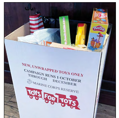
24 new toys were donated.