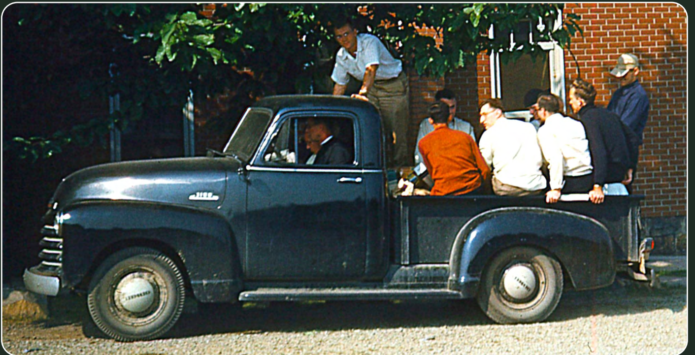
These Saint Vincent College students piled into the bed of this old Chevy pickup truck for a ride many years ago. Do you have any memories of riding in the bed of a pickup like this? It's a long lost adventure.