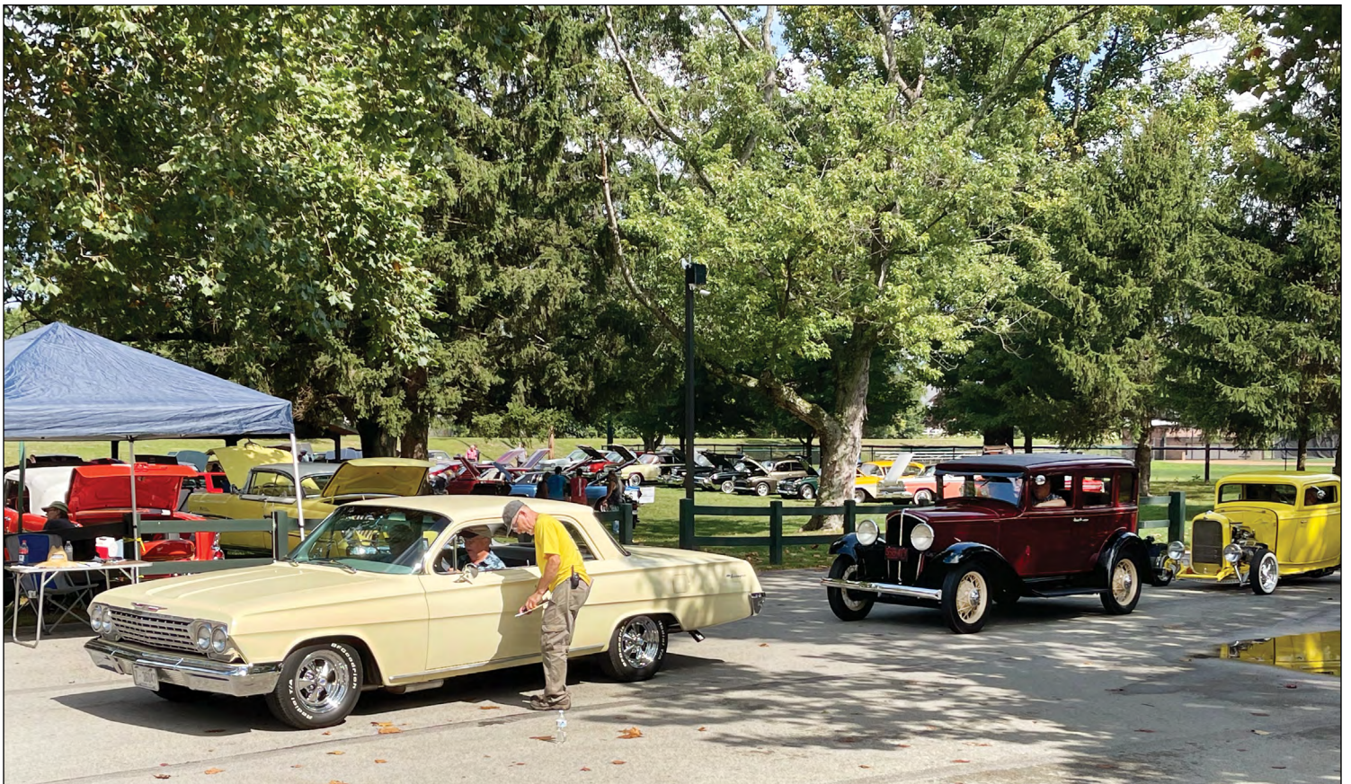
Dave Sheetz classifies show cars as they head towards the show fields at the 2024 WPR Car Show at Legion Keener Park, Latrobe.