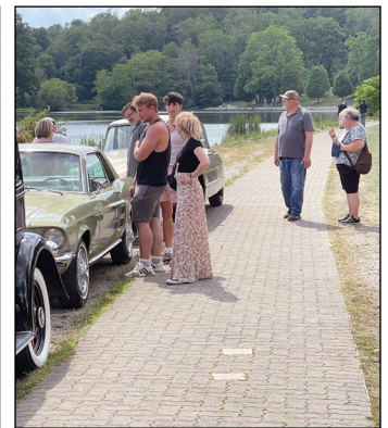
1967 Mustang admirers