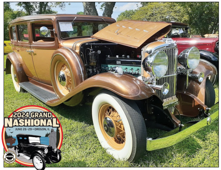
The 1932 Nash Ambassador four-door pictured above during the 2023 Western PA Region AACA Car Show just won Best of Show at the 2024 Nash Car Club of America Grand NASHional Show in Illinois.