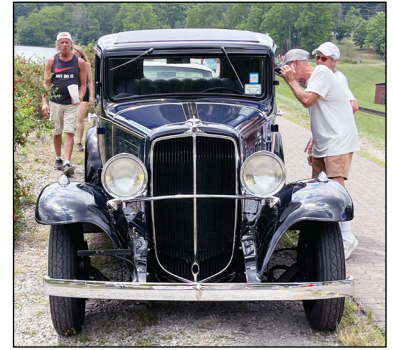
1932 Nash from Specialty Cars Ltd.

One of the top Festivals in Pennsylvania and the USA, the Westmoreland Arts & Heritage Festival at Twin Lakes Park, Greensburg celebrated its 50th Anniversary on July 4, 5, 6 & 7, 2024. The festival features outstanding classic and contemporary crafts, demonstrating artists, a wide variety of savory foods, a juried fine arts exhibition, continuous entertainment on four stages, strolling entertainers and interesting and engaging heritage displays.