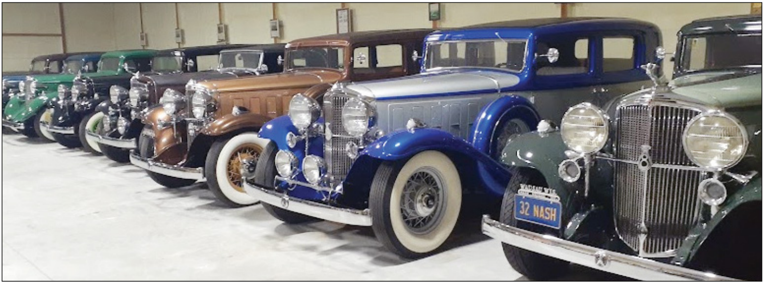
Amazing examples of the stylish and colorful early 1930's Nash automobile legacy, all in a row.