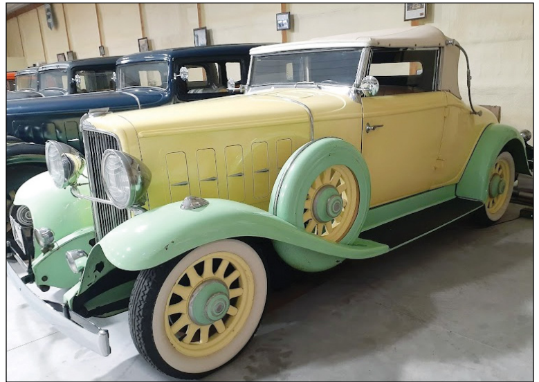
1932 Nash Cabriolet