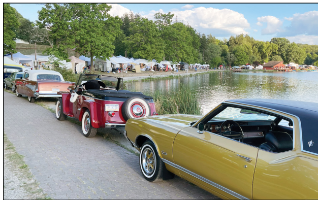
l-r: 1957 Chevy, 1950 Willys Jeepster, 1971 Olds Cutlass Supreme