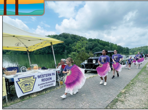
Strolling dancers in front of our display