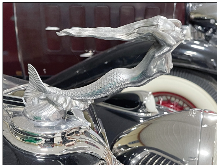
A dynamic mermaid hood ornament on one of the 1932 Nashes