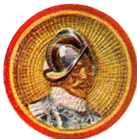
DeSoto automobile emblem