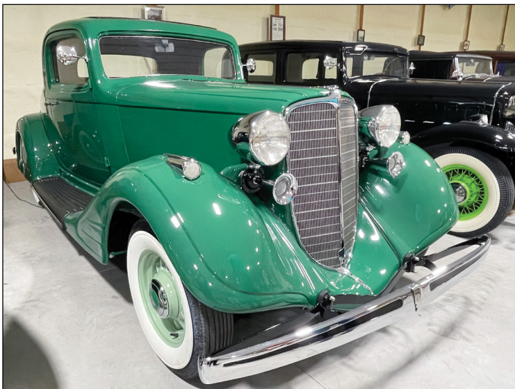
A 1934 Nash Business Coupe