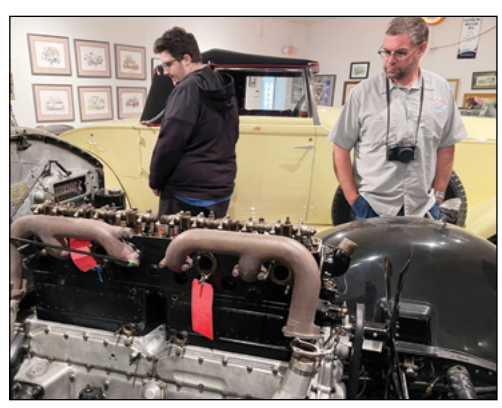
Studying a magnificent Rolls-Royce engine.