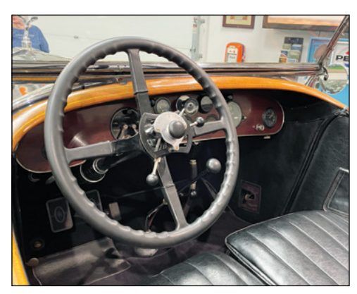
Left hand steering makes Rolls-Royces built in Springfield, MA easier to drive in the U.S.