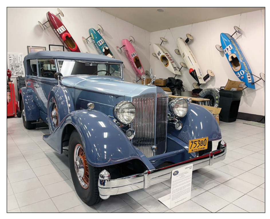
A stately 1934 Packard Twelve sits in front of a display of Soap Box Derby cars, which were once driven by several of Jon's children in competitions.