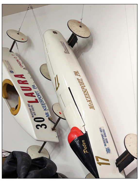
A closer look at these Soap Box Derby Cars shows that the competitions were held in Mckeesport, PA.