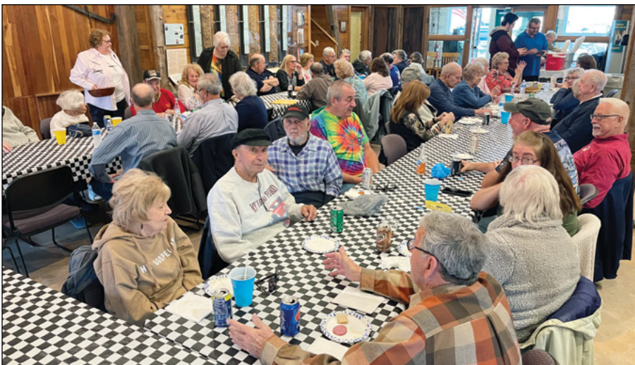
What better way to rev-up a Rev-Up Party than with checkered table cloths.

es, plastic ware and cups. Members with last names beginning A through K were asked to bring a side dish or salad of their choice. Those with last names beginning with L through Z were asked to bring a dessert. The marvels of a "Pot Luck" dinner are the scope and variety of culinary delights that everyone comes up with. There's no doubt about it. Our members are excellent and imaginative cooks! The variety and selection of salads, sides and desserts were absolutely awesome! Delicacies included wedding soup, hobo beans, potato salads, broccoli salads, cheese curds, relish trays, casseroles, cookies, cakes, brownies, jellos, candy and more. It was fun trying a little of everything, and no one went home hungry. There were also many leftovers to share. To highlight the "Pot Luck" buffet, Cris Detwiler made a special decoration featuring a large black cauldron-style pot with big gold letters above, which spelled out the word "LUCK".