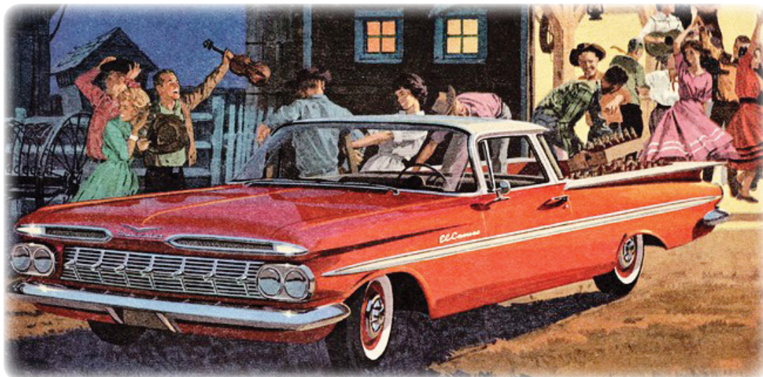
1959 Chevrolet El Camino advertising illustration