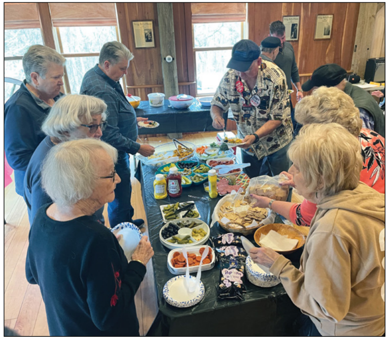
Enjoying the relish, cheese curd and hors d'oeuvres table. The cheese curds were courtesy of The Creamery at Pleasant Lane Farms.

During the meeting and dinner, a PowerPoint featuring 200 photos from last year's Region activities ran continuously on the large Smart Board in the background behind the director's table.