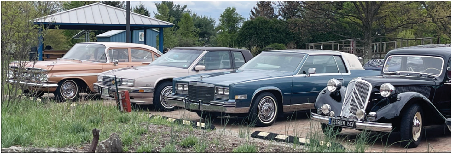
Ready for cruising - l-r: 1959 Chevrolet, 1990 Cadillac Eldorado, 1985 Cadillac Eldorado, 1952 Citroen Citroen Traction Avant 15CV

As the rains clear our roads of winter salt, the days grow longer and the sun starts shining brighter. Spring marks the start of the new cruising season, when it's once again time to get out those wonderful old cars and trucks. In addition to being fun to drive, when people start seeing these old vehicles on the roads it is as much an indication of Spring as the blossoming crocuses and daffodils.