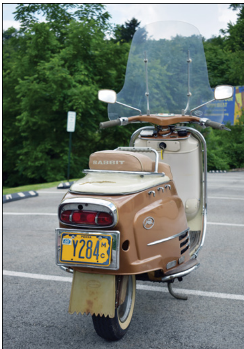
The Rabbit Scooter's last registration date was 1969 and the odometer showed only 1,386 miles

Another hurdle to overcome was finding a proper battery (batteries) for the Rabbit. It has a 12 volt system which runs off of two 6 volt batteries. So I set out to find either two small 6 volt batteries or a tiny 12 volt battery which would fit into the battery holder. I finally found what I think is the smallest 12 volt battery in the world and placed it into the slim battery compartment. Once this was completed I was able to check