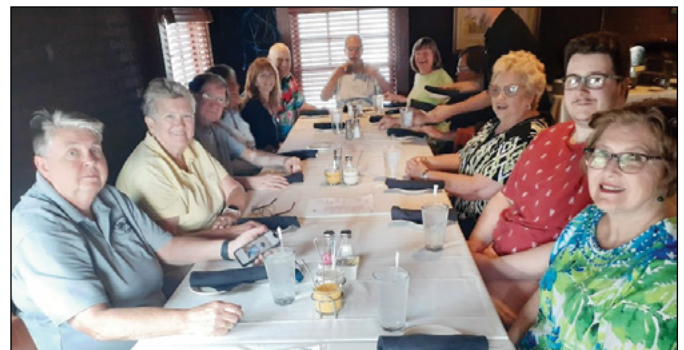
Ready for dinner at JG’s Tarentum Station Grille in the old Tarentum Train Station

In the showroom were Dell’s two immaculate “Woodies”, a 1941 Packard Model 120 station wagon and a 1947 Chrysler Town & Country 4 door sedan. Some other impressive cars in this building were the 1956 DeSoto Fireflite Convertible which Dell considers to be his most valuable car, a turquoise and Navy 1956 Dodge and a beautiful special navy colored 1953 Lincoln. Immediately outside that showroom, cars that caught my eye were a turquoise 1953 Packard and a green 1954 Mercury. As we rounded the building, we discovered the line of most of Dell’s 18 pickup trucks. Among them were 1950’s and 60’s Chevy, Ford and GMC’s, but the ones that stood out most to me were the Chevy Cameos and GMC Suburban Carriers with pickup beds that on the outside look more like a car than a pickup. Both the Chevys and GMC’s, look pretty much the same, but to our surprise we learned that the GMC’s had