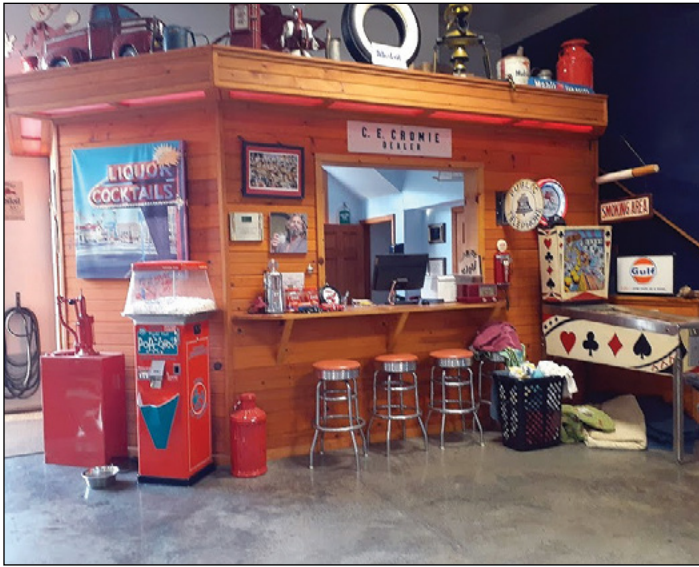
Complete with popcorn and pinball machines, this cozy snack bar is tucked away in a corner of Dell's main showroom.