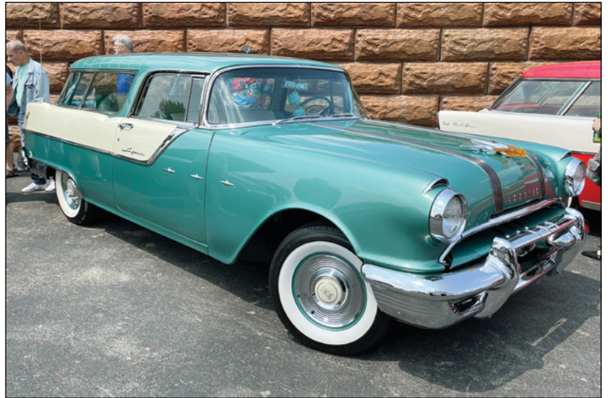
A two door 1955 Pontiac Safari Wagon stands at attention beside a 1956 Chevy Nomad Wagon in a line of beautiful cars facing Dell's buildings.