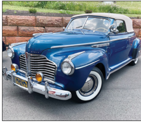
A stunning 1941 Buick Special Straight Eight Convertible