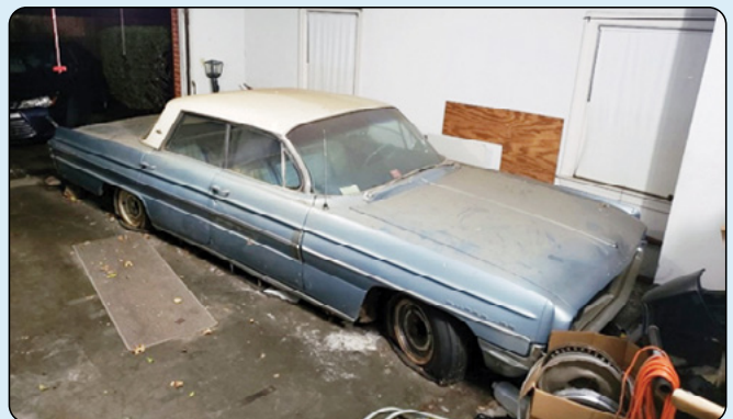
-- The Rummage Box

As usual, life got in the way so here it is four years later, and it's still not finished. That's why this article is titled Part I. Part II will be when I finally finish it.