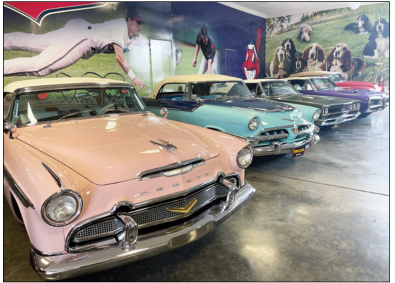
A valuable, award winning 1956 DeSoto Fireflite Convertible in the main showroom surrounded by colorful baseball and basset hound wall murals.