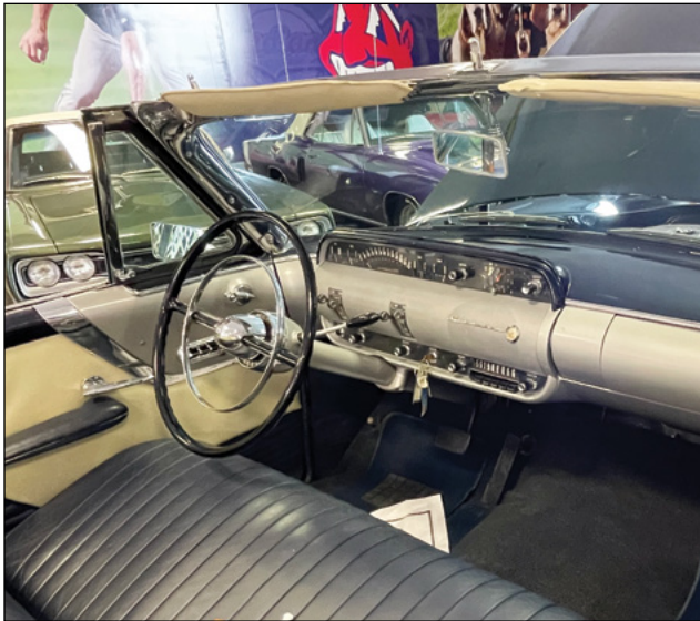
This simply elegant 1953 Lincoln Convertible dashboard would help make driving a true pleasure.