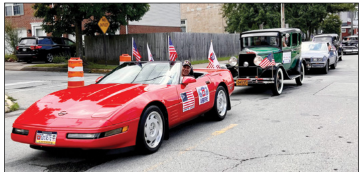
Kirk Fellabom's 1991 Corvette in parade position