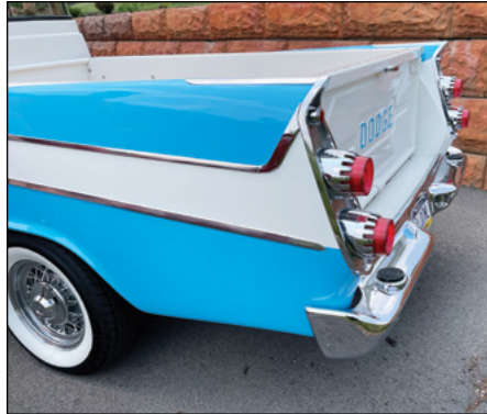
A 1957 Dodge Sweptside pickup with car-style taillights