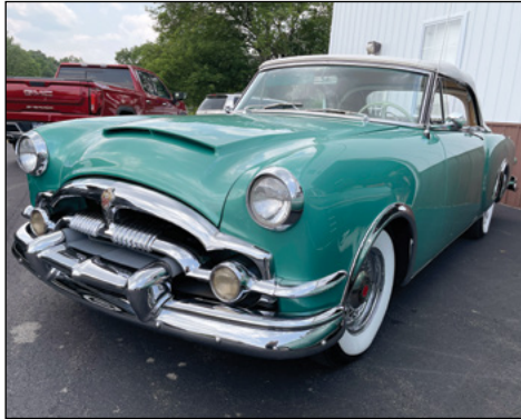
An amazing 1953 Packard Convertible