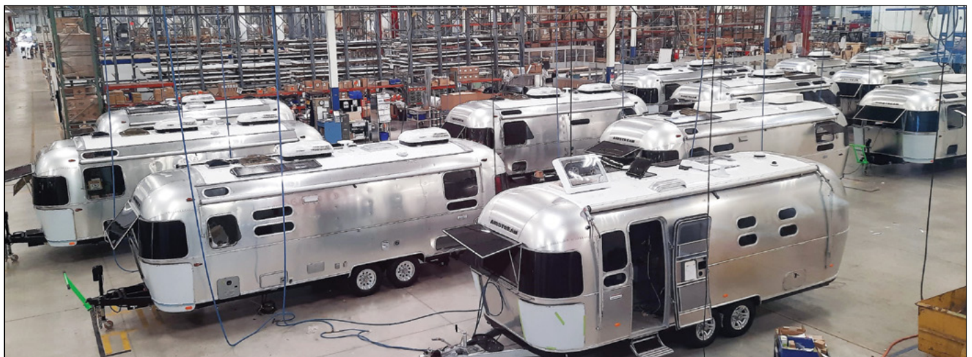
At the Airstream Heritage Center in Jackson Center, Ohio, we took a tour of the Airstream trailer assembly line.

The total mileage for this trip in the '48 Nash was 750 miles. The car did well despite having a water pump issue. So water was added at every stop. We had good weather and the country roads were good for the old car. We had a Victory Dinner on Thursday evening at the hotel on day 5, and we were told that next year's rally will be in Louisiana.