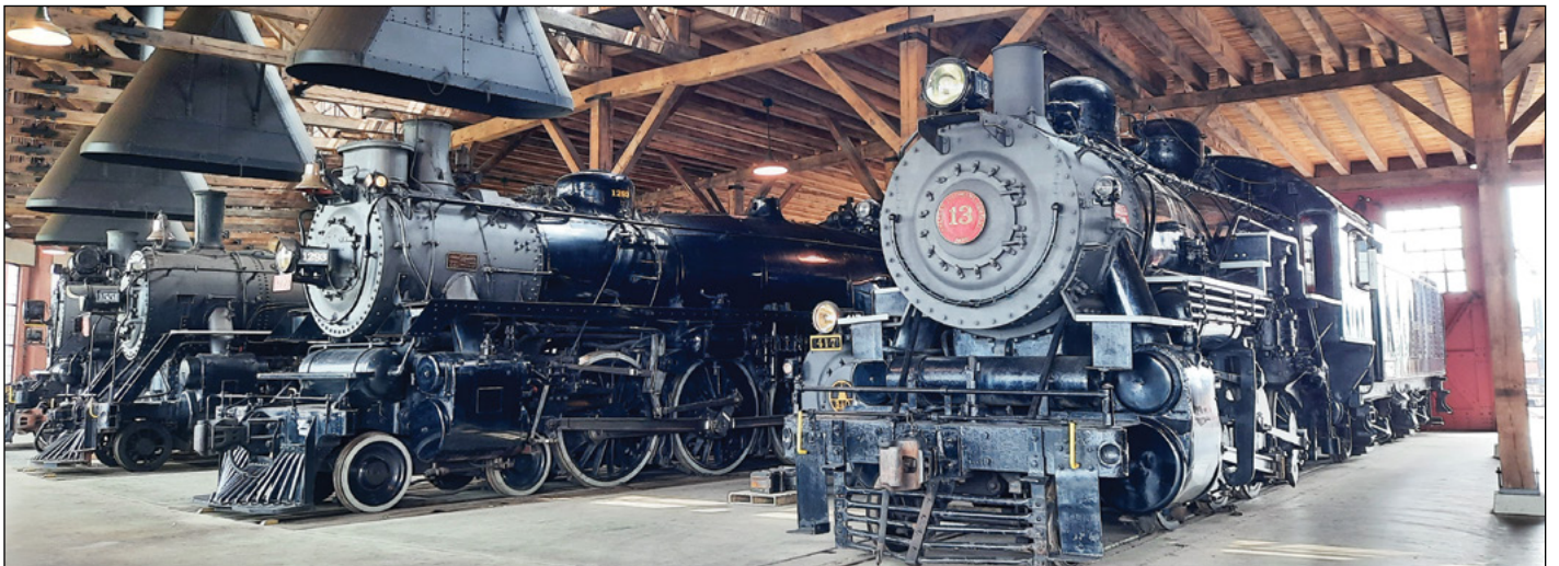
Visiting The Age of Steam Roundhouse, Sugar creek, Ohio. This full-size, working roundhouse was built in 2009. It is considered to be the first full-size, working roundhouse built in the U.S. since 1951

On Day 3, we visited the MAPS (Military Aviation Preservation Society) in North Canton and looked at the displays of local Ohio heroes who were involved in military conflicts overseas. There was a display of fifty examples of aircraft. After lunch, we drove to the Packard Museum (Warren) to look at the history of the Packard family and their legacy in the automobile era. Did you know that the Packard brothers started the family business in the electric company that produced incandescent bulbs?