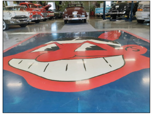
This Cleveland Indians mascot floor mural took about 30 gallons of special epoxy paint