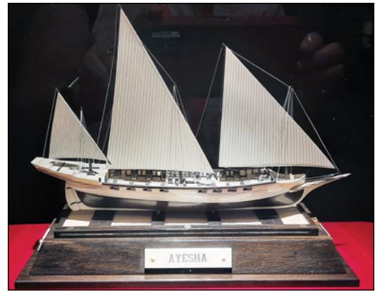
A highly-detailed, scrimshaw model boat

On Day 4, we headed North to Cleveland and walked through the Rock and Roll Hall of Fame. There were many artists represented in the Hall. It was interesting seeing the costumes, sheet music and instruments that were used by these performers. The next stop was the Merry-go-round museum (Sandusky). We were told the original building was the town's post office built with a large rotunda and now houses a full-sized scale