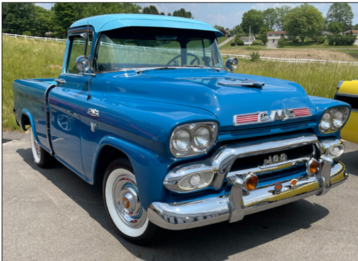
This highly-optioned 1959 GMC Suburban Carrier was a combination of style and utility.