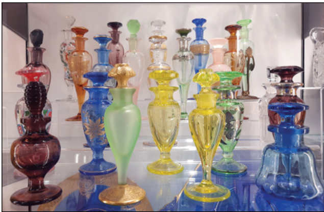
Perfume bottles at the Cambridge Glass Museum

merry-go-round that patrons can ride on. There were several displays of horses, deer and other animals used for carousels and merry-go-rounds throughout the world.