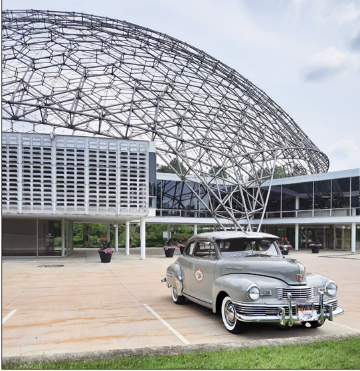
Our 1948 Nash by the large open Geodesic dome at the ASM (American Society of Metals) near Warren, Ohio.

In the spring, we were mailed a reminder that this year's Freedom Road Rally will be in Ohio. This event will be their twentieth anniversary driving classic cars for a week long progressive journey. Everyday on this progressive tour, the driver and his navigator travel (on average) about 120 miles a day and visit the local sites.