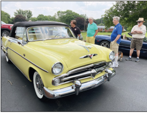
Enjoying a 1954 Dodge Royal Indy Pace Car version in Pittsburgh Steeler colors