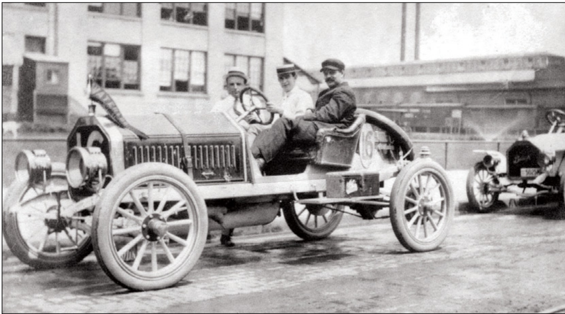
Louis Chevrolet wearing dark clothes sits in a Buick race car he designed in the early 1900s.

Also in 1916, American Motors Corporation (unrelated to the later American Motors created by the 1954 merger of Nash-Kelvinator Corporation and Hudson Motor Car Company) was formed in Newark, New Jersey, with Louis Chevrolet as vice president and chief engineer. By 1918 it was producing cars in a plant at Plainfield, New Jersey. In 1923 it merged with the Bessemer Motor Truck Company of Pennsylvania into Bessemer-American Motors Corporation, which lasted less than a year before merging with the Winther and Northway companies into Amalgamated Motors. The latter company apparently ceased soon after.