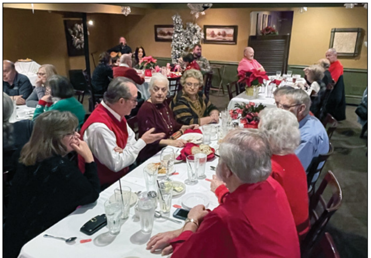
Friendly discussions within a holiday gathering of friends