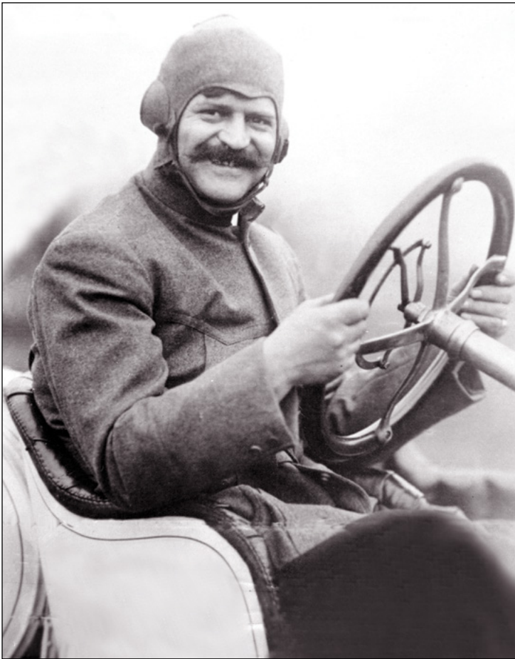
Louis Chevrolet in 1911

Louis-Joseph Chevrolet was an American racing driver, mechanic and entrepreneur who co-founded the Chevrolet Motor Car Company in 1911. He was born on December 25, 1878, in La Chaux-de-Fonds, canton of Neuchâtel, Switzerland, where his father worked as a watchmaker.