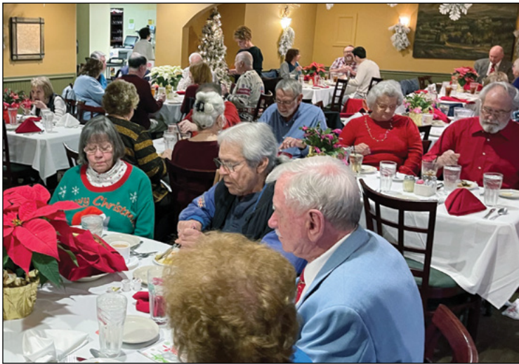
Enjoying a Christmas feast at Rizzo's Malibar Inn, Crabtree, PA