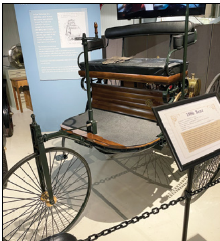
Benz's 1886 Patent-Motorwagen (replica)