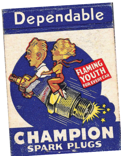
Classic matchbook cover