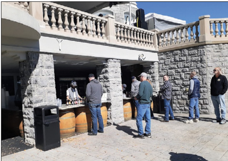
Outdoor patio serving area