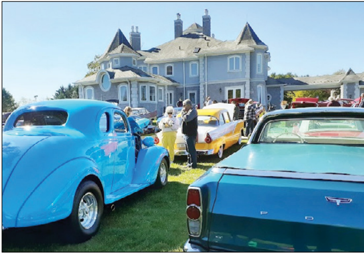
I saw many cars that I've never seen before at this event.