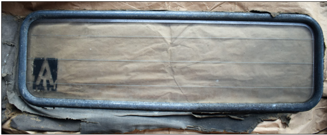
The original rear window for my 1928 Stutz Model BB cabriolet featured an early form of safety glass with metal wires running through the glass.

went. Unfortunately, I could not find the name, phone number, or address of the Texan who bought it. So once again, I missed the opportunity to return the original back window to the latest owner. About two weeks ago, I received a phone call from a man from Wisconsin. He said that he had bought a 1928 Stutz Model BB cabriolet from a gentleman in Texas and heard that I may have at one time been the owner of the car. After discussing a few more details about the car, it was confirmed that the Stutz which he purchased was indeed my old Stutz. I was excited to tell him that I had the original back window for the car and that I would be happy to mail it to him. It turned