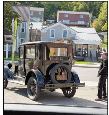
Car stop - yep, it's for sale.