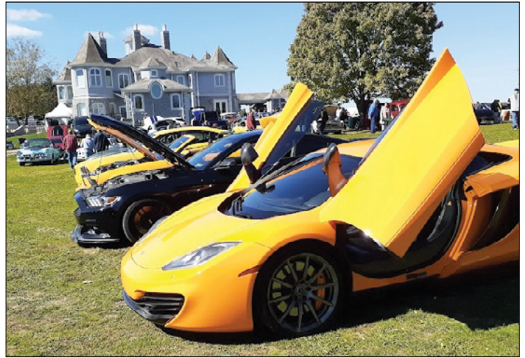
A row of high-power cars on display