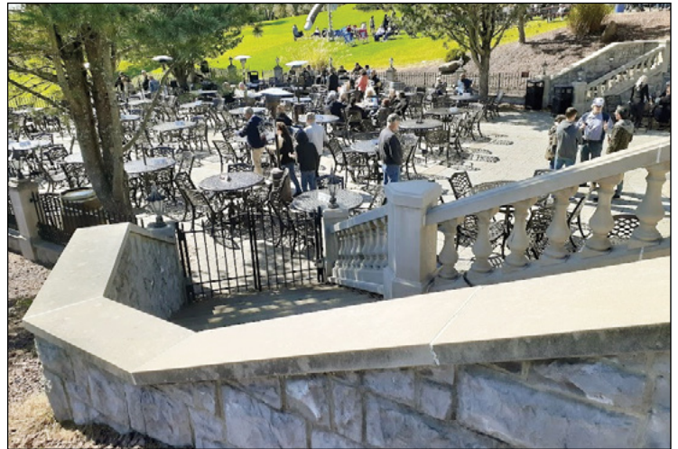
The majestic winery patio