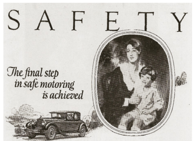
Stutz safety focused advertising illustration

About two years ago, I learned that the owner of the Stutz sold it to someone in Texas. So, off to the Lone Star State it