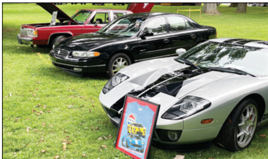
"Melissa", our 1999 Buick Regal, beside the Ford GT-40