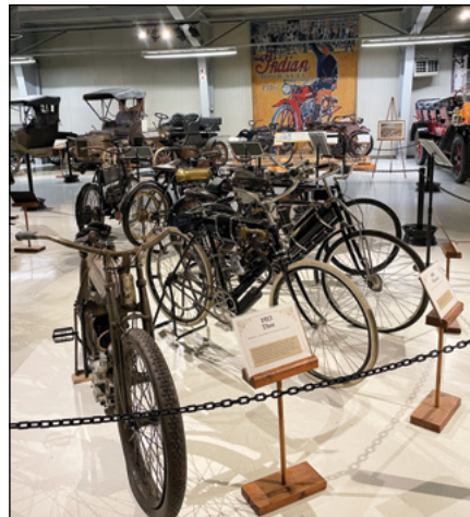
1913 Thor and other early motorcycles