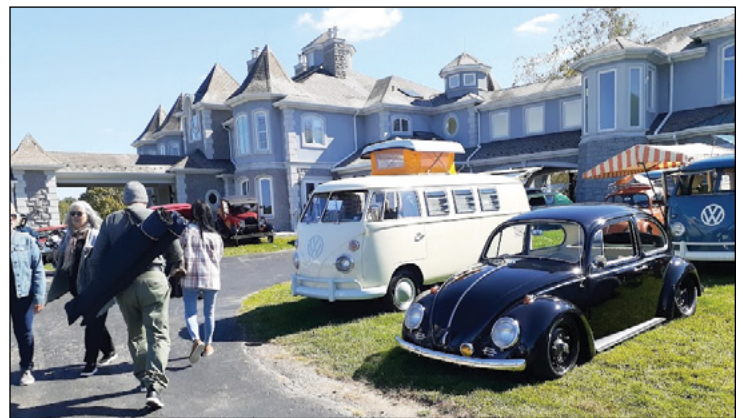
A Volkswagen group near the winery entrance