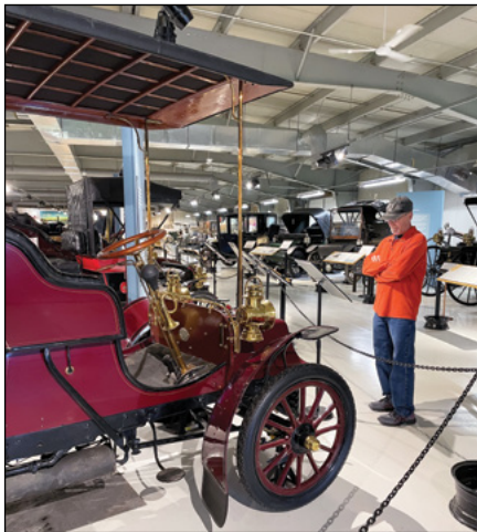
An elegant 1904 Cadillac