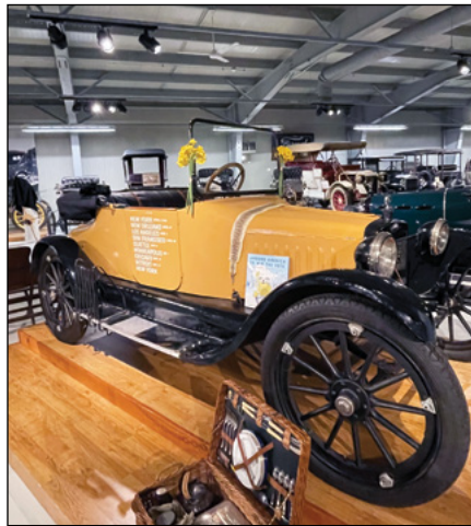
A 1916 Saxon driven 10,000 miles across America promoting womens' voting rights