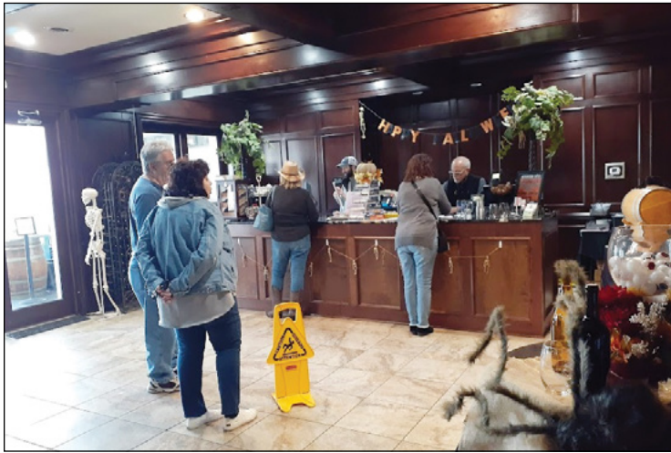
Stunning woodwork inside the winery with Halloween decorations