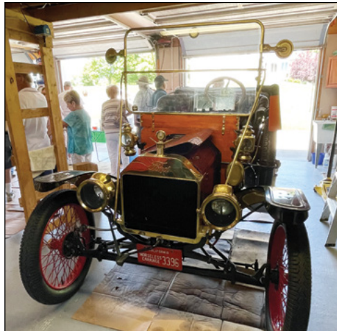
1911 Ford Model "T" Touring