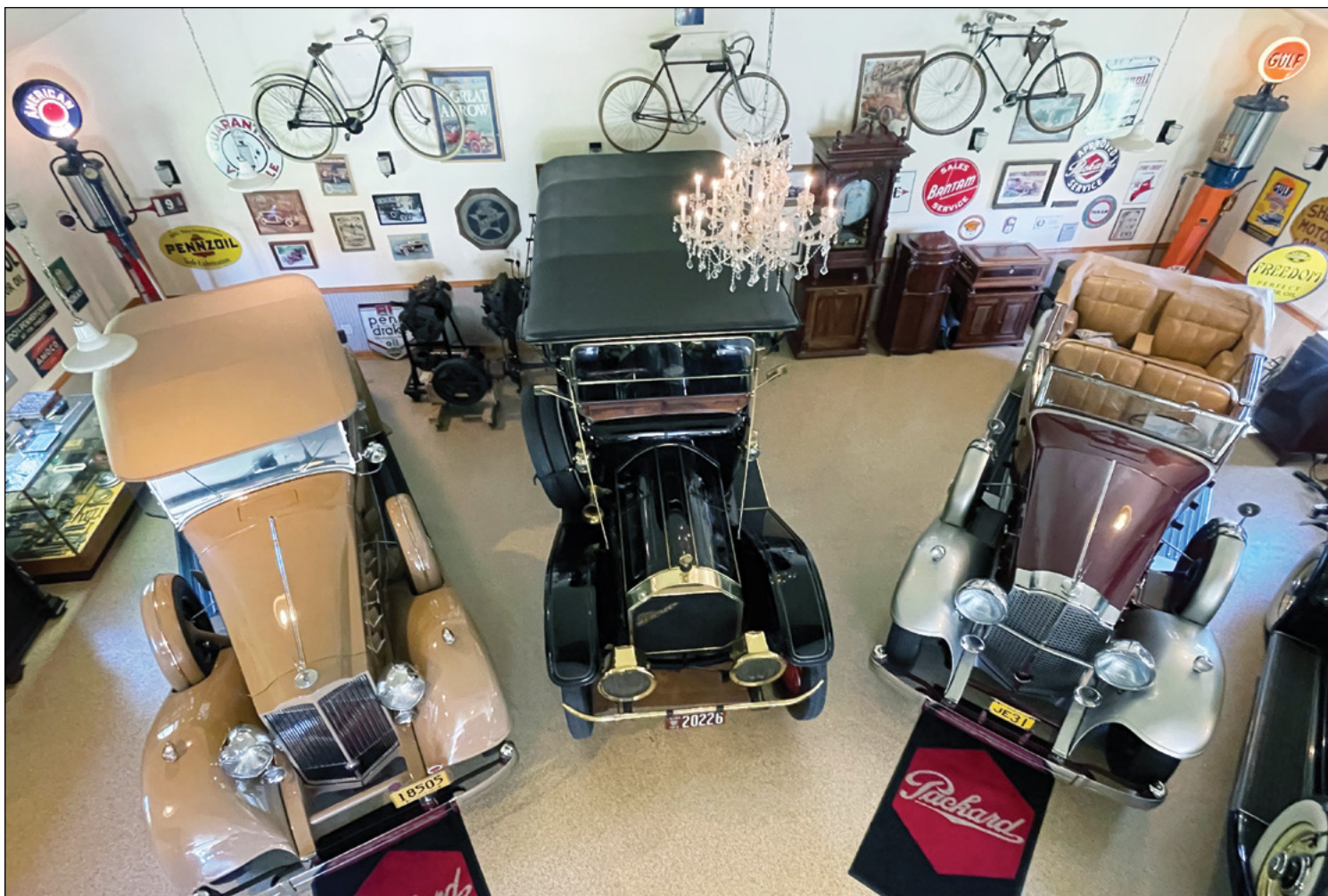
View from the loft, (l-r) 1934 Packard Dual Cowl Phaeton, 1912 Pierce-Arrow Touring Car and a 1932 Packard Convertible Sedan