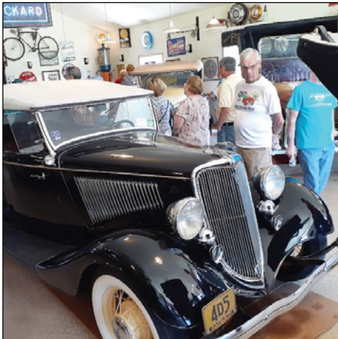
1934 Ford 4-door Phaeton