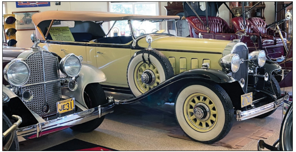
(l-r) 1932 Packard Convertible Sedan, 1932 Buick Series 90 seven Passenger Phaeton