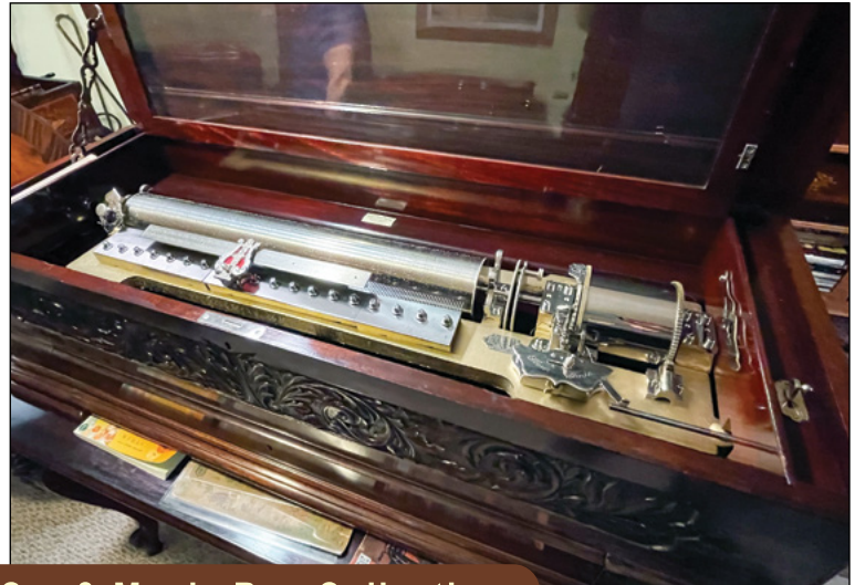
Tour to Al & Mary's Antique Car & Music Box Collection