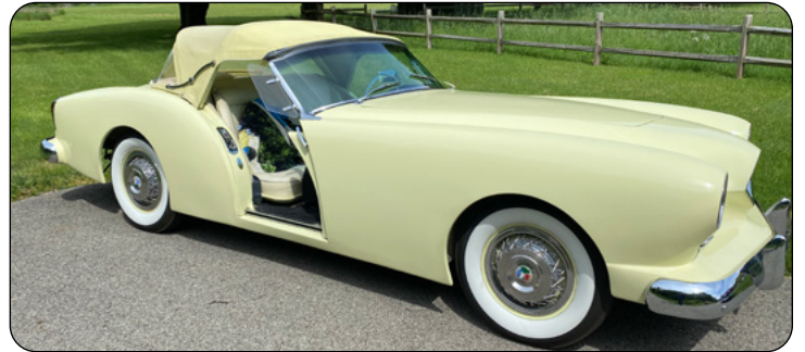
a 1954 Kaiser Darren sports car featuring sliding pocket doors