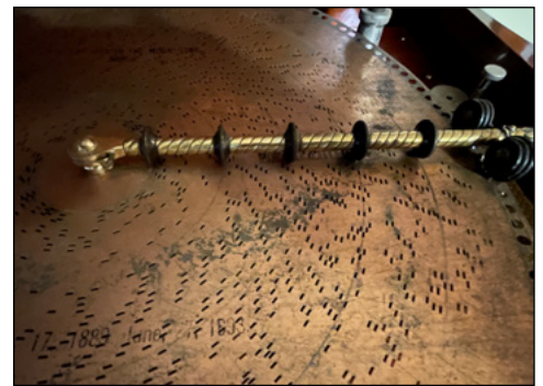
The intricate detail of a music box disc