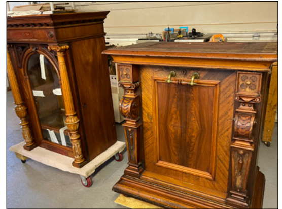
Al's woodshop reveals his "labor of love" - (photos l-r): lathe and wood turning tools; varnish, stain & finishing table, intricate cabinet projects