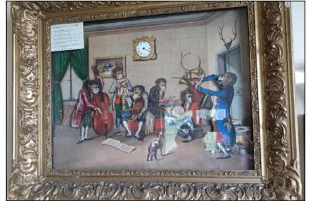
A wall-hanging music box with moving musical monkeys