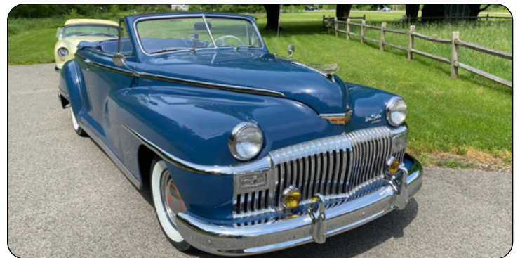
1947 DeSoto Convertible with its beautiful "waterfall" grill