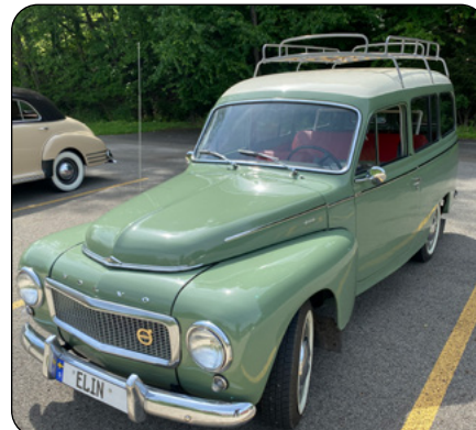
1960 Volvo Wagon