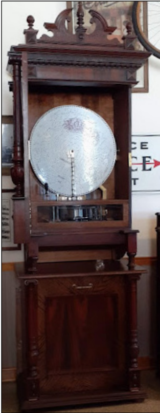
A coin-operated music box