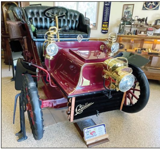
1904 Cadillac Touring B