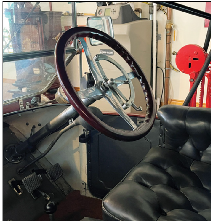
At the wheel of the 1912 Pierce-Arrow