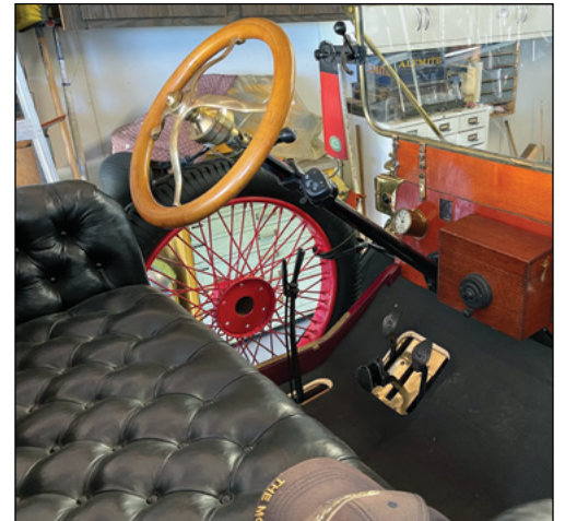
Behind the wheel of the 1911 Model "T"