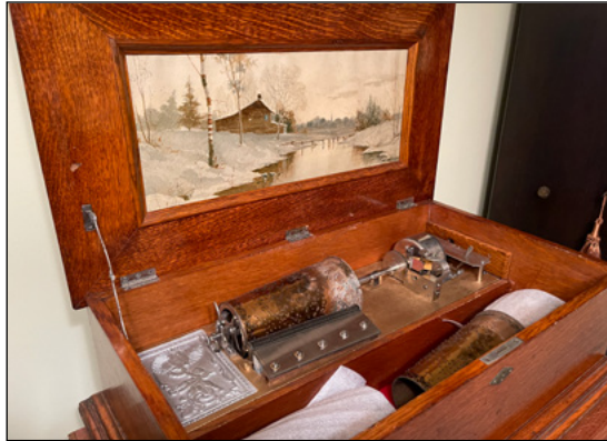
A cylinder music box