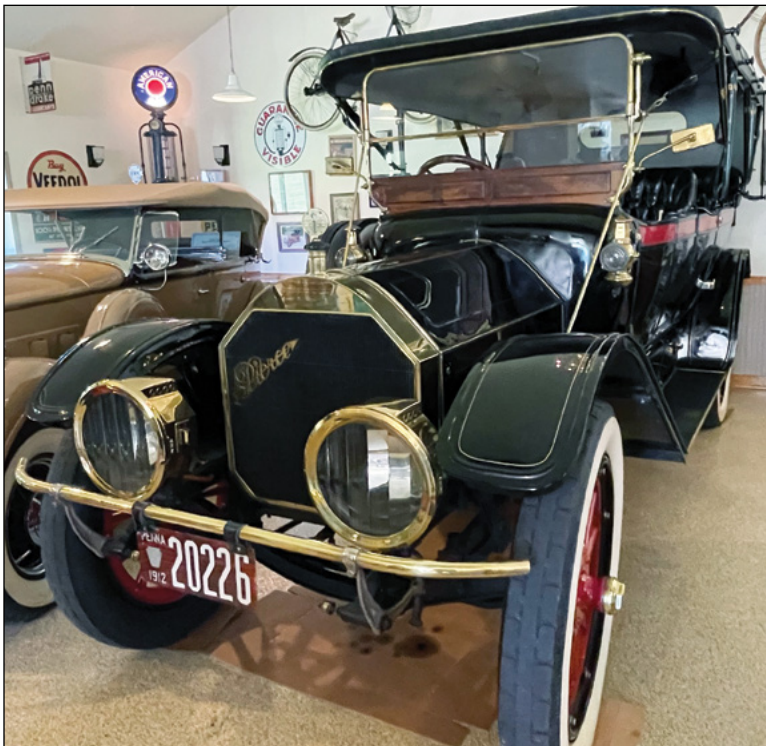
1912 Pierce/Arrow 7 Passenger Touring