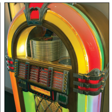
Antique Wurlitzer 78rpm juke box