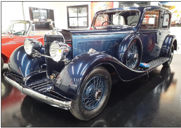
1936 Hispano-Suiza K6, once called "The Car of Kings"