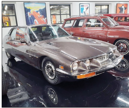
A 1973 Citroën SM with a V-6 Maserati Engine