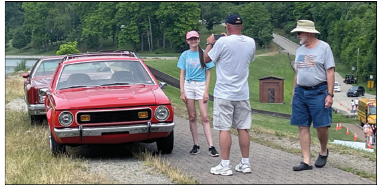
Festival visitors enjoy a photo op with a 1972 AMC Gremlin X