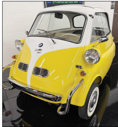
BMW Isetta microcar