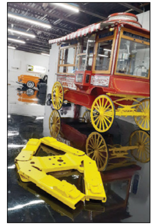
Working hydraulic lift