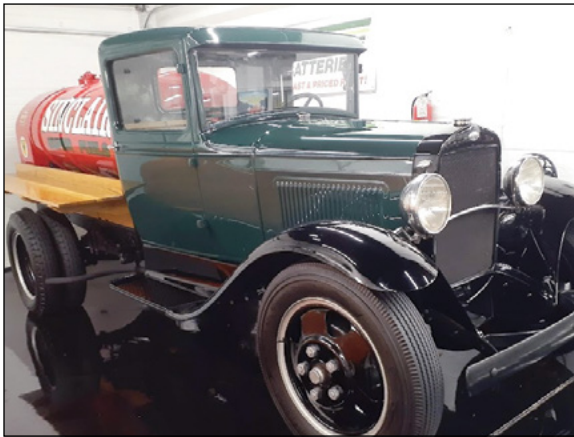
1931 Ford Sinclair Gasoline Tanker Truck