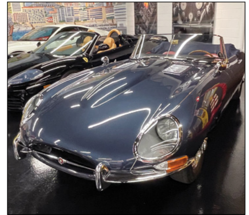
1962 Jaguar XKE