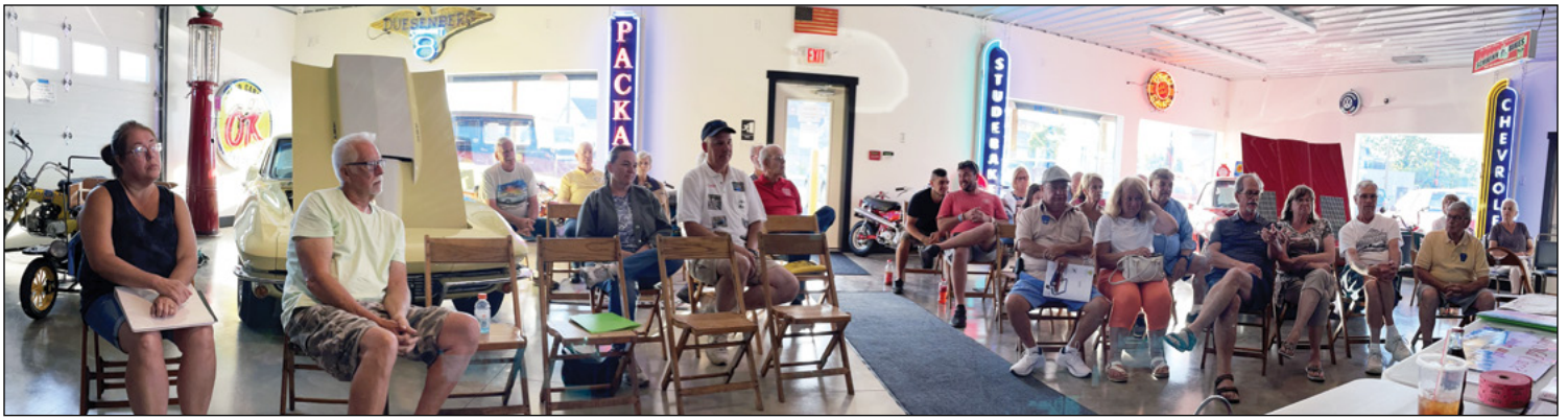
June 21 WPR Monthly Meeting hosted at Specialty Cars Limited, Latrobe