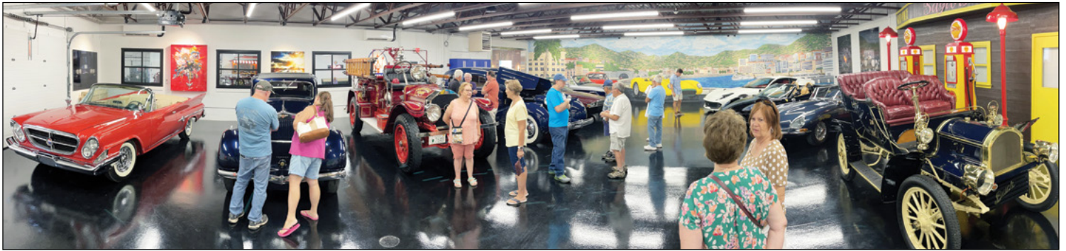
A panorama of Dan's beautiful main showroom - fabulous vehicles from nearly every era.