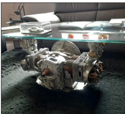
Porsche engine base coffee table

Throughout the building is evidence of Dan's reverence for the Ferrari Automobile Company. In addition to several Ferraris that Dan owns, there are Ferrari steering wheels functioning as doorknobs on clear glass, floor to ceiling doors that separate the two showrooms, the completely equipped "Ice Cream Parlor" and the "Man Cave". The back wall of the main showroom is adorned with a beautifully detailed painting of the seaside bay in the city of Monte Carlo in the tiny country