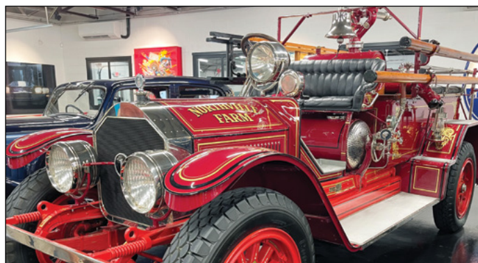
1924 American LaFrance firetruck