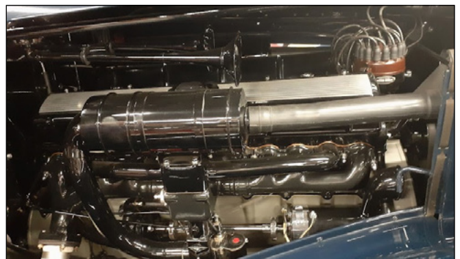
Marveling at a 1936 Cadillac V-16 engine, which was specially designed to look marvelous. The distributor cap is a sight to behold.