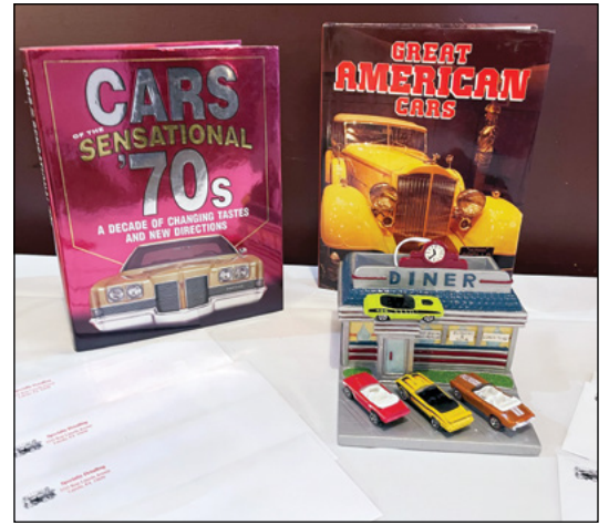
Door prizes included beautiful antique car books.