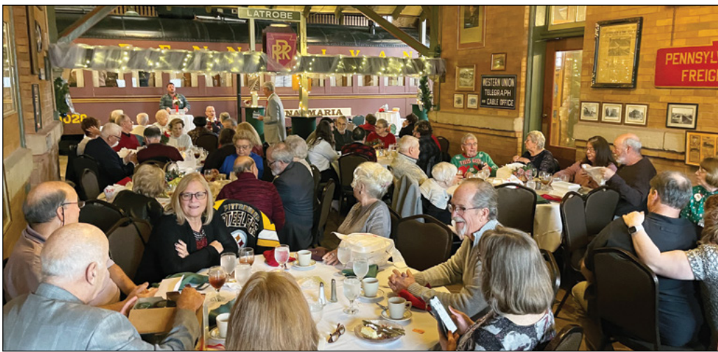
The historic railroad motifs and round dining tables made for a warm and wonderful get together.