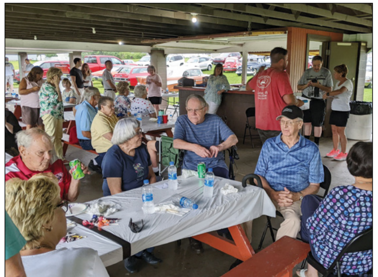
The WPR Summer Picnic is always a fun time to get together and this one was especially wonderful with 60 attending.