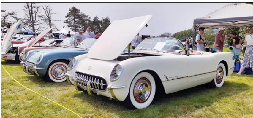
Corvette section in 2021 when Corvette was the featured car of the year.