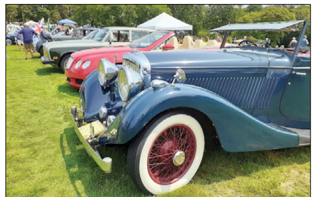
Rolls Royce and Bentleys