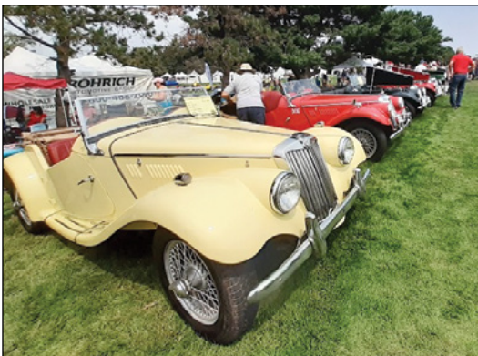
MG "T" series at Schenley Park

Western PA and beyond than most people can imagine, and I am amazed at the number of car enthusiasts I meet that have never attended any of the PVGP events. My best guess for this lack of interest is because most of the cars that I see at all the car events I attend are American and most of the race cars and cars on display at the races are of foreign origin. However, I can assure everyone that they will be pleasantly surprised and in total awe of the number, quality, and uniqueness of cars they will see at PVGP events. The car cruise at the Waterfront shopping area, which is held on Tuesdays has about 600 cars, mostly American. In Schenley Park on Saturday during the time trials for the races, there are more than 3 thousand cars on display with a whole section dedicated to American Cars. There are special sections for the Corvette Club, the Thunderbird Club, the Mustang Club and many other American Car Clubs. There are also sections for all the German, English, and Japanese Cars. Years ago, there were almost no Italian Cars, but now there is a whole section of the show field for Italian cars called the Italian Cortile which now includes a small section called "The French Quarter". To begin to tell you about all about the PVGP would be well beyond the capacity of this