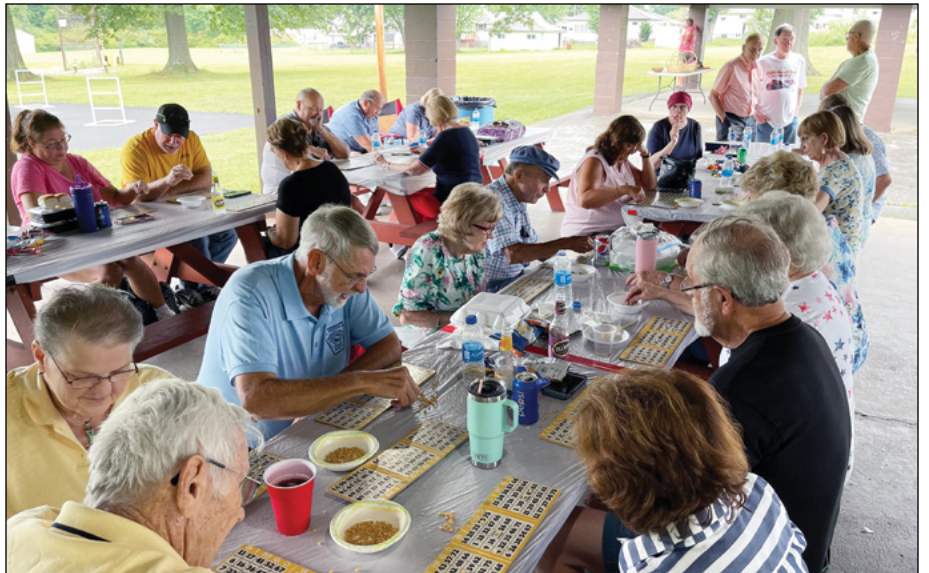
Western PA Region members put their listening and observation skills to work during the BINGO games. The last game was for a full card - wow!