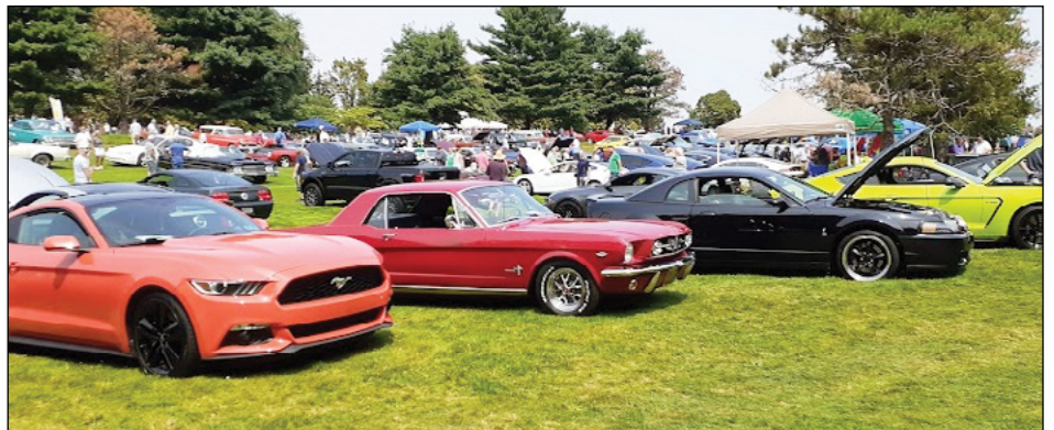
Mustang section at Schenley Park on race day weekend