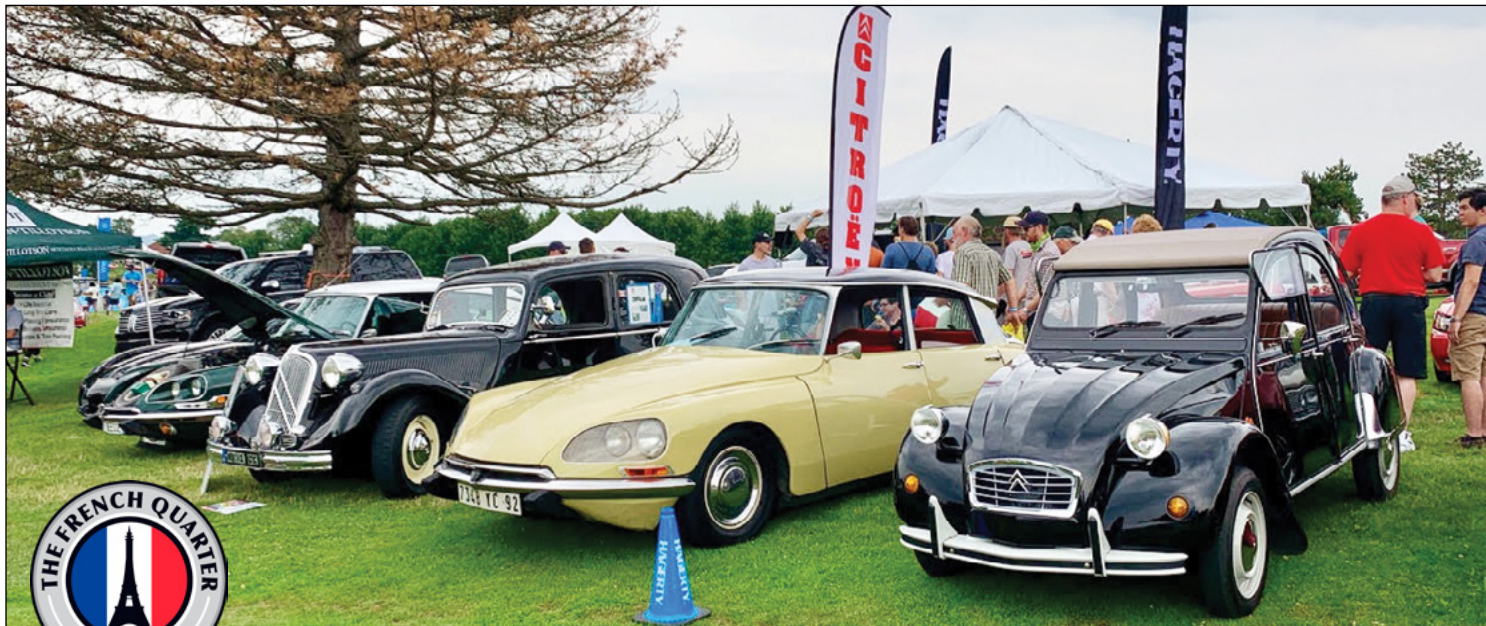
Citroens at Hagerty booth in 2021