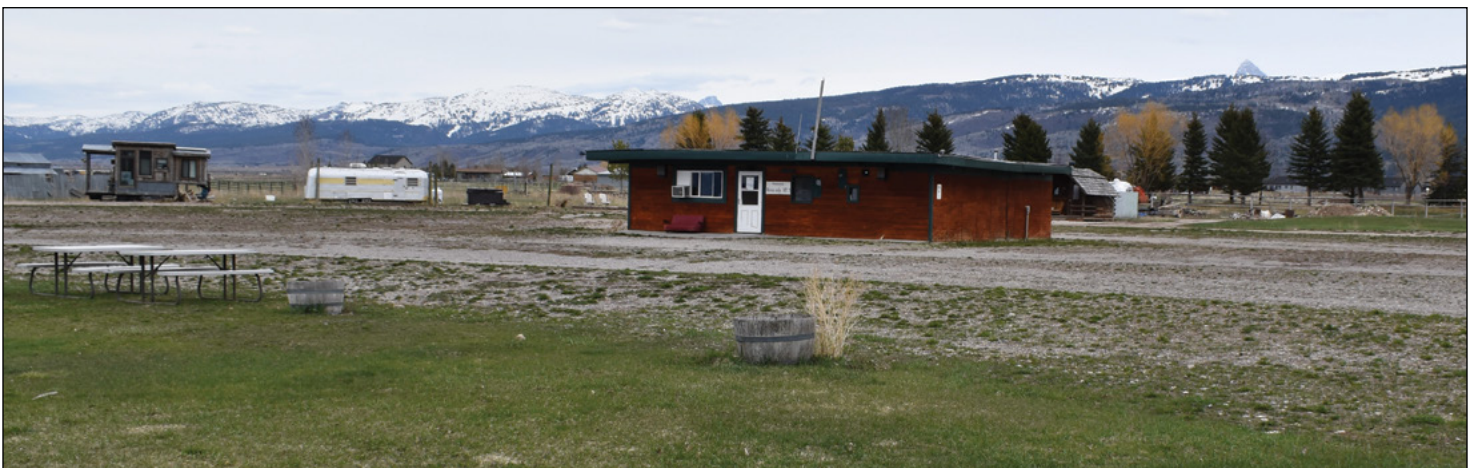
The Spud Drive-In Theatre projection building and concession stand with snow capped mountains in the background

family no doubt consumed many french fries and potato chips. If the family decided to take in the double-feature, perhaps Mrs. Potato Head would have packed a food basket of potato soup, potato salad and potatoes au gratin. Hopefully, the little spuds would behave themselves and avoid arguments and fights or else we might end up with a few mashed potatoes. At the conclusion of the picture show, Mr. and Mrs. Potato Head would have taken all their little spuds home, and tucked them securely in their vegetable beds for a quiet nights rest. One never knows what one might encounter on the road less traveled by.