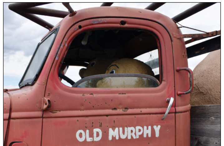
In the cab of "Old Murphy" a potato driver and passenger keep their "eyes" on the road.