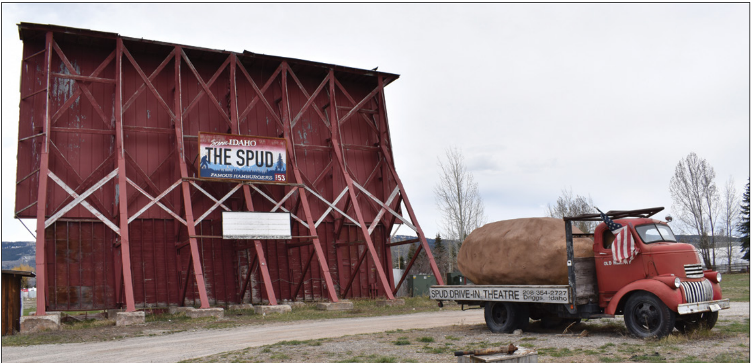
A 1946 Chevrolet flatbed truck hauling a giant potato and marks the location of the Spud Drive-In Theatre near Driggs, Idaho.