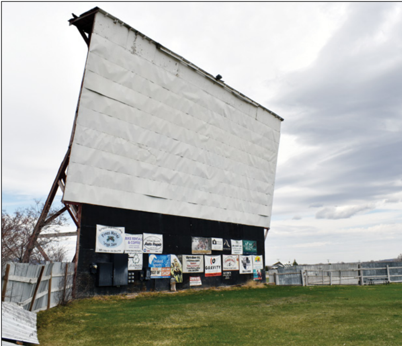
The big Spud Drive-In Theatre projection screen