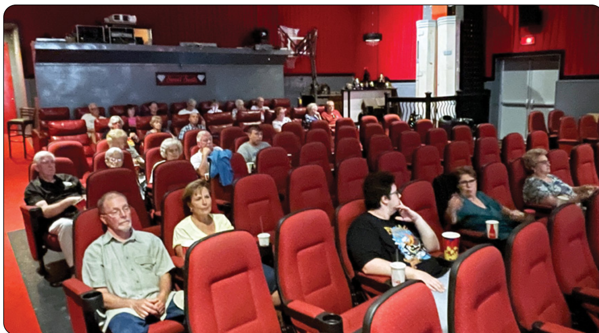
Western PA Region AACA members relax in the comfortable seats of Diamond Theater of Ligonier getting ready for a great “car movie” with popcorn and drinks close at hand.