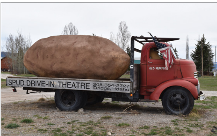
This side view of the '46 Chevrolet flatbed truck helps show the astounding size of its man-made spud cargo

As I studied the deserted grassy expanse which stretched