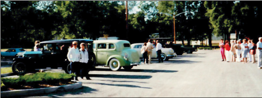
Getting ready for the first show at Legion Keener Park.