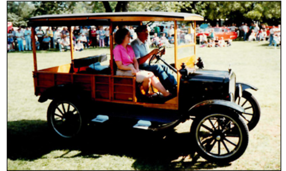
Model T Ford Depot Hack