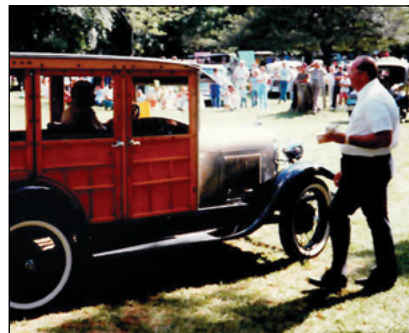
An award for a Model A Ford Woody