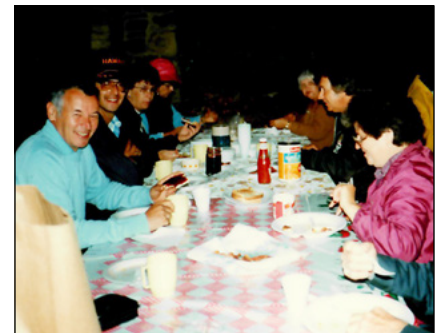
Enjoying a picnic meal at the Car Show.