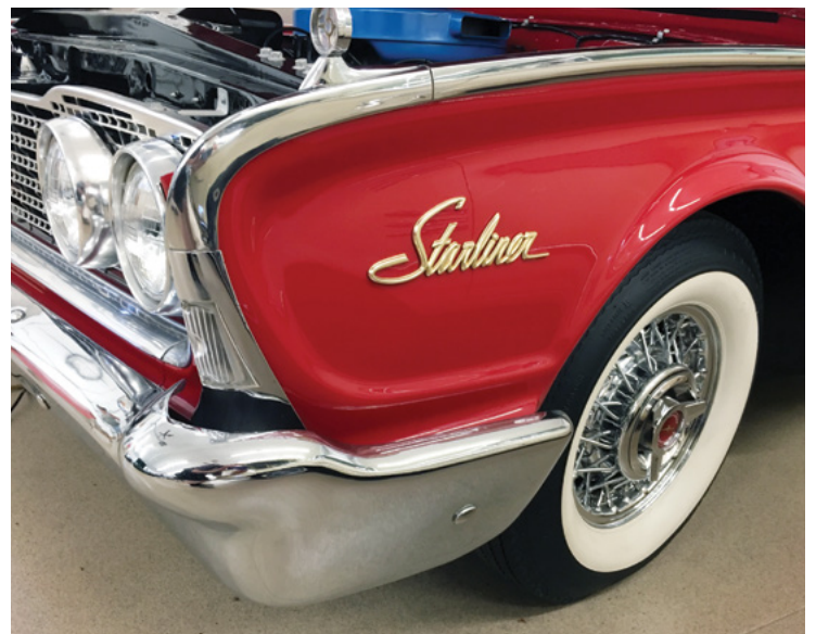
Detail of a 1960 Ford Starliner with beautiful script lettering