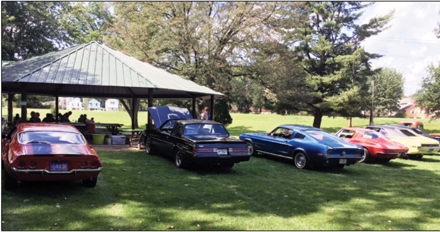
Members antique cars surround the big pavilion at Legion Keener Park, Latrobe.