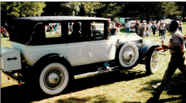
A dapper Rolls Royce receives an award.