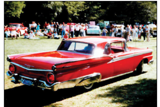
Flashy 1959 Ford