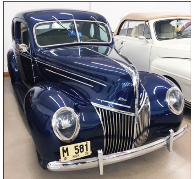
Stunning 1939 Ford Resto Rod