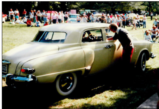
A late 1940's Studebaker receives an award