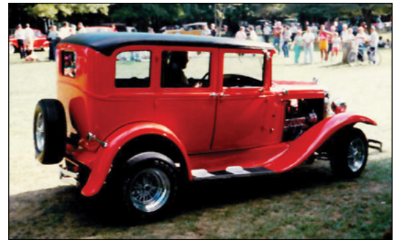
Street Rods participated too.