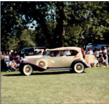
Early 30's classic wows the crowd.