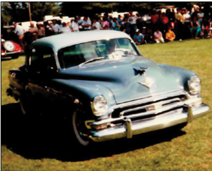
1954 Chrysler cruises by.