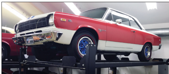
American Motors "SC/Rambler" with a 390 V-8