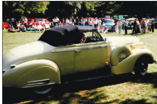
Looks like a 1937 Buick.