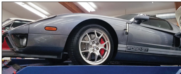
A Ford GT40 similar to the ones that beat Ferrari in the LeMans Race.