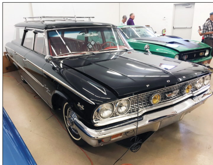
A super roomy, super powerful 1963 Ford Station Wagon featuring the legendary 427 V-8 with a four-speed transmission.