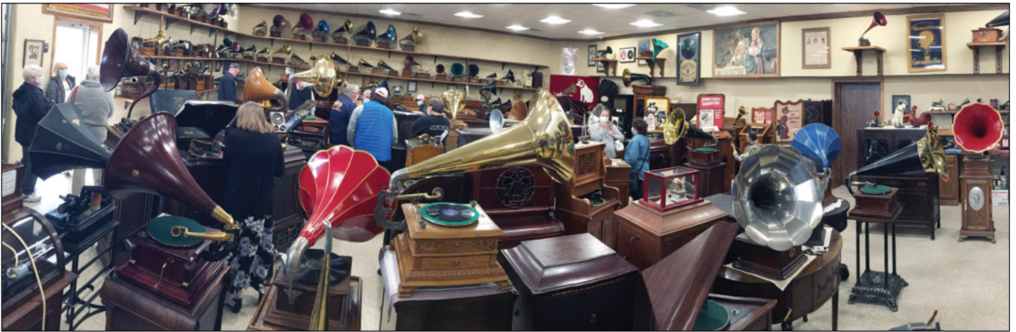
Amazing early phonographs of every shape and size including exotic horns, turn tables, wax cylinder models and arcade machines