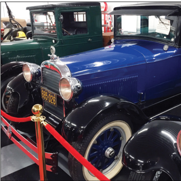
A sturdy and stately 1927 Hudson Sedan