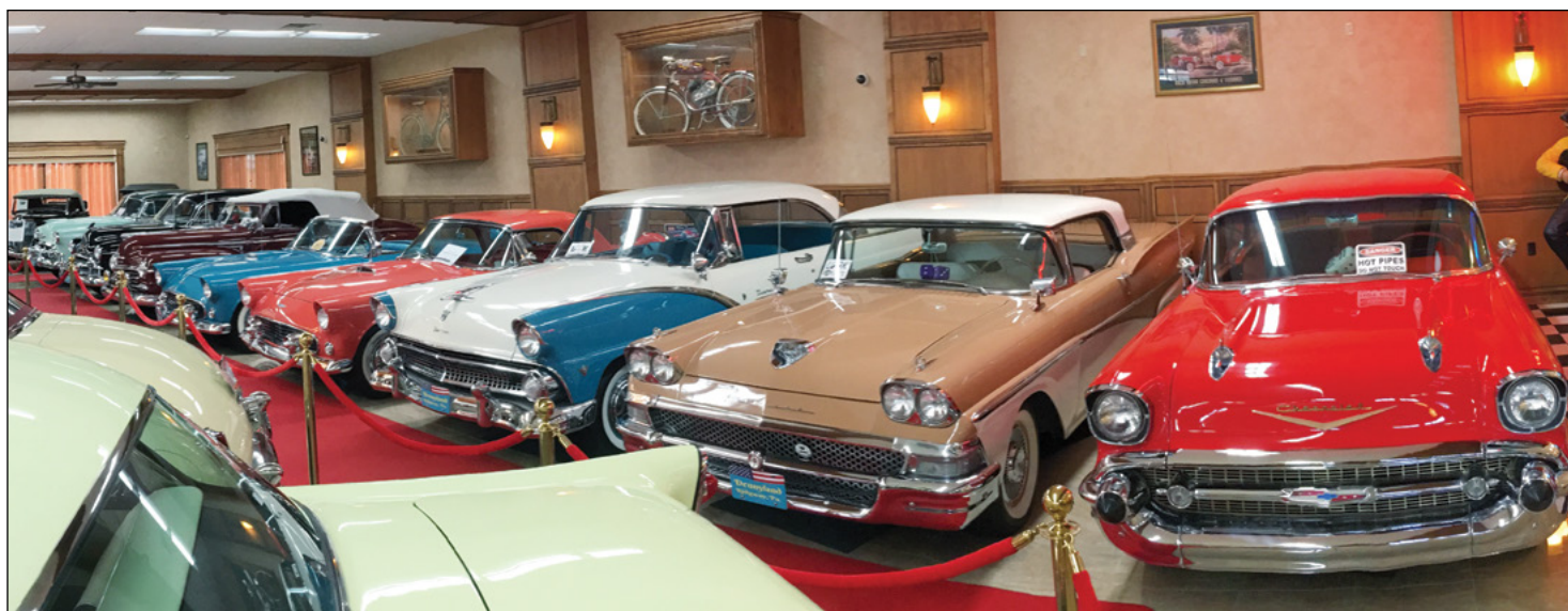
A panorama line-up of stunning '50's Fords and Chevys with a Plymouth Convertible far left, and Whizzer bicycle encased on the wall.

We were fortunate to have a beautiful October day in the height of fall foliage season for our long drive through the countryside to Dennyland in Ridgway, PA. Our departure time was 9:00 a.m. at the McDonald's parking lot on U.S. Route 22 in Blairsville, PA, where our group had time to grab a quick breakfast.