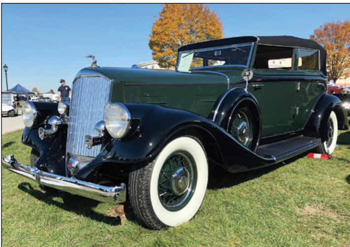
A 1934 Pierce Arrow with those glorious trademark headlights flared into its fenders