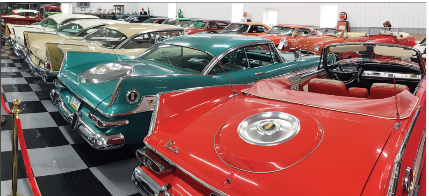
The fins of these Plymouth Furys illustrate the exciting dynamics of the Chrysler Corporation's late '50's to early '60's "Forward Look"