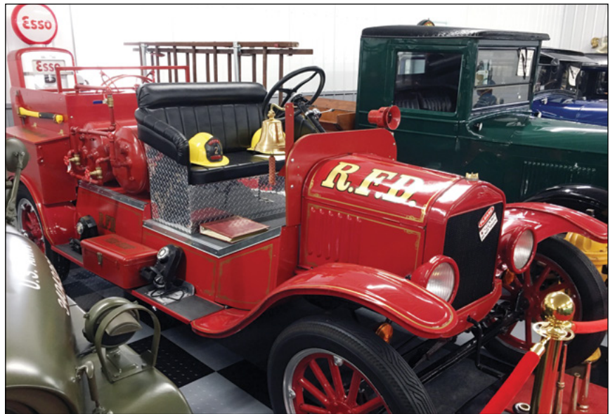
Magnificent Model T Ford Firetruck