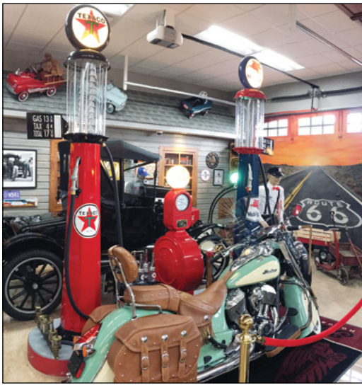
Antique gas pumps and an Indian motorcycle