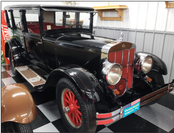
A 1928 Franklin 4-door Sedan. Franklins were made in Syracuse, NY and featured a unique air-cooled engine.