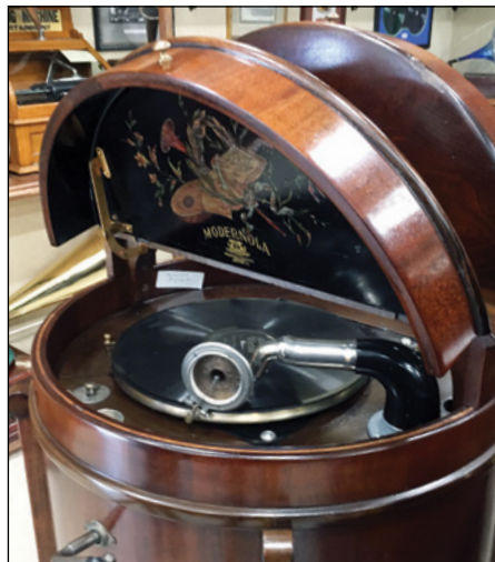
A unique, round cabinet "Modernola" phonograph made in Johnstown, PA