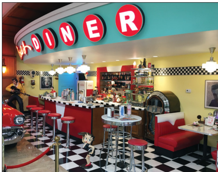
Rose's Diner offers a warm, nostalgic glow in the main showroom.