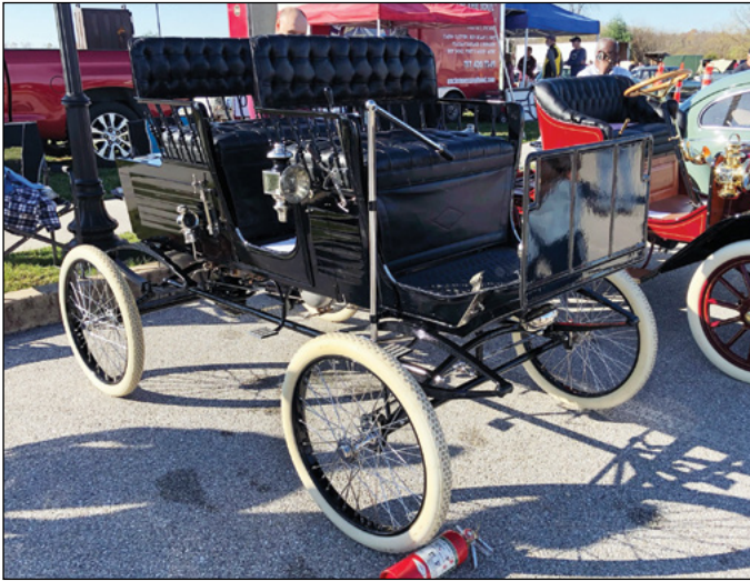
This 1900 Locomobile helped pave the way for automobiles.