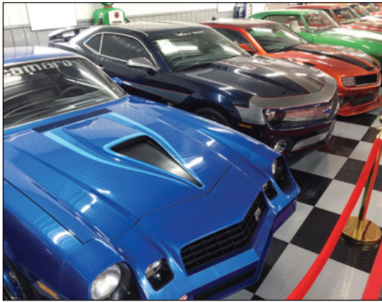
A colorful line-up of Chevrolet Camaro muscle