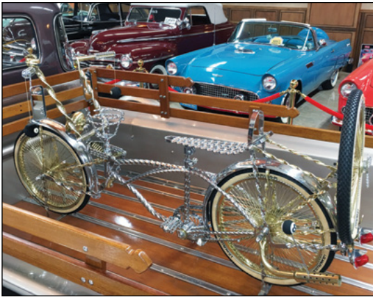
The wild, artsy, custom bicycle that came with Denny's resto-mod 1950 Chevy Pickup