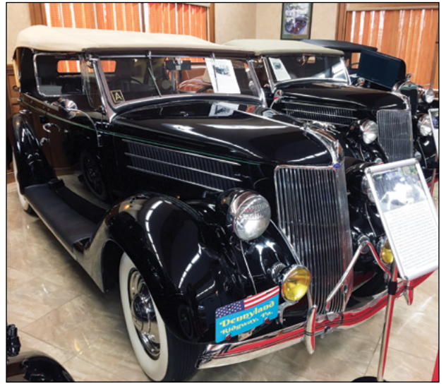
1936 Ford Convertibles - 4 door and Roadster