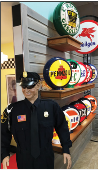
Police officer and gas globes