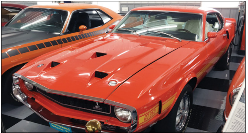
1970 Shelby Mustang Fastback

the most incredible private car and phonograph collections anywhere.