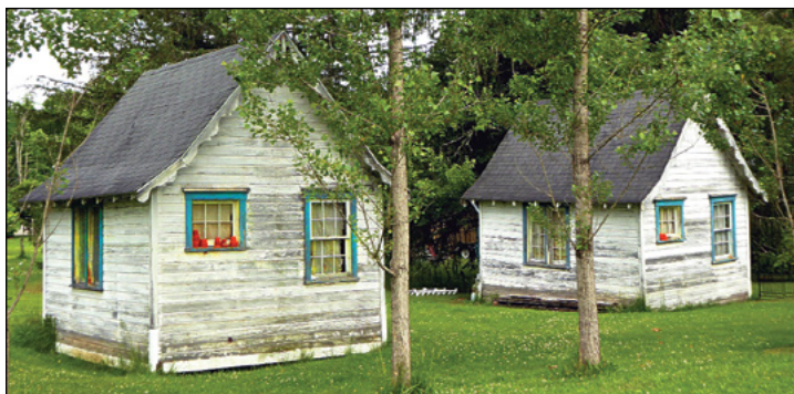
Clay Stoner took this photo of two surviving Shirey Cabins which were moved to a new location along Old Route 30.

Clay Stoner was the first to correctly identify October's Roadside Memory as Shirey's Cabins which were cute little wooden cottages travelers could stay in as they traveled U.S. Route 30. The cabins were located along Route 30 between Latrobe and Ligonier. Shirey's Lakeview Motel sat adjacent to the cabins. After closing in 1988, these little cabins were sold and moved to different locations. I took this photo of the Shirey Cabins with my Minolta 35mm film camera on a Sunday drive not long after they closed. Clay Stoner sent us a recent photo of two of the cabins which were moved to a location along Old Route 30. Tom King also correctly identified the cabins. Bill Maurer remembered them as well.