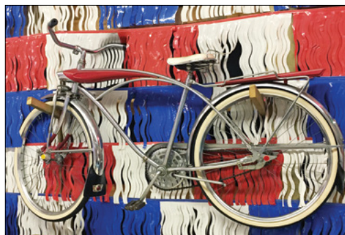
An antique bicycle with a patriotic background