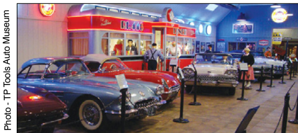
Photo - TP Tools Auto Museum

Step back in time. Over 50 cars on display along with a 50's replica diner, soda and chocolate malt bars, Buick service area, gas station, country store and other nostalgic decor.