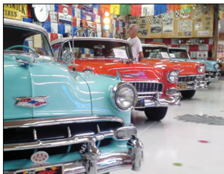
Chevy convertibles - '54, '55, '56 & '57