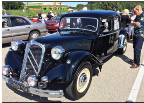
The Erb's 1952 Citroën Traction Avant drew it's share of admirers.