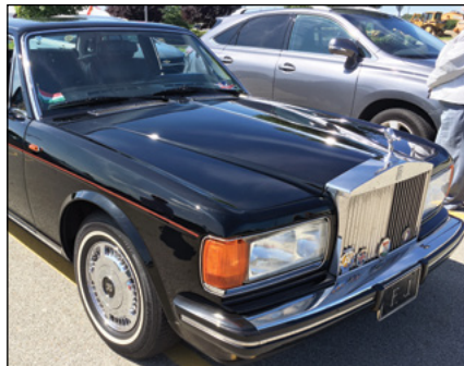
This distinguished Rolls Royce is out for fun and ready to roll.