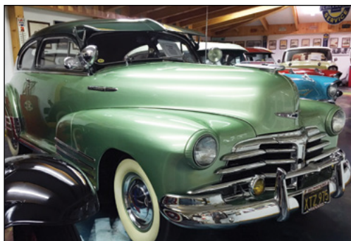
Stunning 1948 Chevy Aerosedan