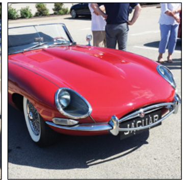
There's no mistaking the marque of this red sports car.