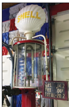
20 cents a gallon!