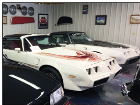
Sharp Pontiac Trans AMs