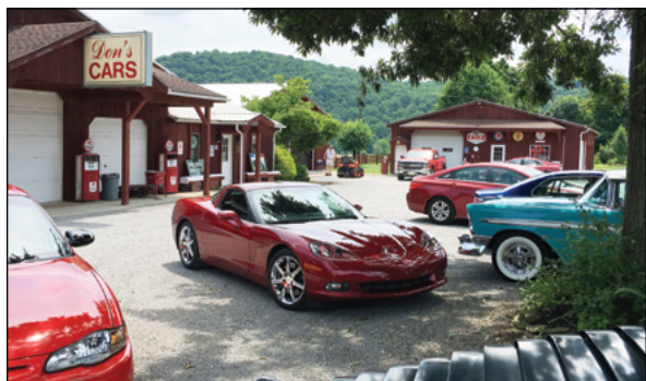
Members' cars parked by Don's buildings