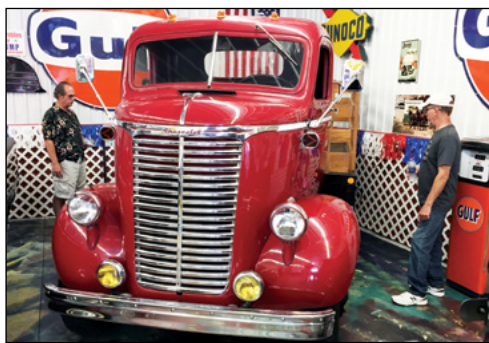
1938 Chevy COE (Cab Over Engine) coal truck