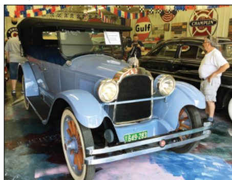
Carl Erb admires a 1923 Willys-Knight