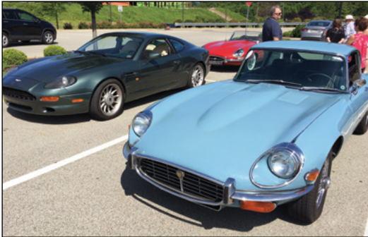
A variety of Jaguars gather at the Irwin Wal-Mart prepared for the day's adventure.