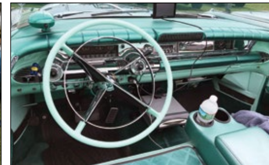
A 1958 Buick dash - geezz..what to look at first?