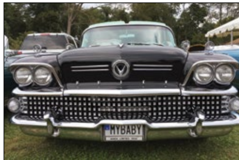
A 1958 Buick, an explosion in chrome!