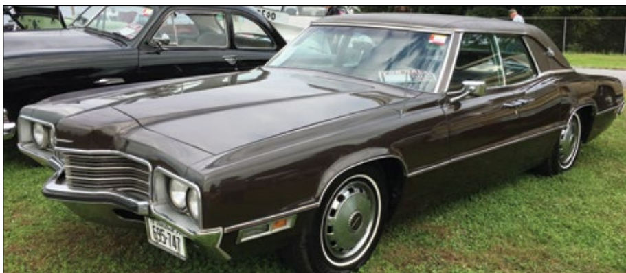
Another "nice driver" vote to take home at $8,900 - 1971 T-Bird 4 door with 38,000 miles