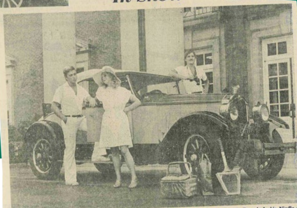
SHOW POSTER — The poster announcing the second annual antique and classic automobile exhibition at Westmoreland County Museum of Art, Greensburg, is reprinted above. It