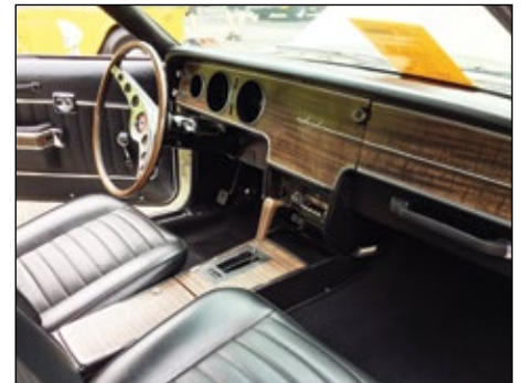
1970 AMC Javelin SST