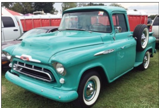
Nice 1957 Chevy pick up - when trucks were trucks