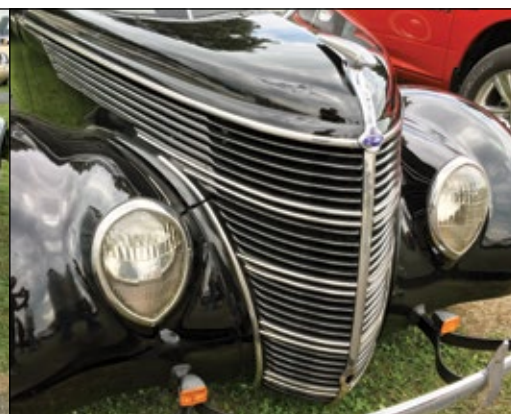
Dad always said, "Ford was ahead in styling", 1933 to 1938 - nice five year progression!