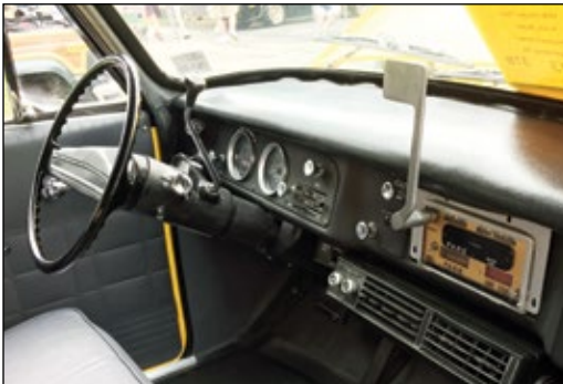
1976 Checker Taxi