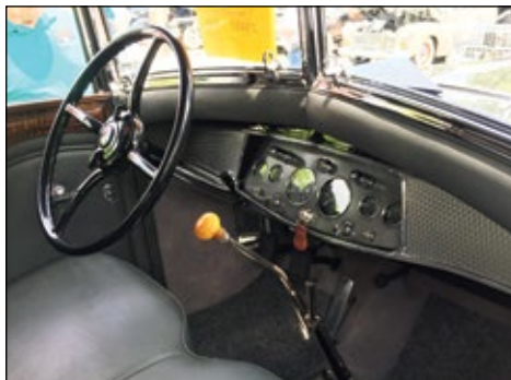
1931 Cadillac V-16