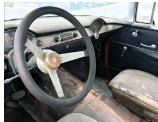
There is "patina" and there is just plain "krud."