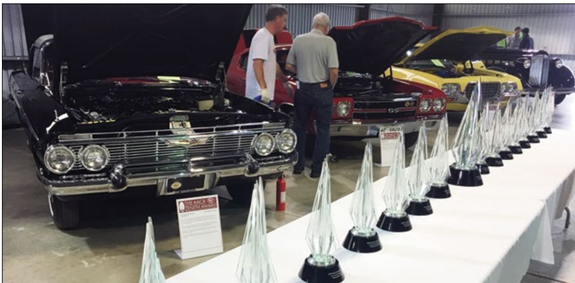
AACA Zenith Award nominated cars were judged at a Westmoreland Fairgrounds building during the 2018 Annual Grand National Meet hosted by the Western PA Region in June. Notice the car signs and crystal trophies.