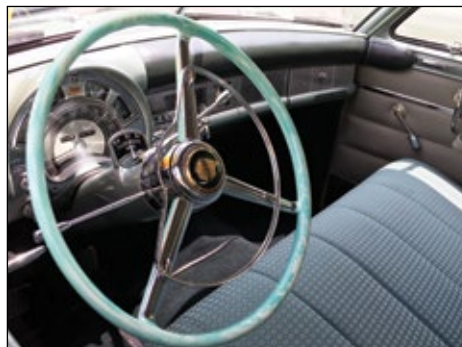
1951 Chrysler Windsor