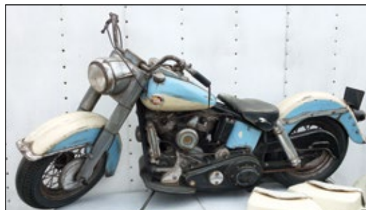
Good old Harley-Davidson workhorse