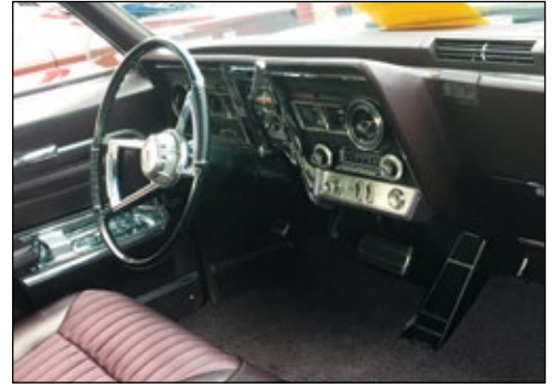
1966 Oldsmobile Toronado