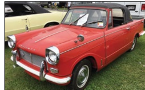
Interesting 1961 Triumph Convertible