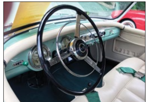
1953 Nash Healey