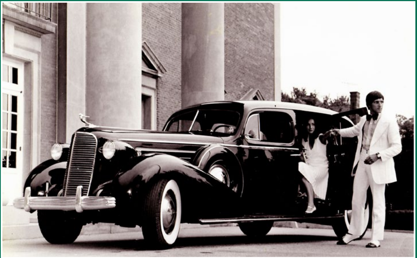
A 1936 Cadillac and stylish couple help promote a Western PA Region Car Show at the Westmoreland Museum of Art in 1974