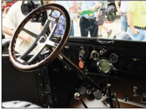
1915 Dodge Brothers Touring Car