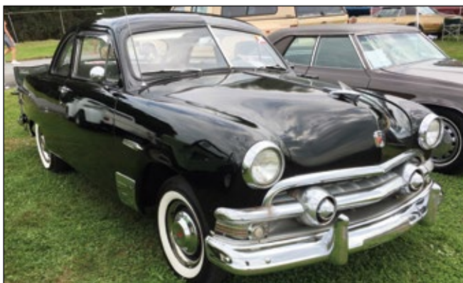
1951 Ford - my "nice driver" vote to take home at $8,900