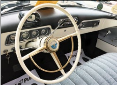
1956 Studebaker President

2018 AACA Grand National Meet hosted by the Western PA Region on June 2nd – A Dash of Dashboards