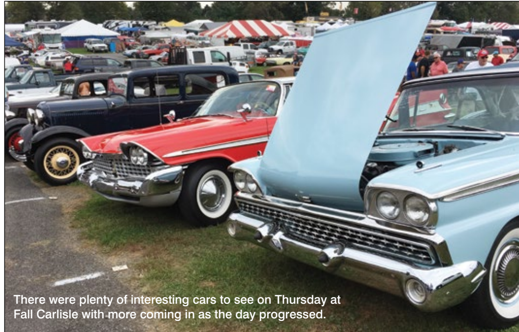
There were plenty of interesting cars to see on Thursday at Fall Carlisle with more coming in as the day progressed.