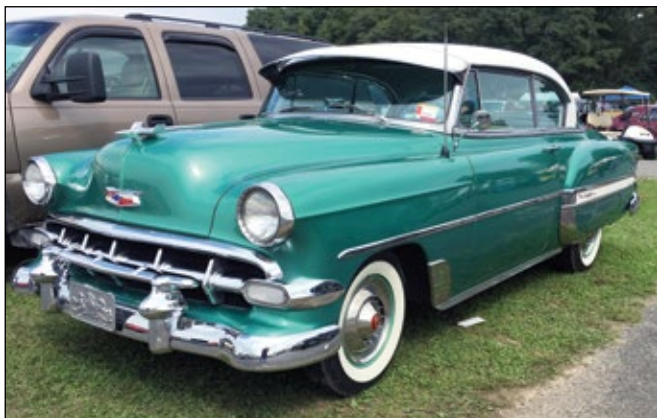
1954 Chevy Bel Air - SOLD - Someone is going to enjoy it.