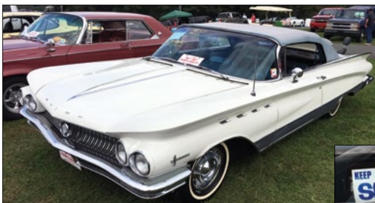
This 1959 Buick Convertible was so aggressively styled.