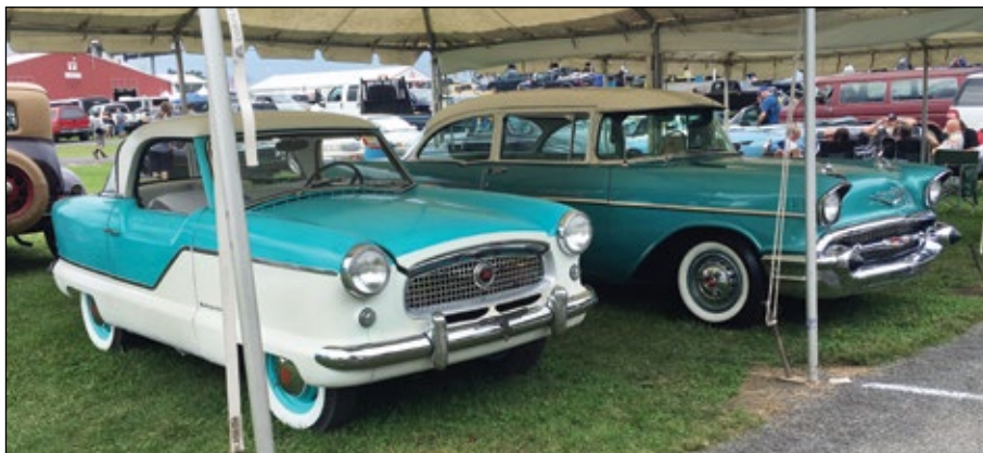
Both very cool in their own way – 1958 Nash Metropolitan and 1957 Chevrolet