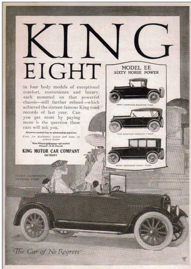
An advertisement for "The Car of No Regrets", The King Eight