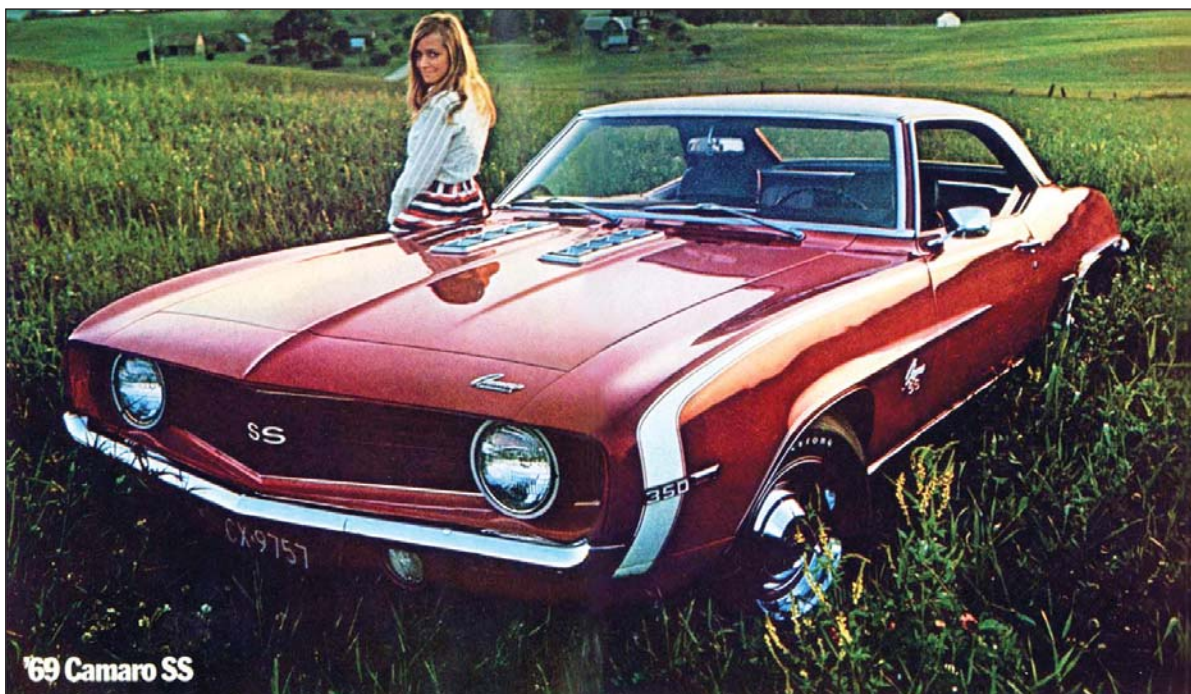
'69 Camaro SS