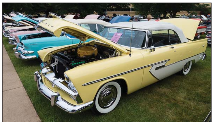
Photos from the AACAP Grand National Meet in Williamsport, PA