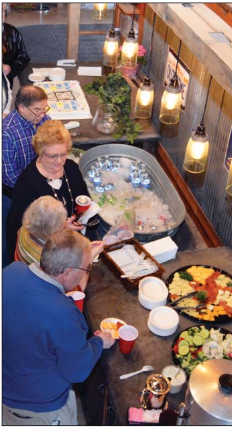
Starting off with hors d' oeuvres.