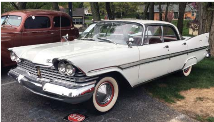
1959 Plymouth at the 2017 Spring Carlisle Auction