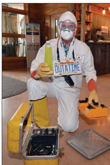
The plutonium is ready!