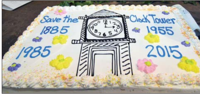
A continuity factor in all three movies chimes time for dessert!