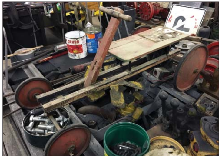
This self-propelled "kiddie car" was once fun for some lucky youngster.