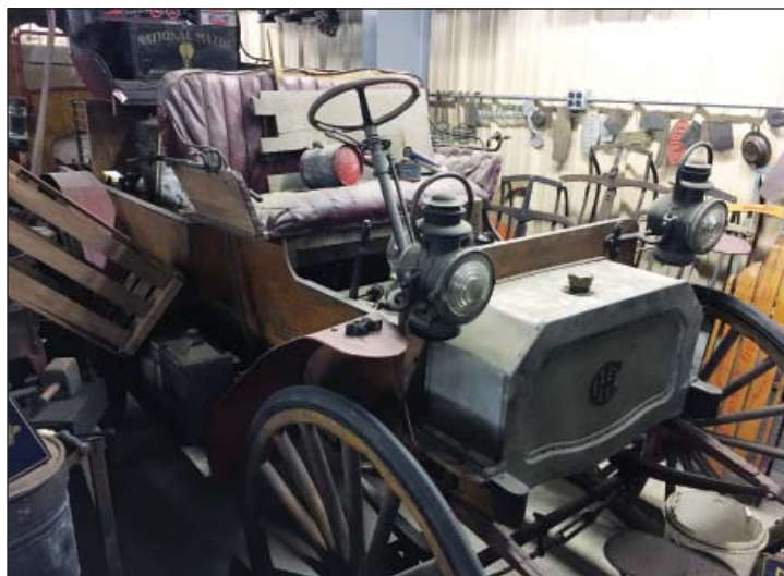
An International Harvester "high-wheeler" wagon over 100 years old