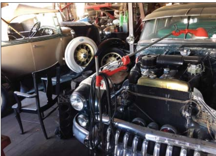
At the garage - a Model A Ford Roadster and 1950 Buick