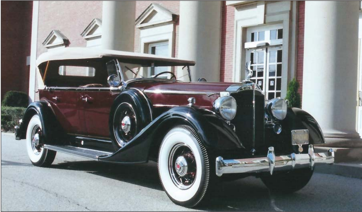
The 1934 Packard Super 8 Touring car in front of the Westmoreland Museum of American Art in Greensburg