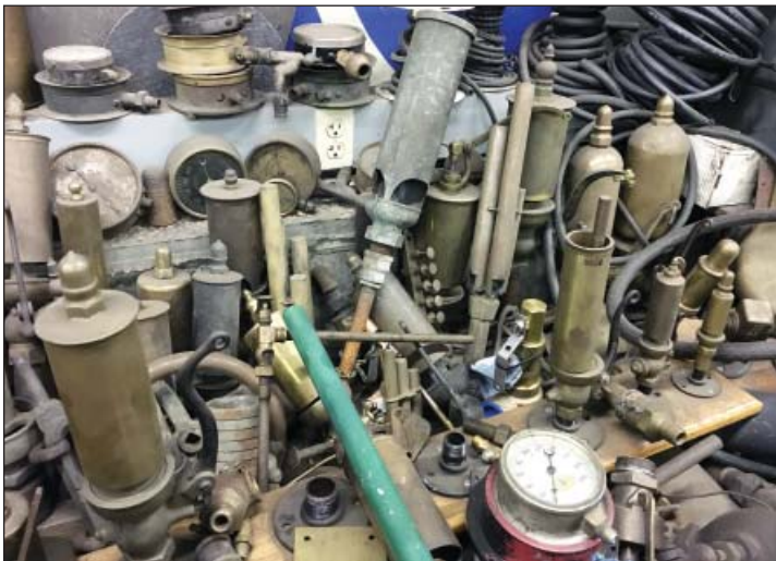
An assortment of steam whistles and gauges