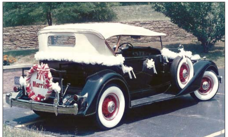
The 1934 Packard served as a wedding car for Leona and I in 1988.

After many years of use, the Packard, like all of us, began to show its age. The once bright white convertible top was now stained and tattered in several places. The leather upholstery had dried and cracked, the once gleaming paint had its share of stone chips and scratches, and the tires had begun to dry rot. Much of the chrome on the car was now dull or pitted and the once powerful straight eight engine coughed and sputtered. It was