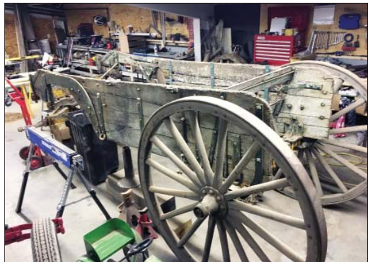
Restoring a Studebaker "dump wagon" (trap doors on bottom for dumping)