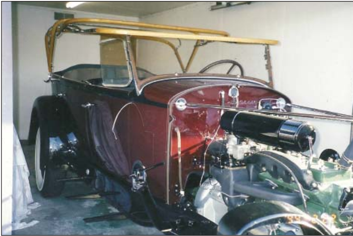
The Packard undergoing complete restoration