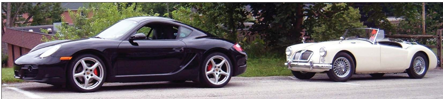
The "ying and the yang" – opposite colors and eras are connected by the love of classic sportscars.