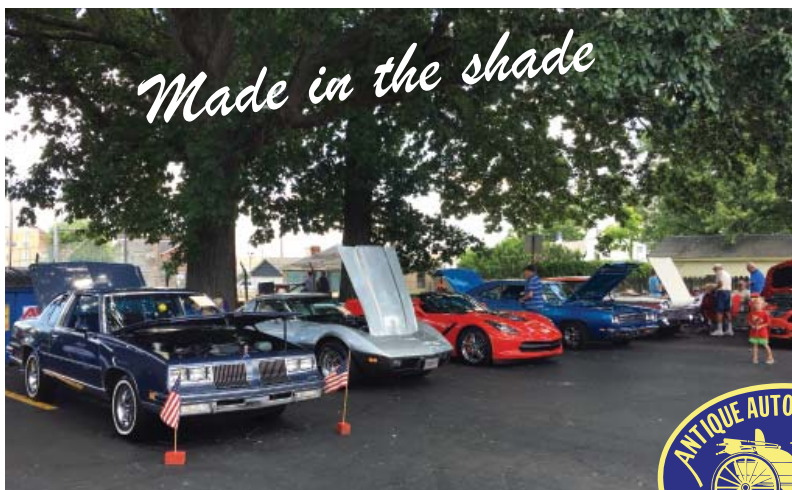
Made in the shade