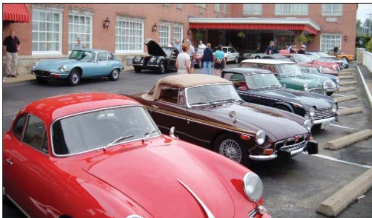
Colorful classic sportscars rest at the Ligonier Ramada

Proceeds from the Pittsburgh Vintage Grand Prix benefit the Autism Society of Pittsburgh and the Allegheny Valley School. It is presented by the Pittsburgh Automotive Dealers Foundation. Visit the Pittsburgh Vintage Grand Prix website www.pvgp.org