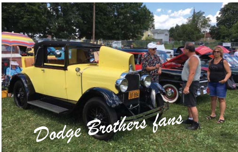
Dodge Brothers fans