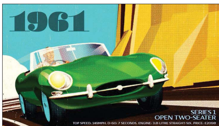
Classic Jaguar advertising illustration

Wanted - Antique Cars , Any make, any model. No projects, Original condition preferred. 724-771-5170