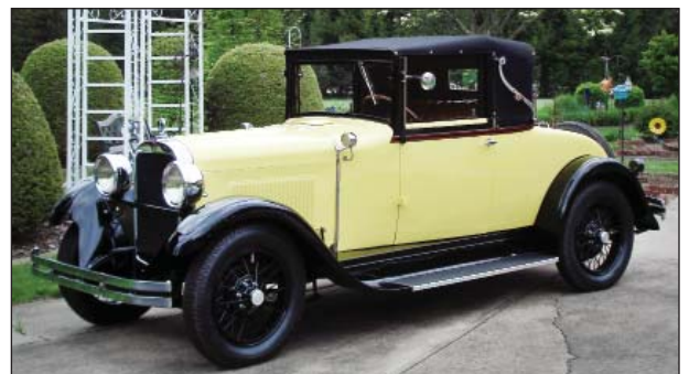
The 1928 Dodge Brothers Cabriolet beautifully restored.