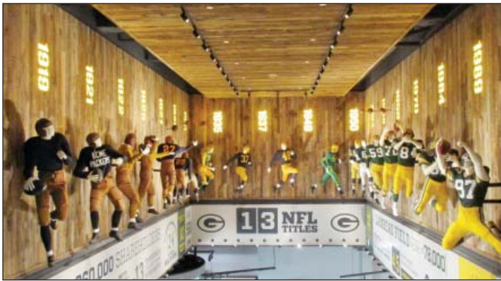
Green Bay Packers history of uniforms