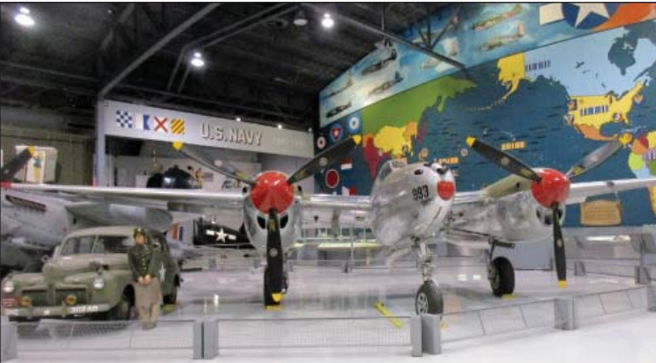
World War II display featuring a 1942 Ford staff car and a P-38