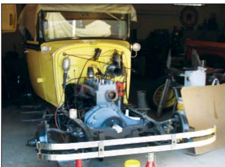
The 1928 Cabriolet in Duane's shop