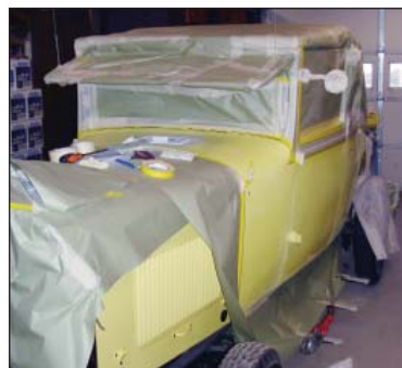
Paint masking at Rain's Auto Body