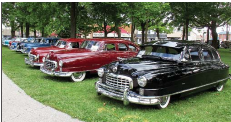
Nashes glisten in the park in Manitowoc, Wisconsin