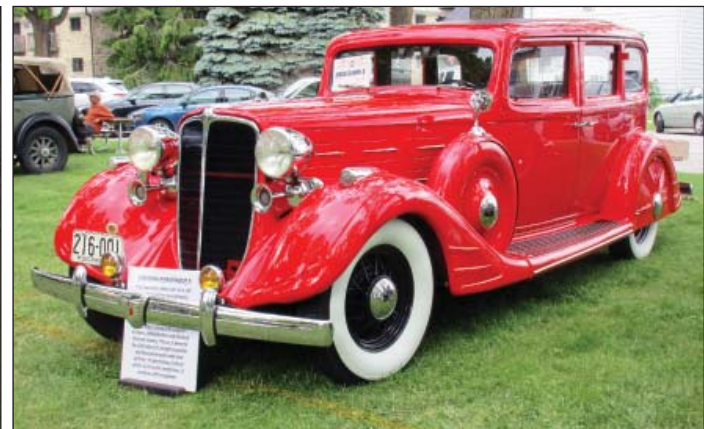
2017 Grand Nashional Best of Show - 1934 Nash Ambassador 8

We traveled to our annual Grand Nashional meet. This year's location was in Manitowoc, WI (south of Green Bay). We hauled our 1946 Nash Slipstream to the meet. The first day of the meet we met the club at Green Bay's Lambeau field and took a self-guided tour of the facility. The field and stadium was named after Green Bay native, Earl 'Curly' Lambeau who was the founder, a star fullback, coach (31 seasons), and team vice president. The Green Bay Packers got their name from their sponsors, the Indian (Meat) Packing Company that was bought out by the Acme Packing Company. The facility has a large display of memorabilia of the team and its town's history. The team was established in 1919 and the team is credited with thirteen championships including four Super Bowls.