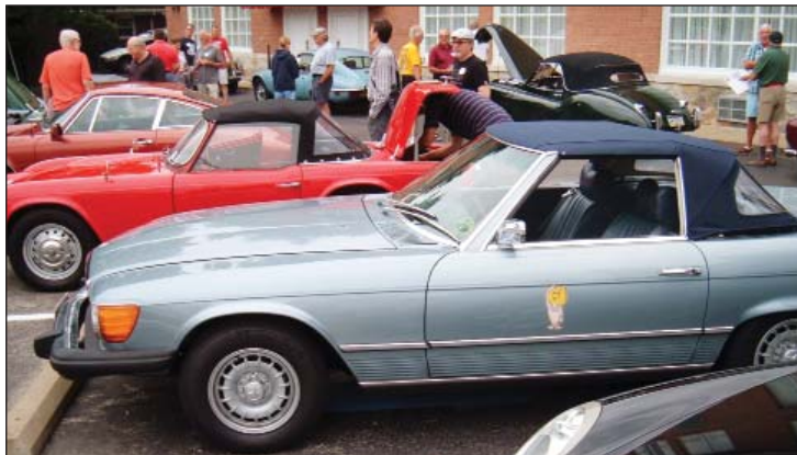
Esso gasoline's "Drop Man" adorns the side of this Mercedes.