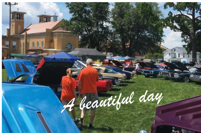
A beautiful day