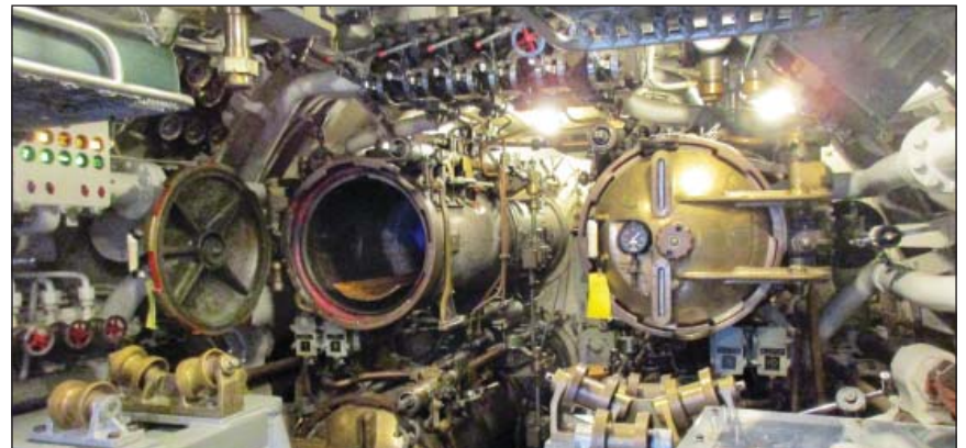
Torpedo area of the USS Cobia

were able to film the cars still sitting on the lower decks of the ship. The theory was that the ship was in route to the Detroit Auto Show for 1925.