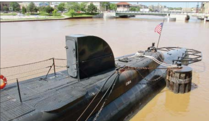
The USS Cobia, a WWII submarine at the Maritime Museum