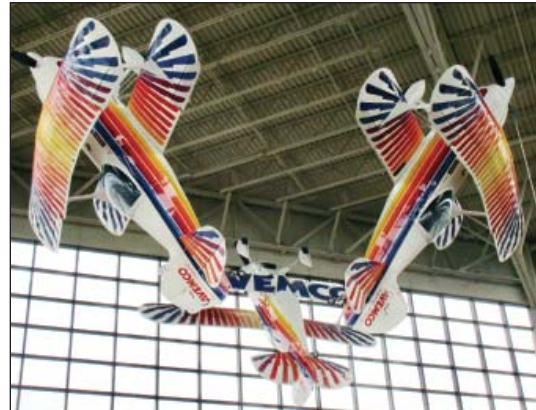
At the Experimental Aircraft Association Museum