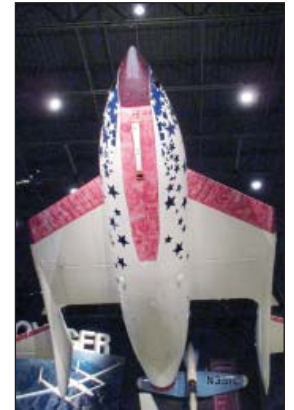
Space Ship One