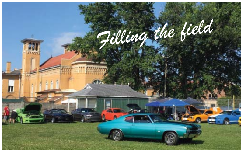
Filling the field

Promoting the Preservation & Enjoyment of Antique Automobiles Since 1950.