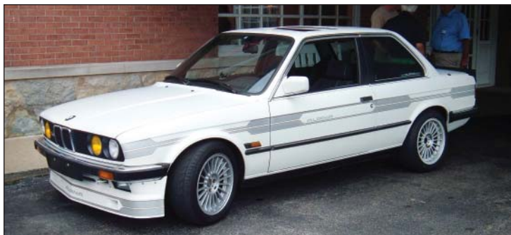
A classic BMW ready to enjoy the Countryside Tour

The tour is sponsored by the Coventry Inn, Indiana, PA.