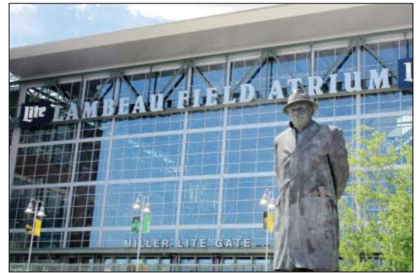
Vince Lombardi statue