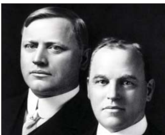
John and Horace Dodge produced their first Dodge Brothers car in 1914.