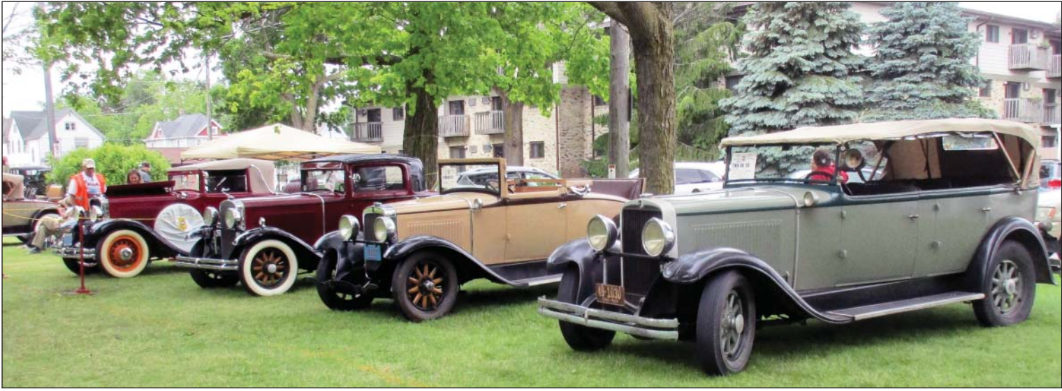
Second row of Nashes at the Annual Grand Nashional in the park in Manitowoc, Wisconsin