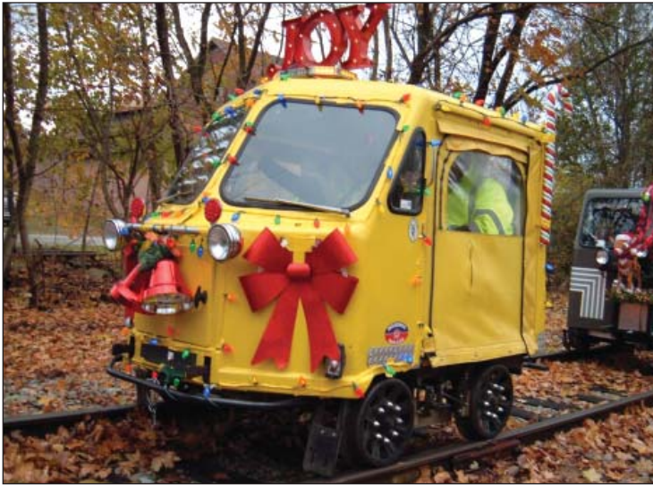
A classic railcar once used for rail maintenance and inspections now helps spread Christmas cheer wherever it goes.