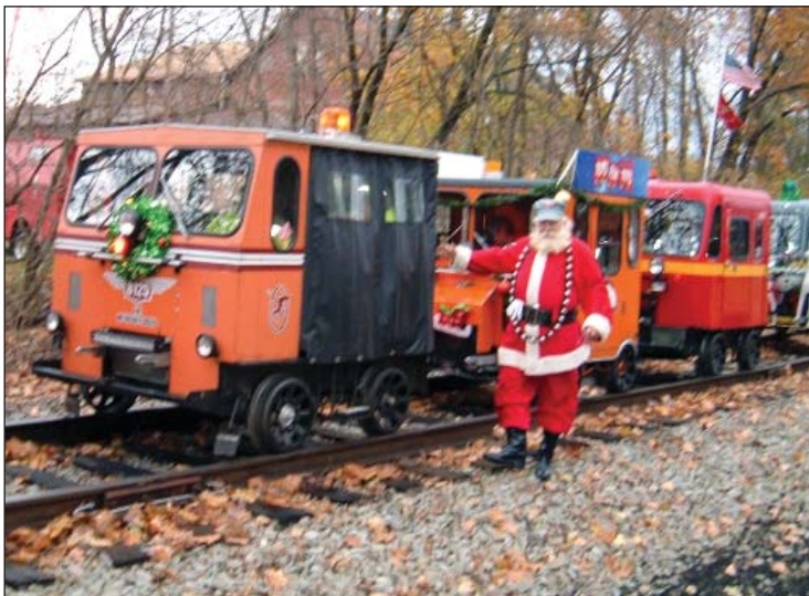
Santa tries out a new mode of transportation.