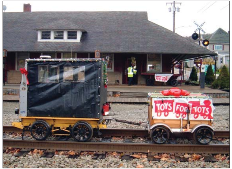
The Toys For Tots railcar arrives at the Youngwood Railroad Museum.