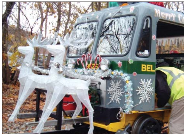
Only two reindeer are needed for this railcar.