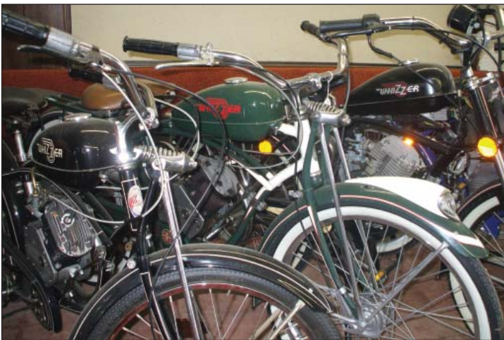
A small sample of Bob Thomas's antique Whizzer motor bike collection

Along side Bob's mechanical shop is an amazing