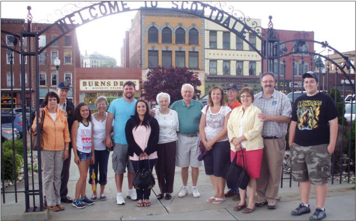
Last stop - historic Scottsdale, this group is ready for a delicious Italian buffet dinner at Carson's.