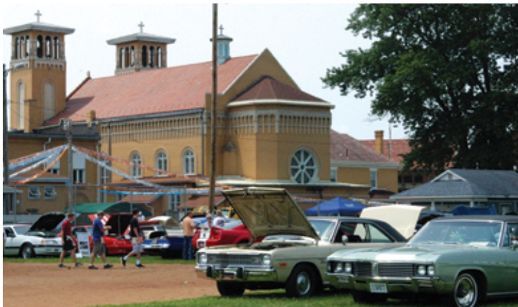
View of Visitation Church from adjoining Frick Park in Mount Pleasant