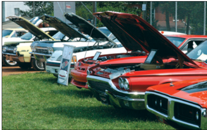
An open hood salute - ready for inspection at Frick Park