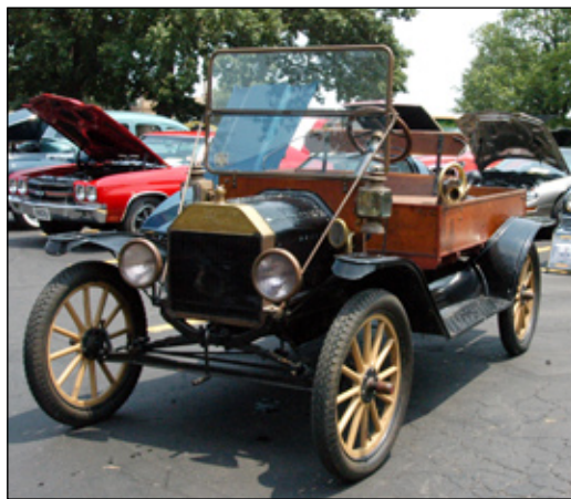
A 1912 Model T Ford Depot Hack