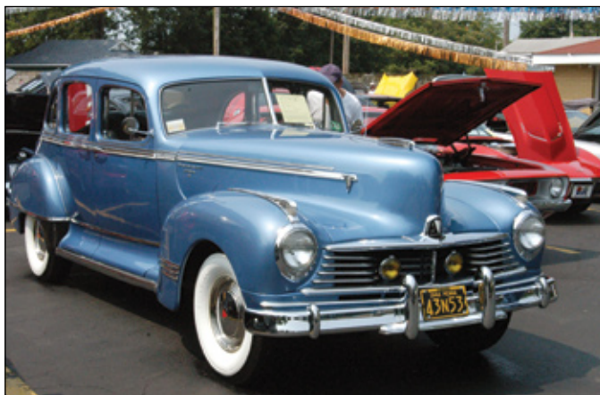
This splendid 1946 Hudson shows off it's wide whites.