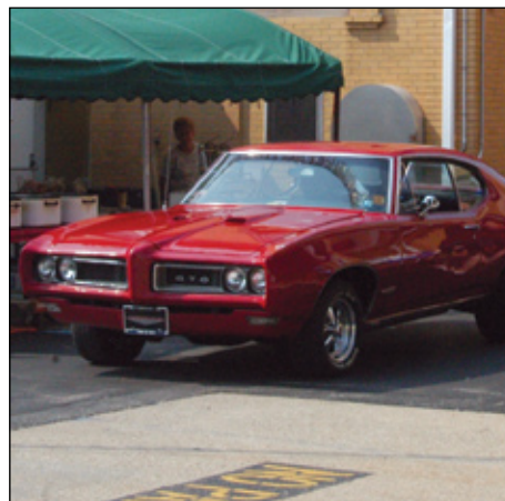
A Pontiac GTO enters the show field.