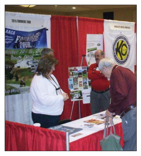
Promoting the Founders Tour in Northeastern Ohio which is coming up in September.