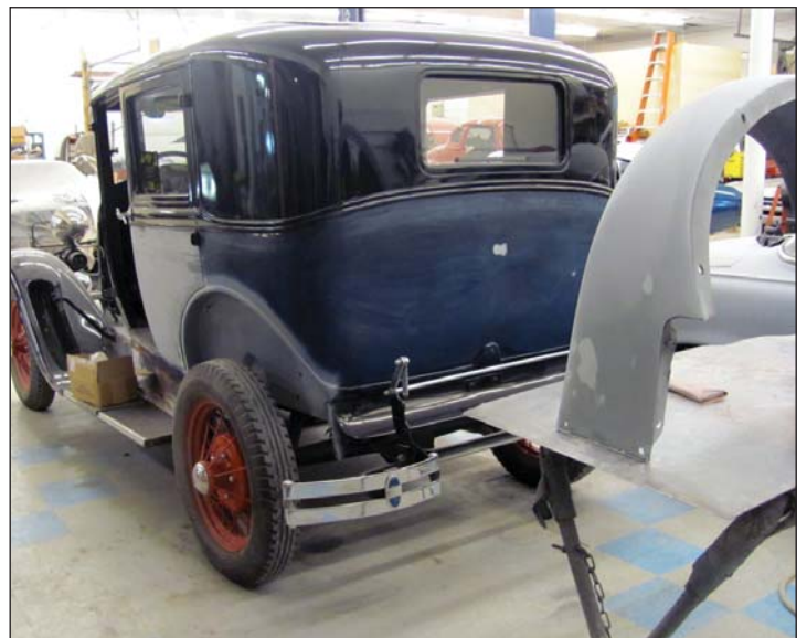
Rear fenders are being revamped and made ready to intall.

We had a great deal of fun with these cars, showing them in the judged car shows that were popular through