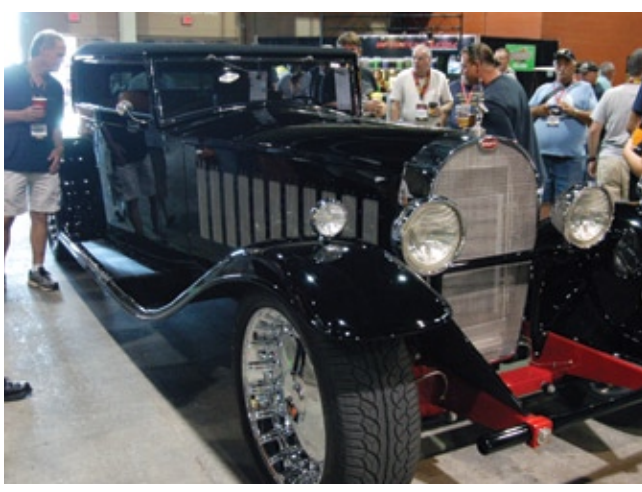
The behemoth Bugatti creation rolls towards the auction bloom

had a blast. A band of 15 Western PA Region members got on the bus for a visit to the second annual Mecum Auctions at the PA Farm Show Complex and Expo Center in Harrisburg, PA on Friday, July 31st, and then went on to enjoy the sites around Hershey, the next day.