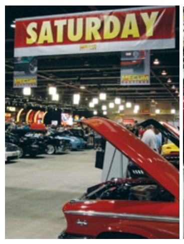
Cars lined up in the main auction hall on July 31st