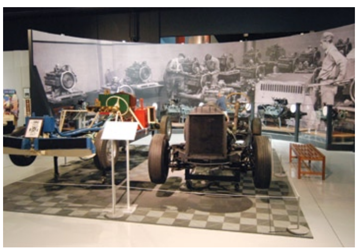
Tucker chassis, engines and photo mural of the shop at work.