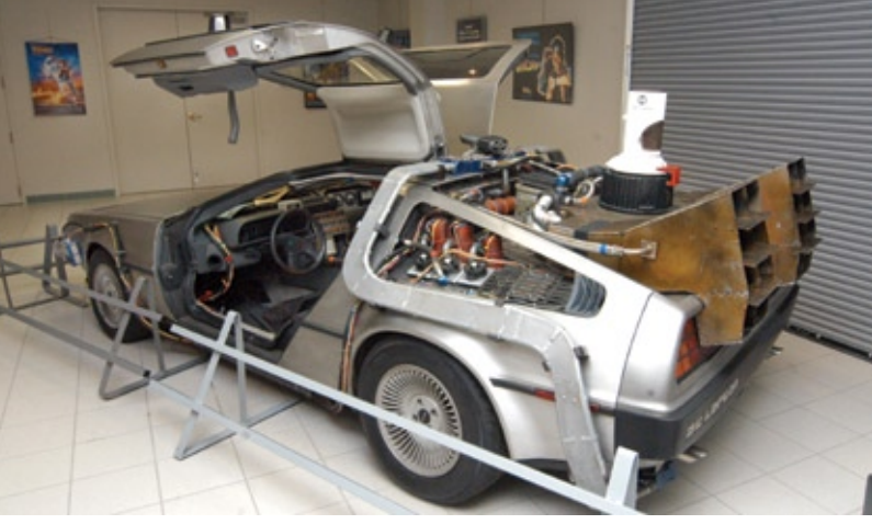
Celebrating the "Back to The Future" movie's 30th Anniversary with the DeLorean time Machine on display with travel dates set and ready.

etc. Then there was a long, loud, black Bugatti creation with humongous chrome wheels (sold for $164.000.) Jill Jackson fancied a light metallic blue Bentley convertible with a cream leather interior. Alice Shaulis spotted a classic, purple VW Beetle which she would have liked to have taken home. The author of this article spotted a 1932 Essex five-window coupe going across the auction block, and after much hiking through the Farm Show Complex, finally found it to get a few photos.