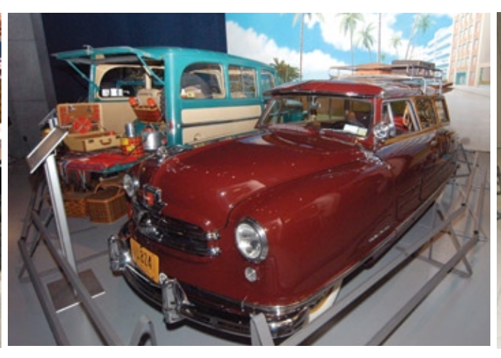
Station wagons on display at the AACA Museum complete with picnic props from the era. Nash and Jeep are represented here.