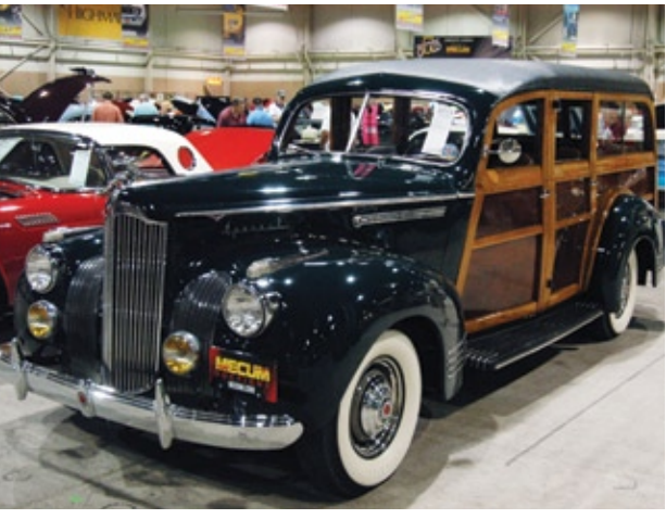
A distinguished 1941 Packard Woodie