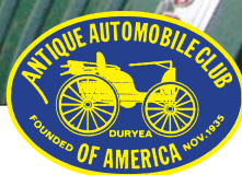
Art deco delights at Macungie