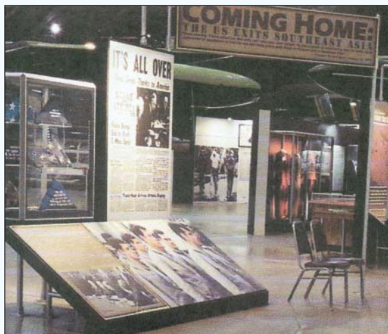
A display on returning Vietnam War POWs at the National Museum of the U.S. Air Force