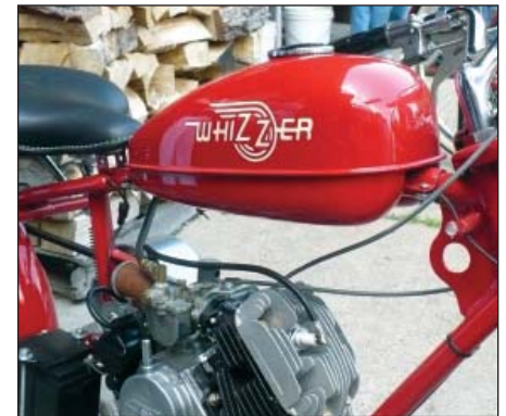
Antique Whizzer close up