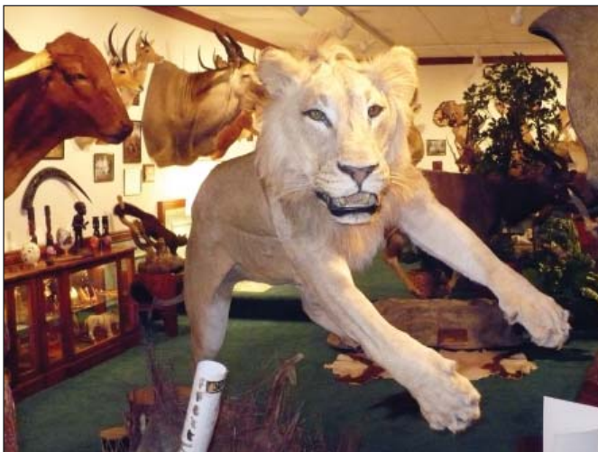
The lion leaps tonight...