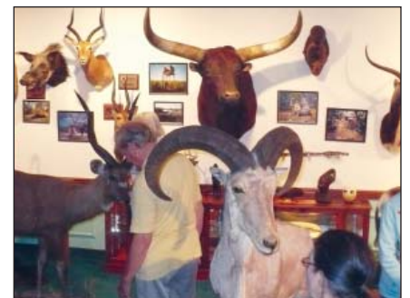
Amazing animal trophies