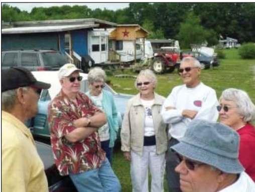
Relaxing after a fine picnic meal.