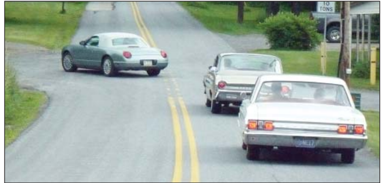
Heading down the road to L & M Campground in Indiana County.