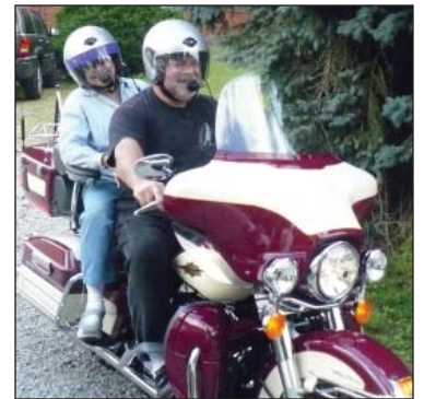
The Suraces are ready to go...