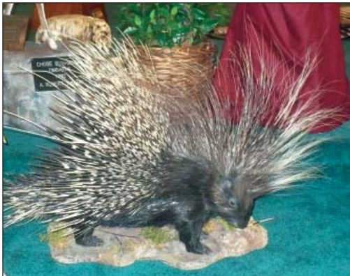
Quite the prickly porcupine