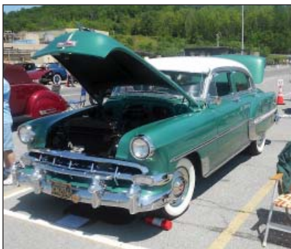
Chevrolet Bel Air