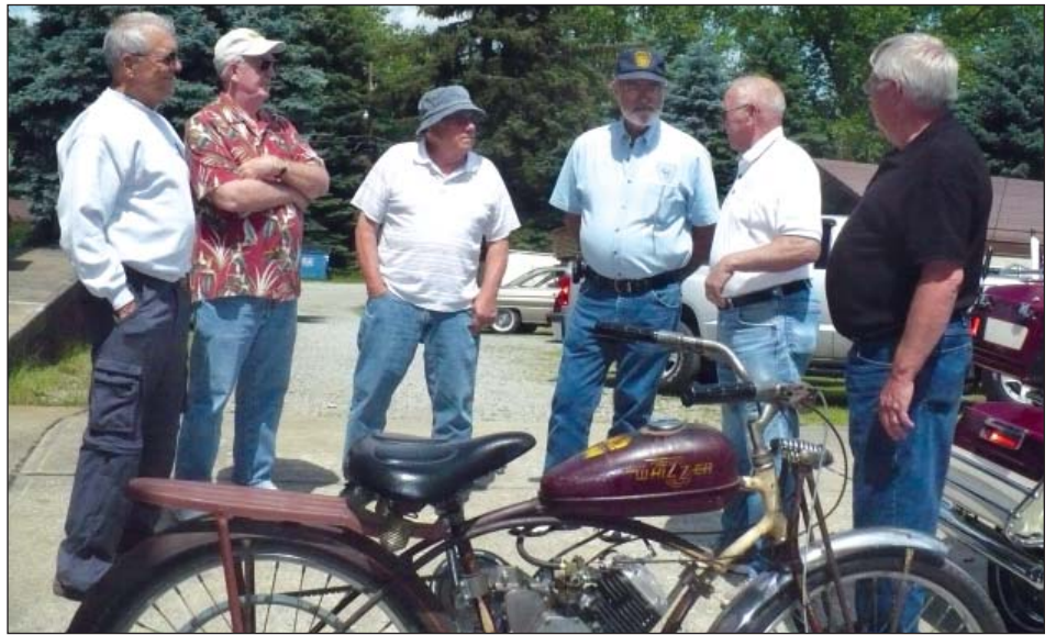
Gathering around one of the antique Whizzer bikes.