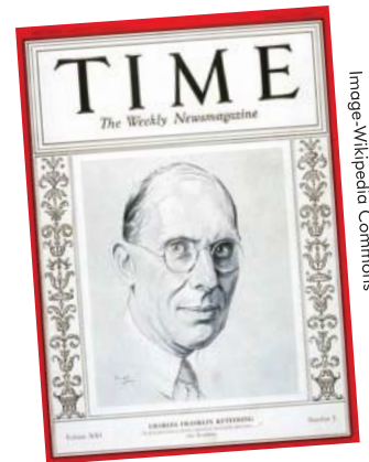
Charles Kettering on the cover of Time Magazine.