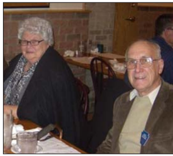
Edith and Gary Cooper