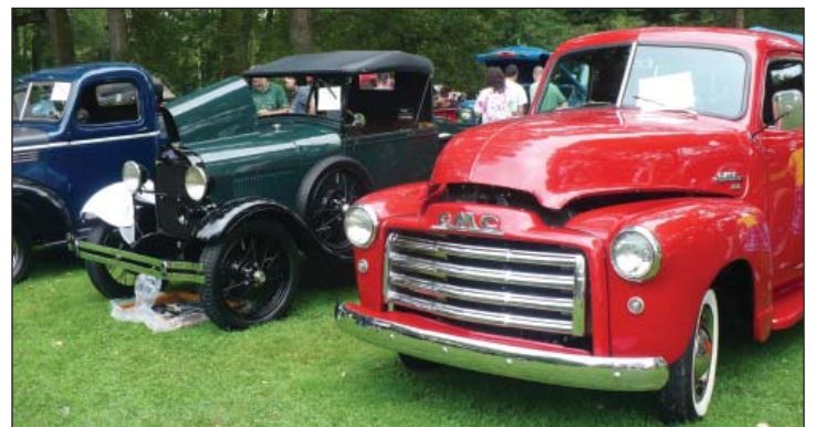
Classic trucks at the 2011 Paul P. Bell Memorial Antique Auto, Custom and Hot Rod Show