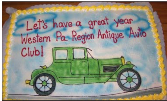
The Western PA Region takes the cake!