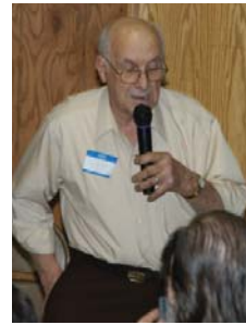
Gary Cooper, "Anything as long as it's a Ford."