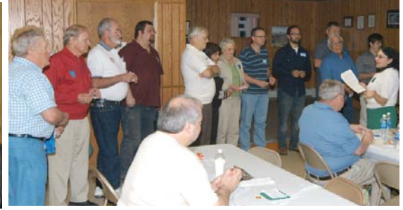
These folks won a chance to win the 2012 Chance Car.