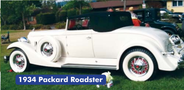
1934 Packard Roadster