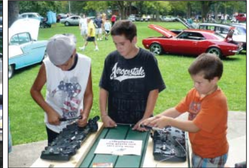
Spark plug contest stations