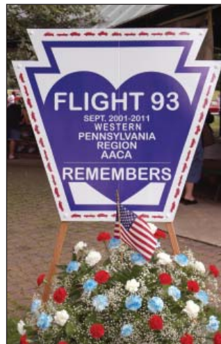
Heartfelt 9-11 Memorial