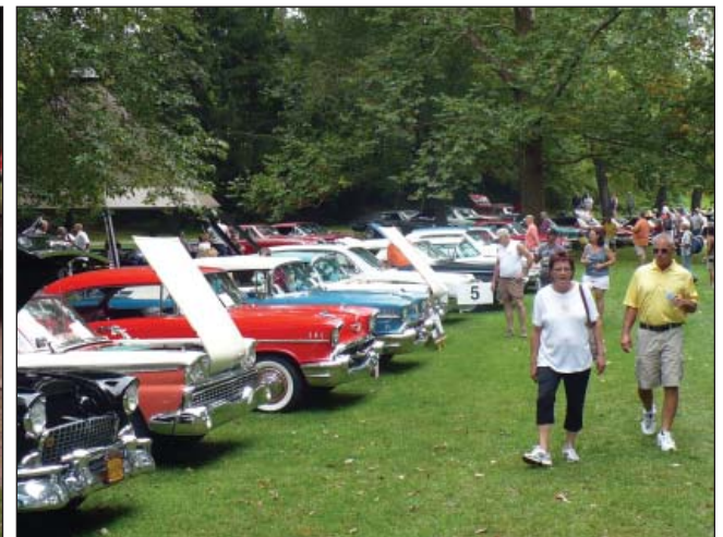
Strolling along a row of fine 1950s cars.