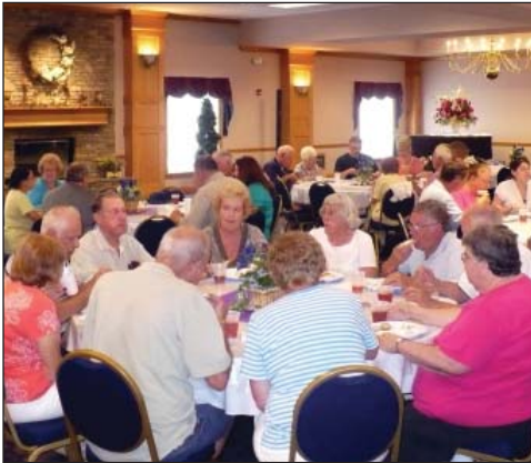
Dinner at the Word of Life Ministries Dining Room