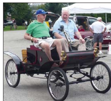
1904 Oldsmobile Replica