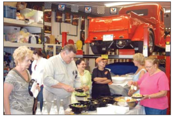
Enjoying salad with the cars at the Egers