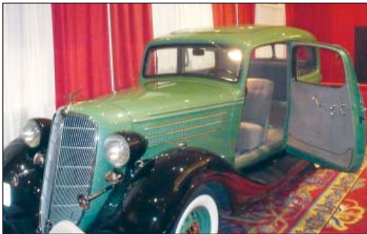
19___ Hudson Terraplane

Whoops! The photographer forgot to write down the years of these cars for the captions. Can you fill in the blanks?