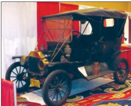
19___ Model T Ford