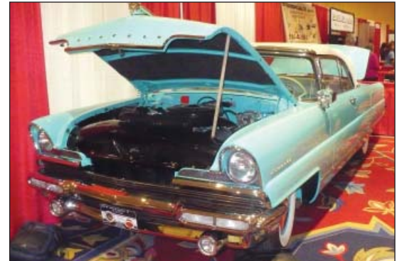
19___ Lincoln Convertible