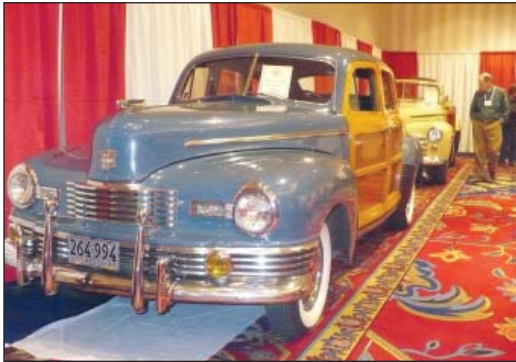
A 1947 Nash Woodie on display at the AACA Annual Meeting Trade Show