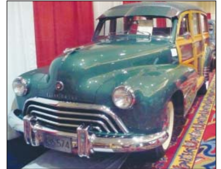
19___ Oldsmobile Woodie