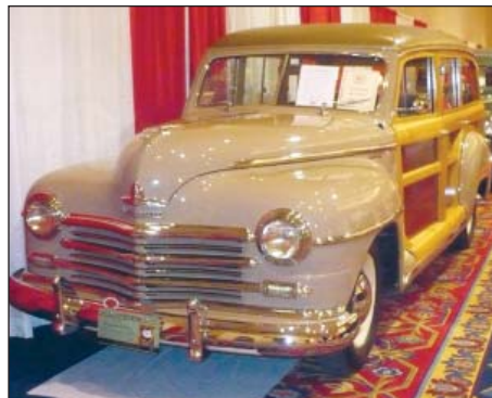
19___ Plymouth Woodie