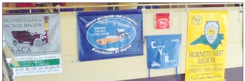
Here's just a sample of some of the colorful Region banners which hung on the balcony railing above the hotel lobby during the 75th AACA Annual Meeting. I was told its a tradition.