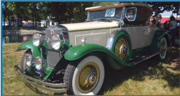
An elegant LaSalle