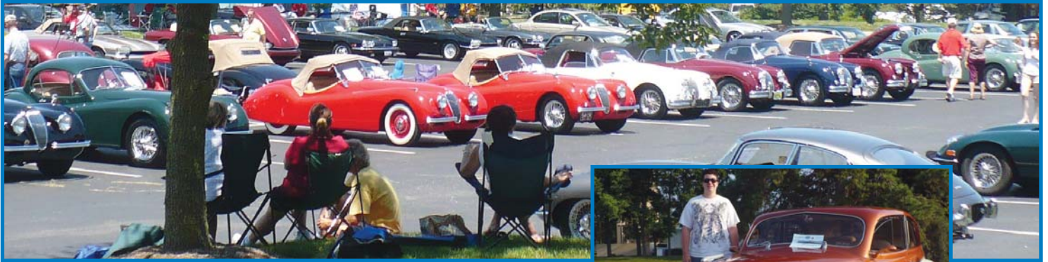
Jaguar was one of the 2011 featured marques. Others included Chevrolet, Volkswagen.