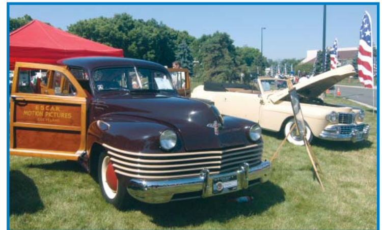
Something you don't see everyday, a 1942 Chrysler Woodie once owned by a Cleveland, Ohio-based motion picture company beside a Lincoln convertible.