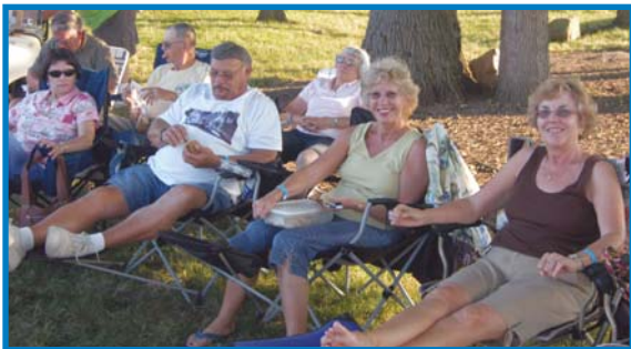
WPR members have it made in the shade.