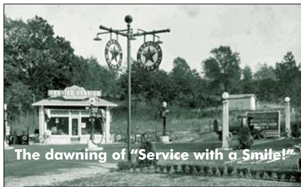
The dawning of "Service with a Smile!"