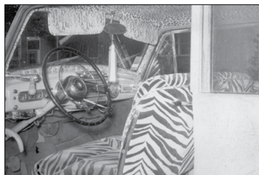
The 1946 Lincoln Continental Coupe we looked at in Erie. The owner claimed this interior was original.

At Hershey I had looked at a 1941 Lincoln, but it required