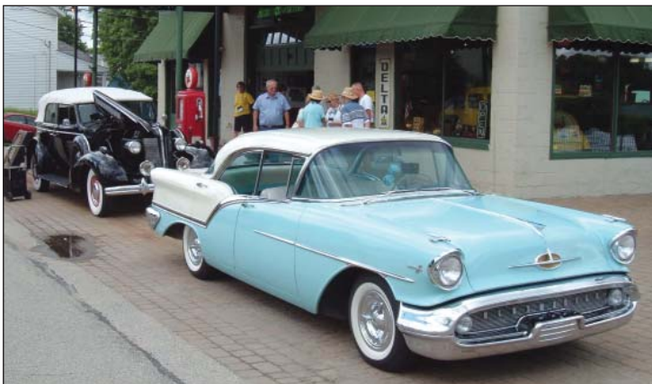
1957 classic “Olds Towmobile” pulls the disabled classic 1938 Buick convertible to Ageless Autos in New Stanton.