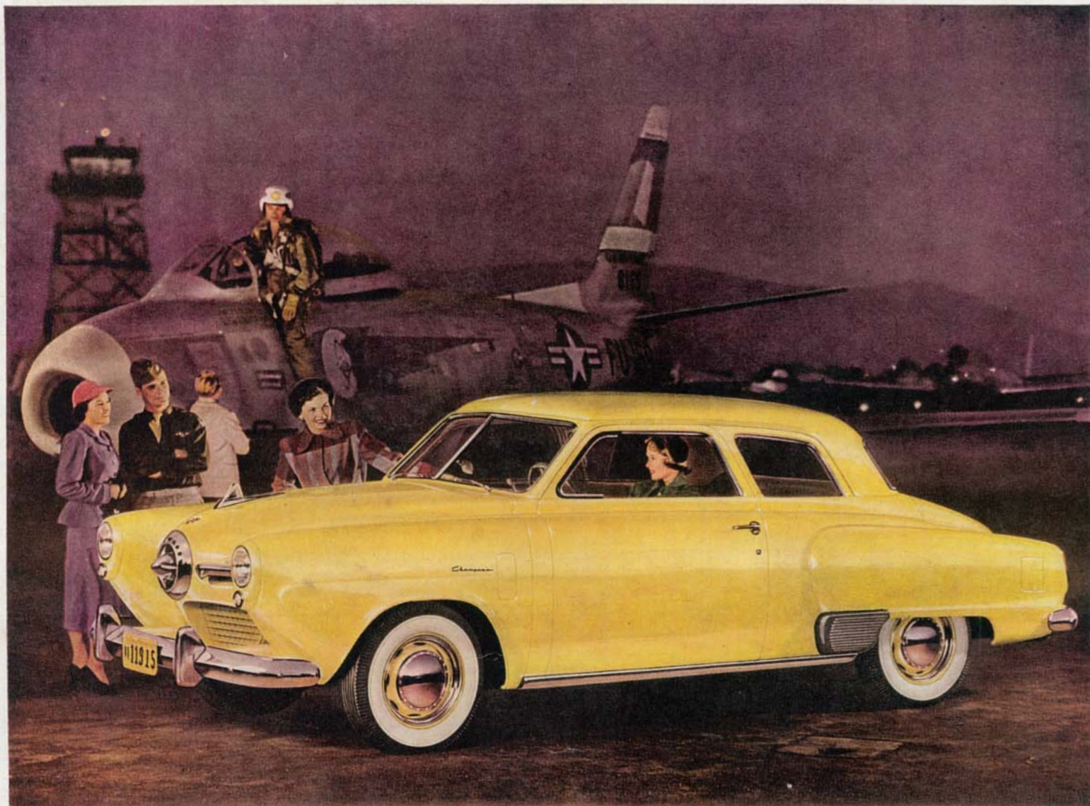
Studebaker Champion 2-door sedan