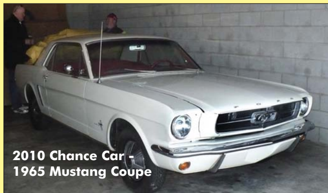
2010 Chance Car - 1965 Mustang Coupe

Contact Sally and Al Wirick 724-836-1910 to pick up a bunch of 2010 Chance Car tickets and get selling!