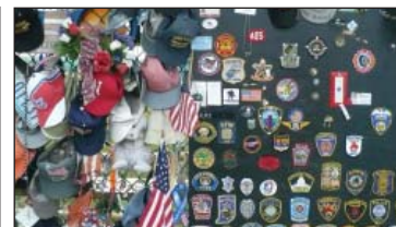
The Flight 93 National Memorial - America with it's heart poured out.

North towards the town of Windber is Bill Bahorick's Gas Station & Automobilia Museum. Bill's collection of meticulously restored antique gas pumps is absolutely astounding! There are also neon dealership signs, classic auto product promotional materials, and a nostalgic Coke-A-Cola bar surrounded by working pinball machines. This is car person "eye candy" of the highest order!