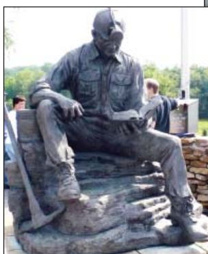
A bronze statue tribute to all coal miners at the Quecreek "Monument for Life"

Continuing on historic Route 30 we will climb to the summit of Chestnut Ridge and head into the rolling countryside.