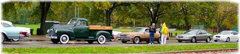
Photo from the Frostbite Tour