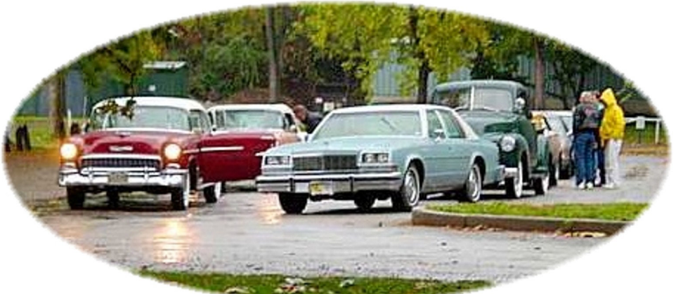
Photo from the Frostbite Tour

Our next monthly meeting is November 15 th . There is no monthly meeting in December. The Annual Meeting is scheduled for January 29, 2006. Please mark your calendars. Hope to see everyone at the November 15 th meeting. 🍷