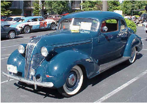
1937 Terraplane Coupe